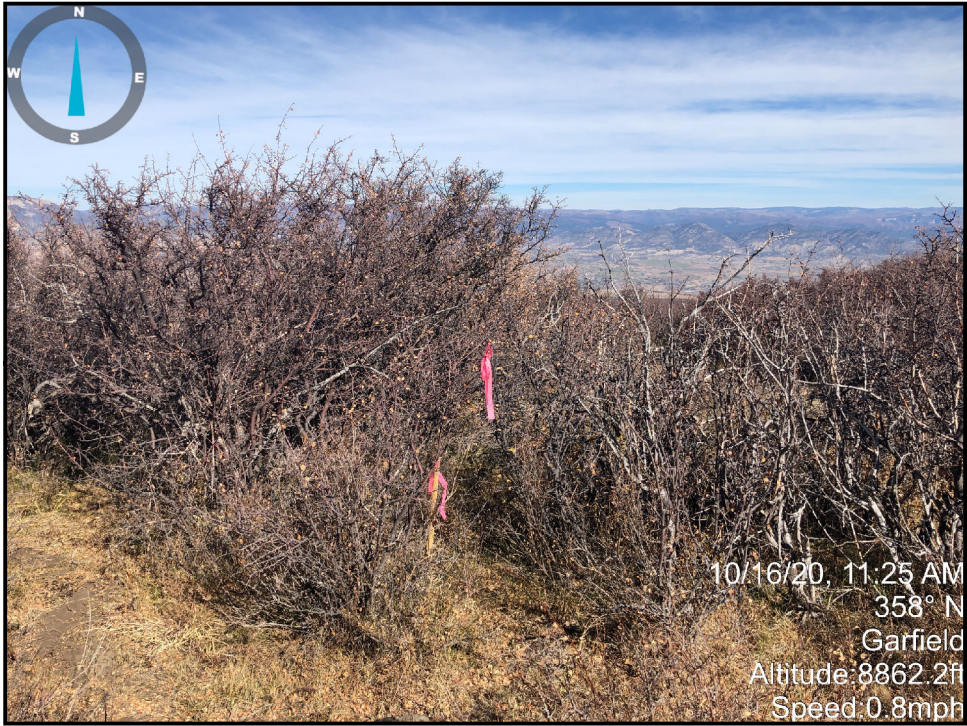
Pad Center Looking North