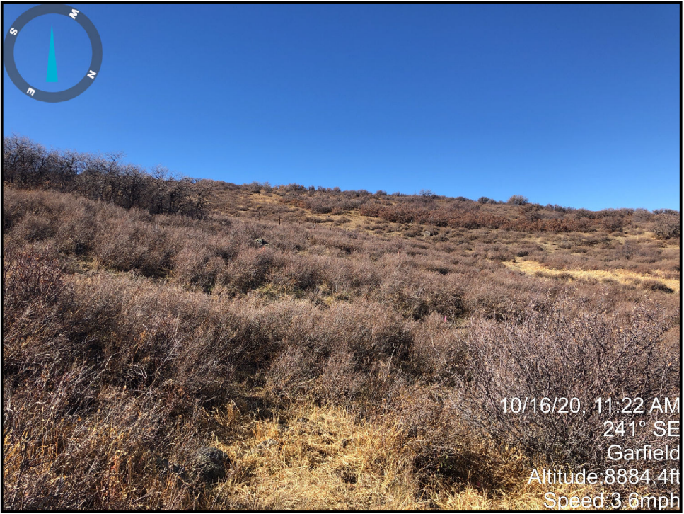
Project Access Road