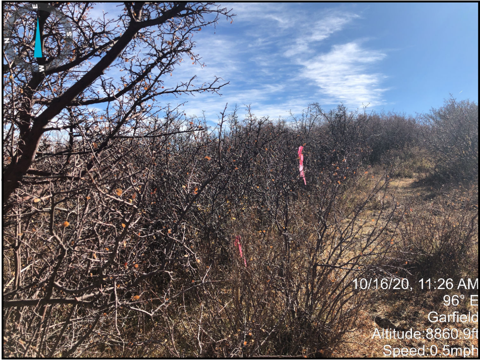
Pad Center Looking East