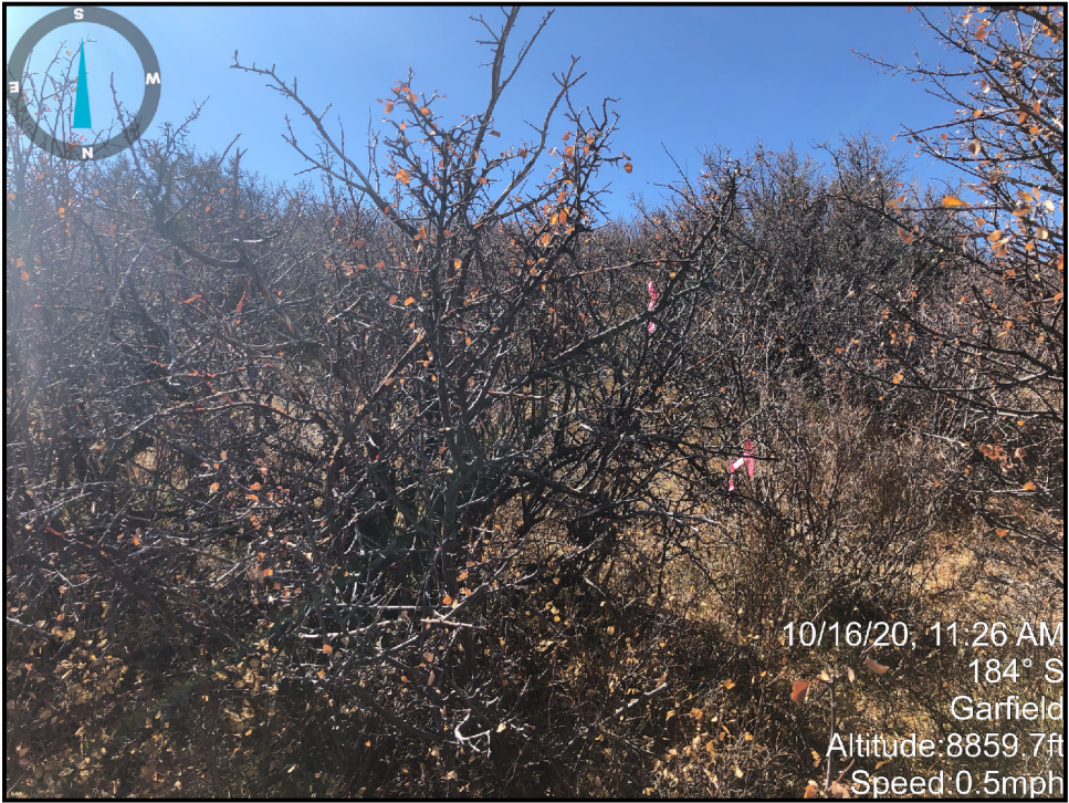
Pad Center Looking South