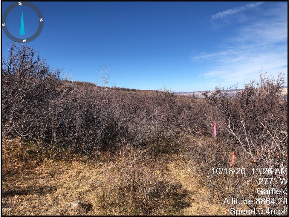
Pad Center Looking West