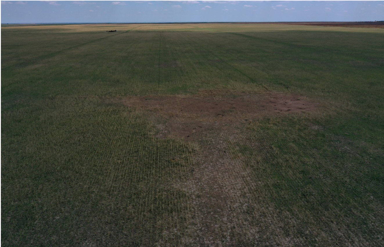
Photo 1. Facing south at the former well site. The crop has not re-established in the area shown in photo. There is possible soil issues preventing crop establishment.