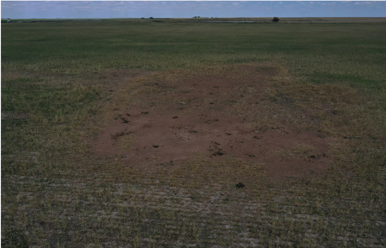
Photo 3. Facing east at the former well site. The crop has not re-established in the area shown in photo. There is possible soil issues preventing crop establishment.