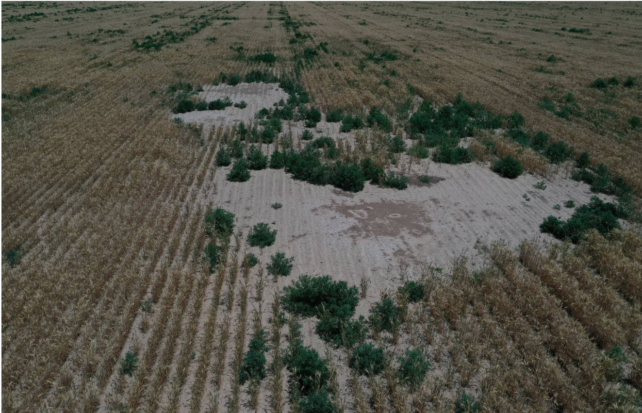
Photo 1. Facing east at former well site. The crop has not re-established in the area shown in photo. There is possible soil issues preventing crop establishment.