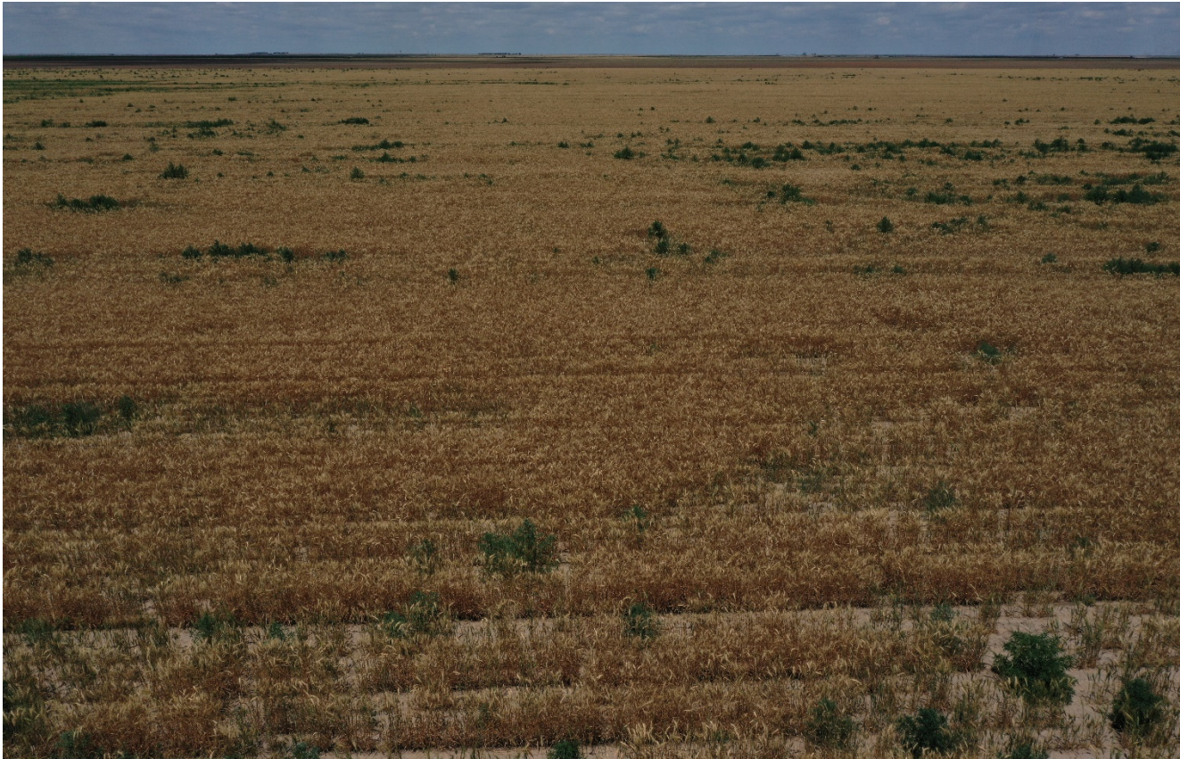
Photo 3. Facing north toward the surround crop vegetation cover.