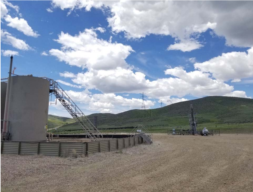
Photo 1. Overview of location taken at entrance facing west.