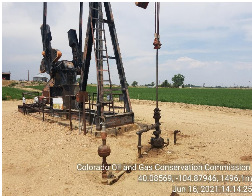
Photo 9 Stained soil around well head.