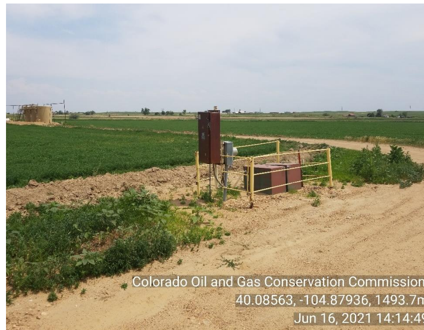
Photo 10 electric panel. Breaker in the on position.