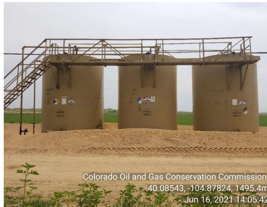
Photo 4 Labels and placards faded not readable.