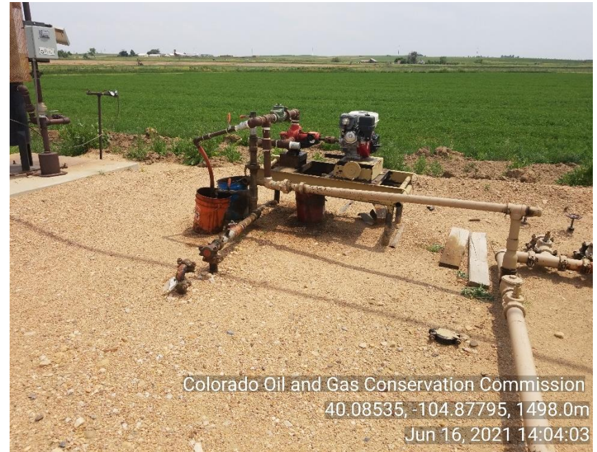
Photo 2 Recirc pump. Stained soil and mechanical issues.