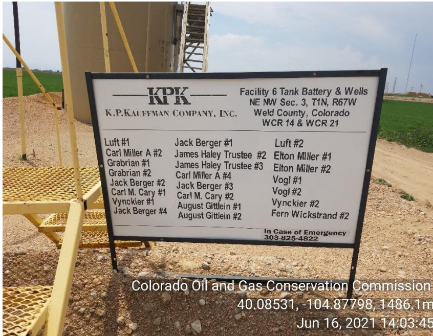
Photo 1 TNK BTRY sign