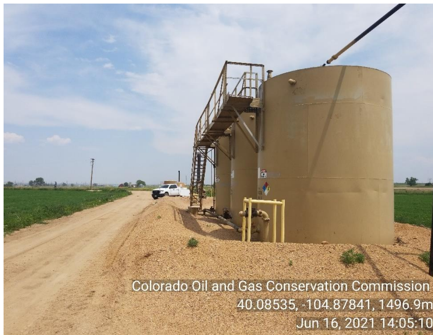
Photo 3 TNK BTRY