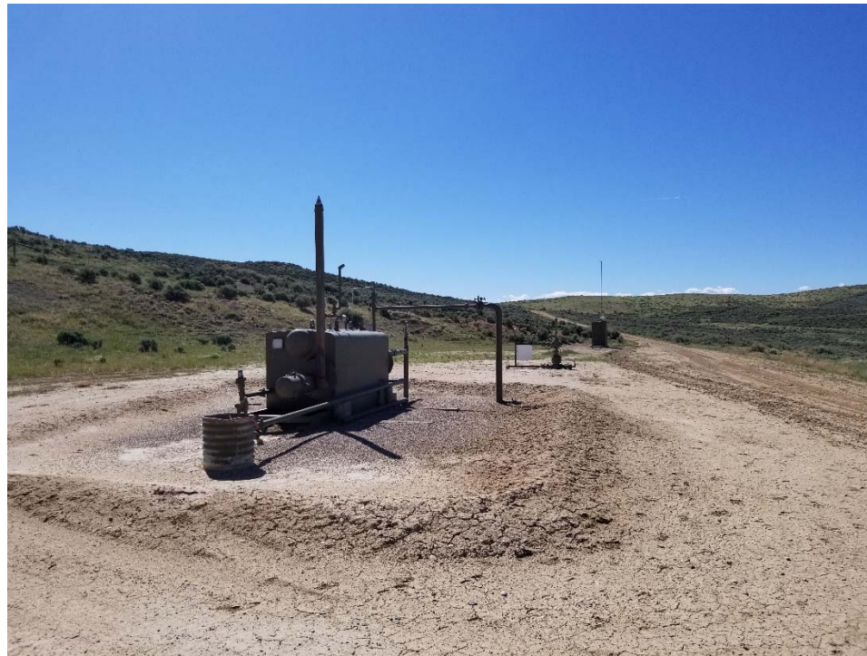
Photo 1. Overview of location taken facing south.