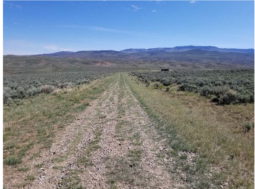
Photo 4. Access road overgrown.