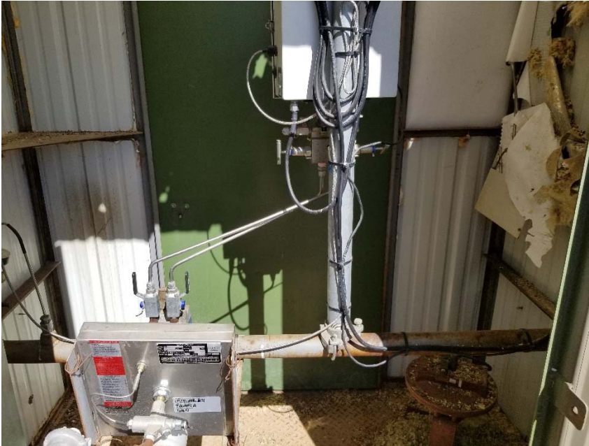
Photo 3. No gas meter calibration in meter run.