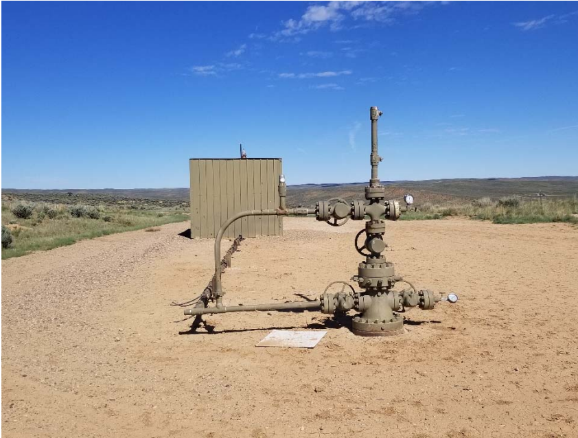
Photo 1. Overview of location taken facing west.