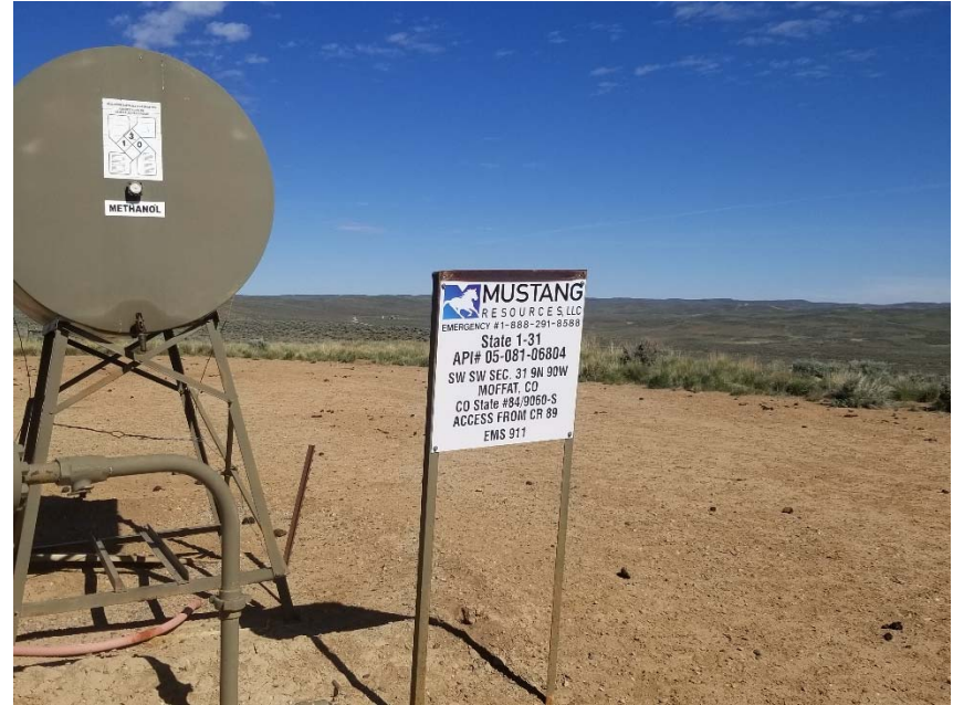
Photo 2. Wellhead sign contains previous operator and emergency contact information.