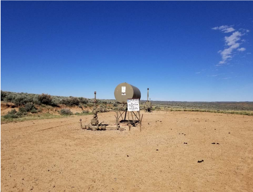
Photo 1. Overview of location taken facing west.