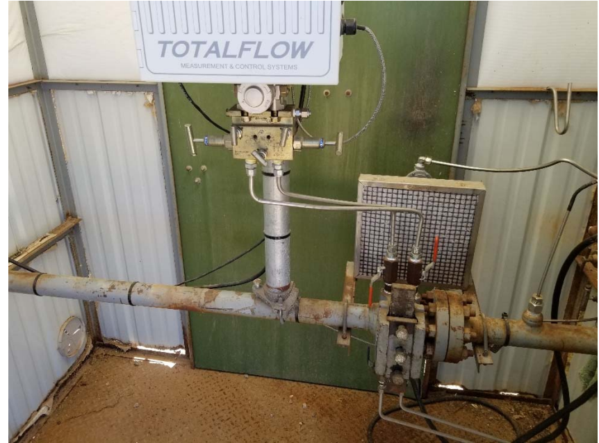
Photo 4. No calibration in gas meter run.