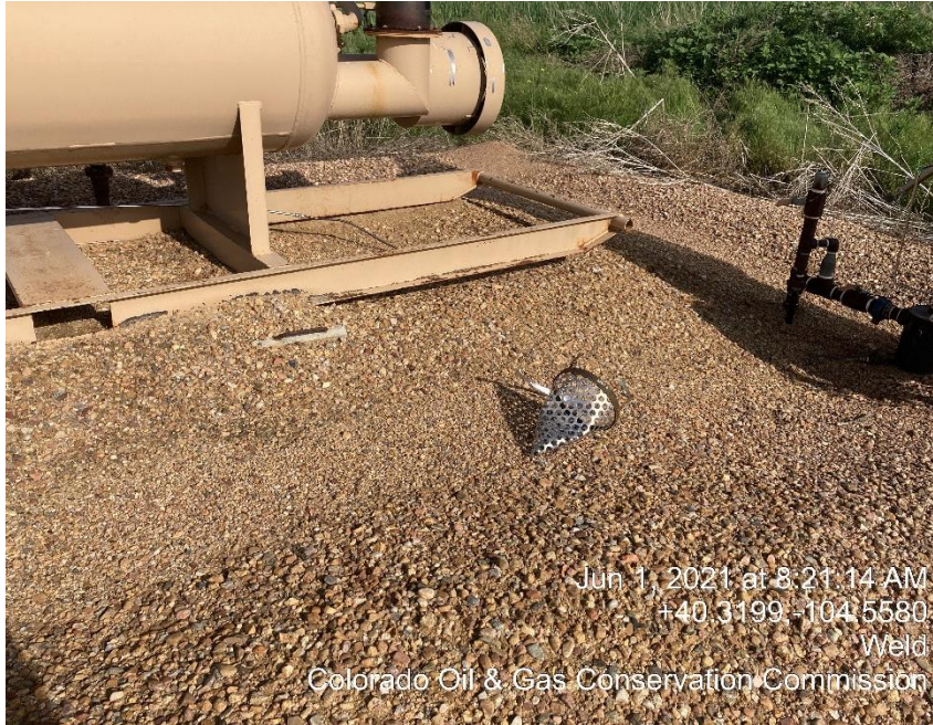
Photo #3 Bird Protector that appears to have come from the separator.