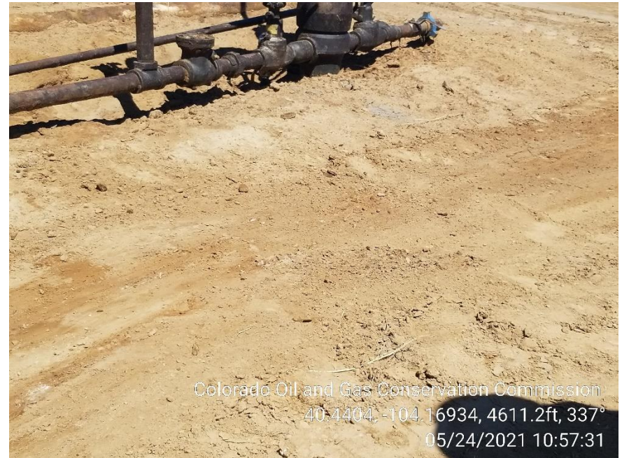
Photo – Stained Soil at Wellhead has been mitigated