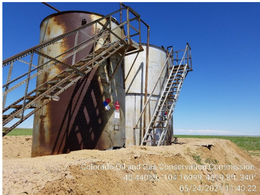
Photo 5 – Tank Battery – 500 BBL Tank is scheduled to be removed. 210 BBL Tank to remain – Deemed NOT Visible from Roadway and Rust NOT a Mechanical Issue at this time.