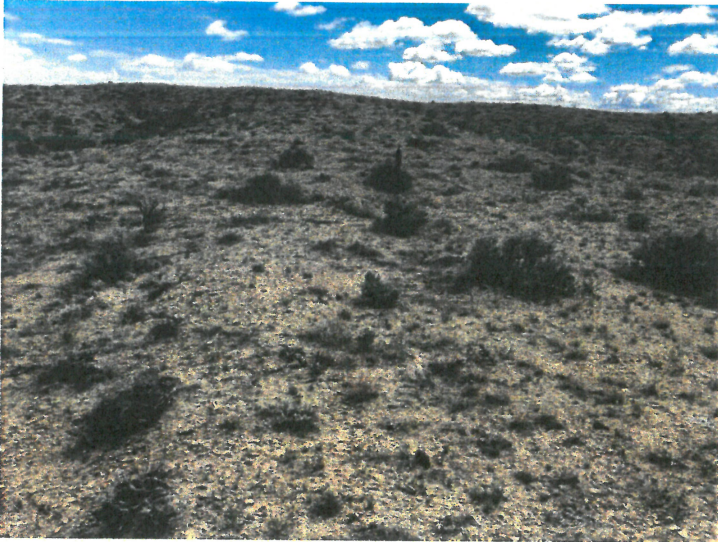
Grand Mesa Operating's Federal 34-2 Well (8-104-34) Surface Abandonment Inspection on 04/28/2021 (plugged 1983)