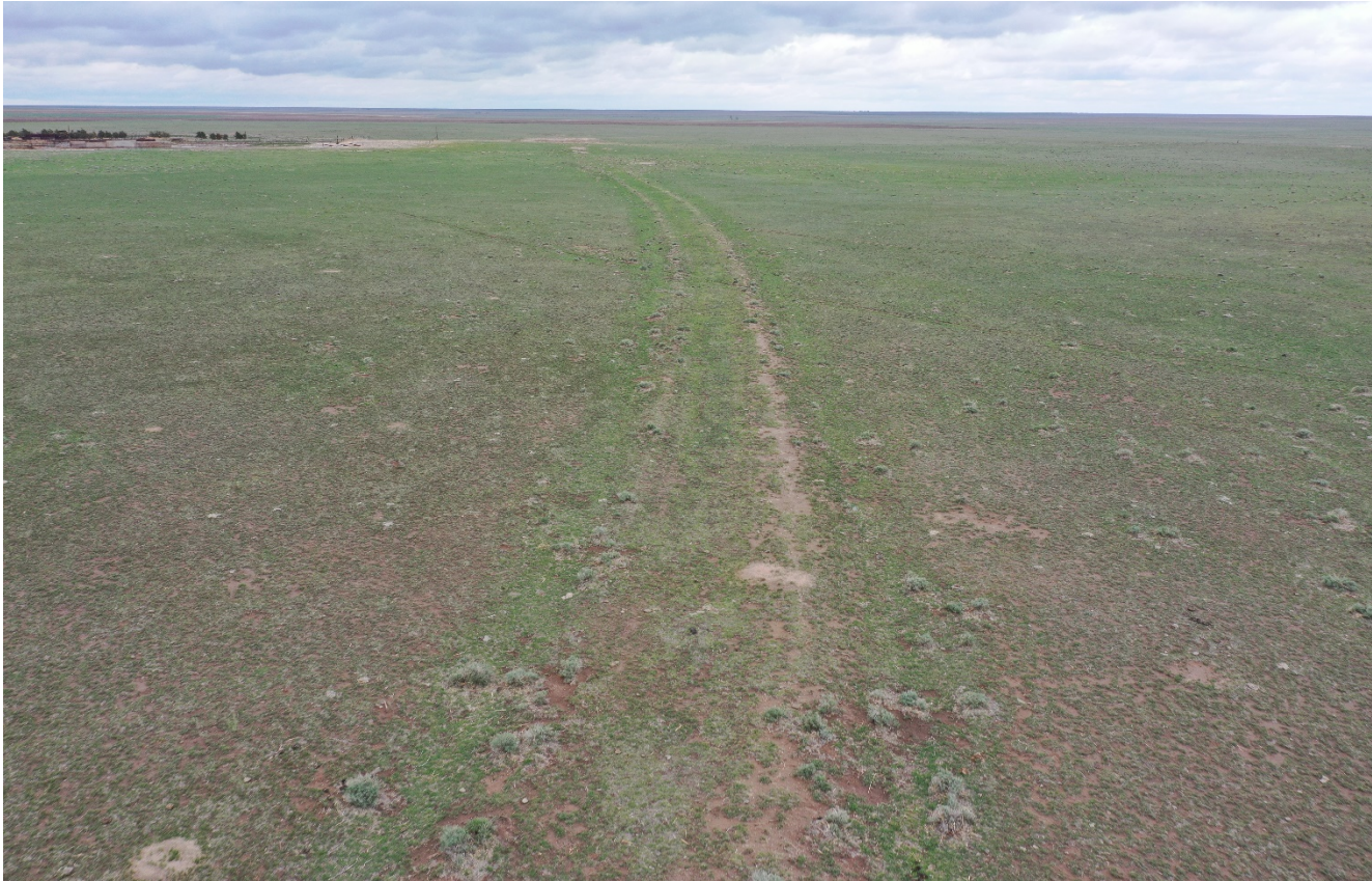
Photo 1. Facing north along the former access road.