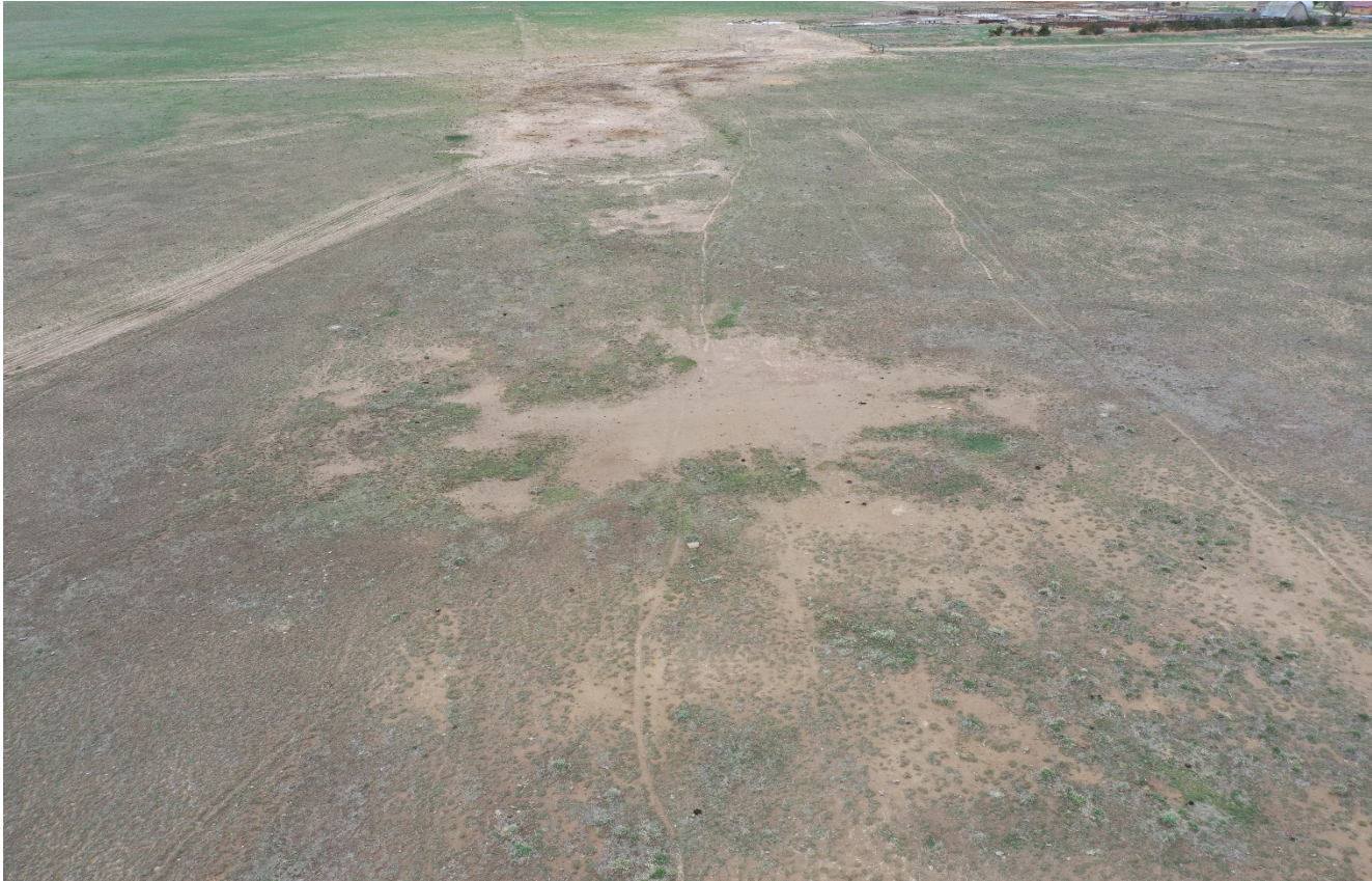
Photo 3. Facing south toward the well site. The location remains mostly devoid of vegetation growth. There is no indication that reclamation was performed.