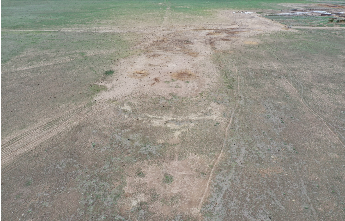
Photo 4. Facing south toward the battery site. The location remains mostly devoid of vegetation growth. There is no indication that reclamation was performed.