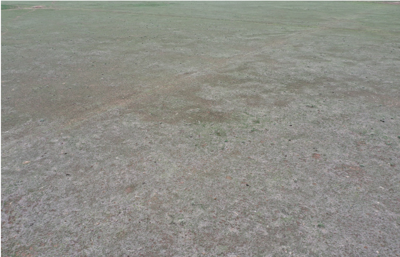
Photo 5. Facing south toward the surrounding undisturbed pasture which shows a uniform vegetation cover.