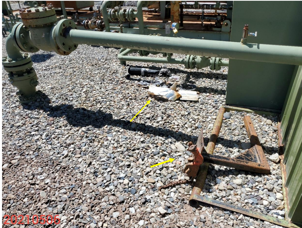
Photo 15: Photo taken from the western area of the production area. Photo shows various unused equipment, trash or debris observed on the Location. Remove unused equipment, trash and debris in accordance with Rule 606.