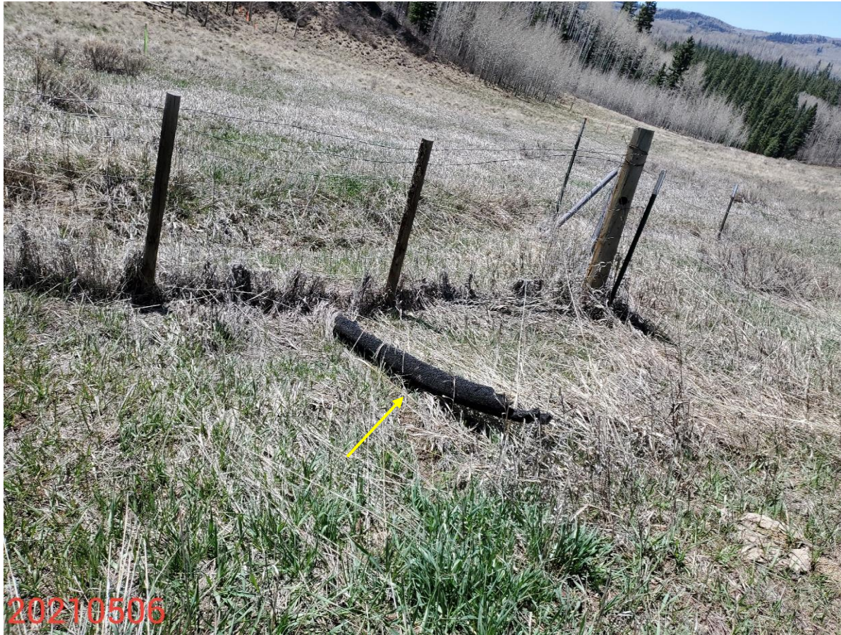
Photo 12: Photo taken from the southern end of the Location. Photo shows various unused equipment, trash or debris observed on the Location. Remove unused equipment, trash and debris in accordance with Rule 606.