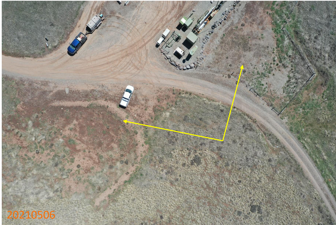
Photo 20: 5/6/2021 aerial image. Photo shows areas on the south and west ends of the Location where equipment was Location. Areas are not needed for production and require reclamation in accordance with Rule 1003.a.