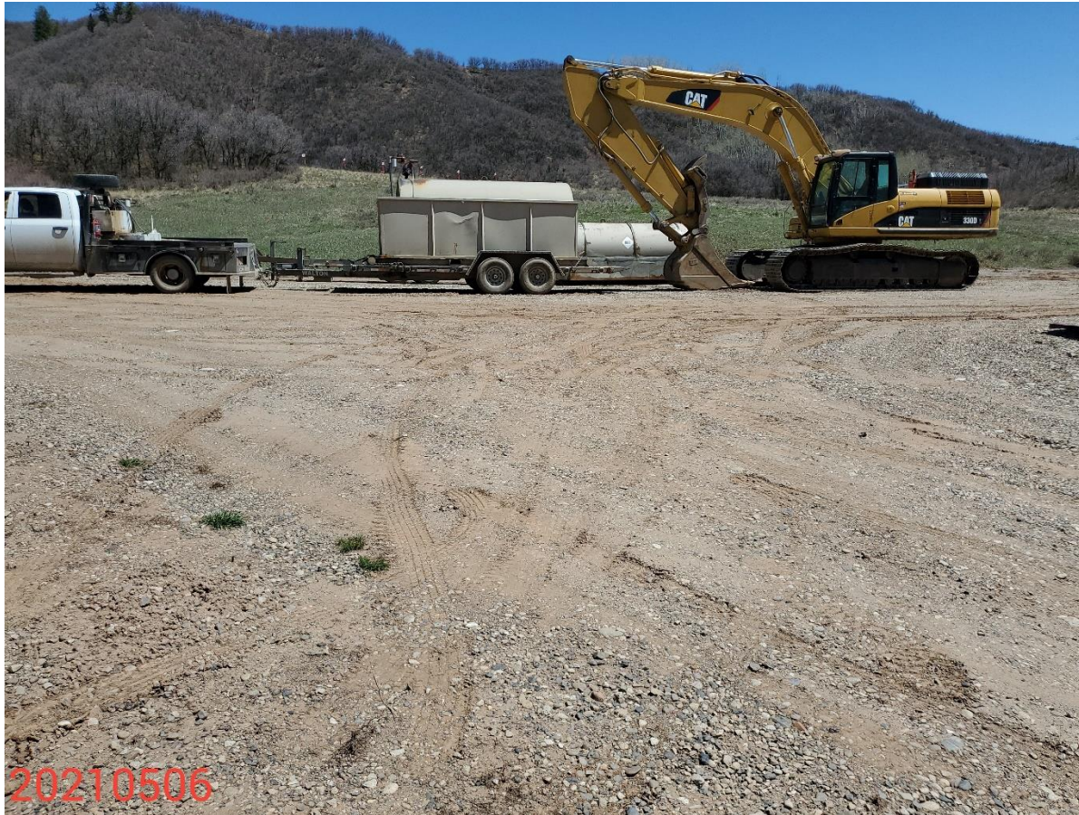
Photo 1: Photo taken from the western end of the Location, facing north. Photos 1-3 provide an overview of the production areas of the Location from north, east to southeast. Equipment mob in process for construction on an adjacent Location.