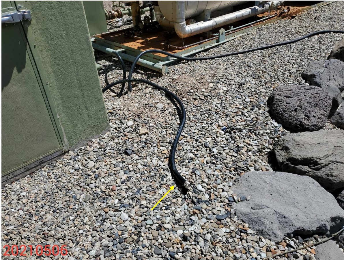
Photo 7: : Photo taken from the southern area of the production area. Photo shows various unused equipment, trash or debris observed on the Location. Remove unused equipment, trash and debris in accordance with Rule 606.