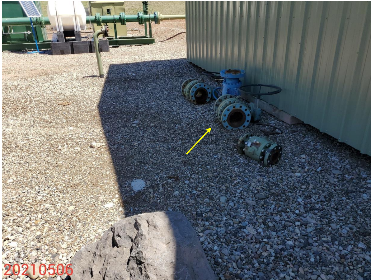
Photo 10: : Photo taken from the southern area of the production area. Photo shows various unused equipment, trash or debris observed on the Location. Remove unused equipment, trash and debris in accordance with Rule 606.