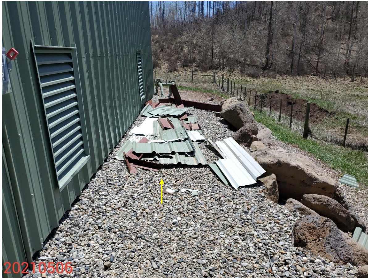
Photo 11: Photo taken from the southern area of the production area. Photo shows various unused equipment, trash or debris observed on the Location. Remove unused equipment, trash and debris in accordance with Rule 606.