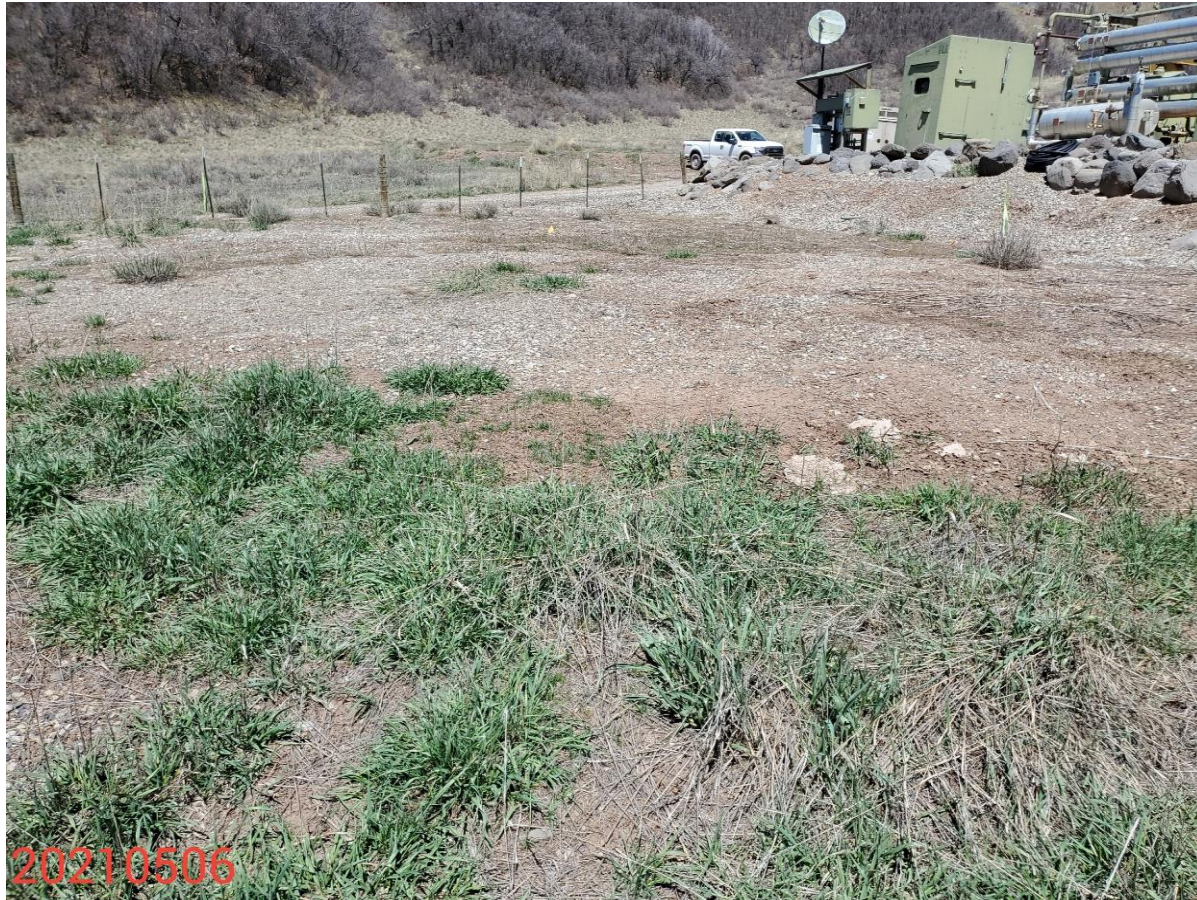
Photo 16: Photo taken from the southeastern end of the Location, facing northwest. Photo shows areas of the Location not needed for production; areas require reclamation in accordance with 1003 rules.