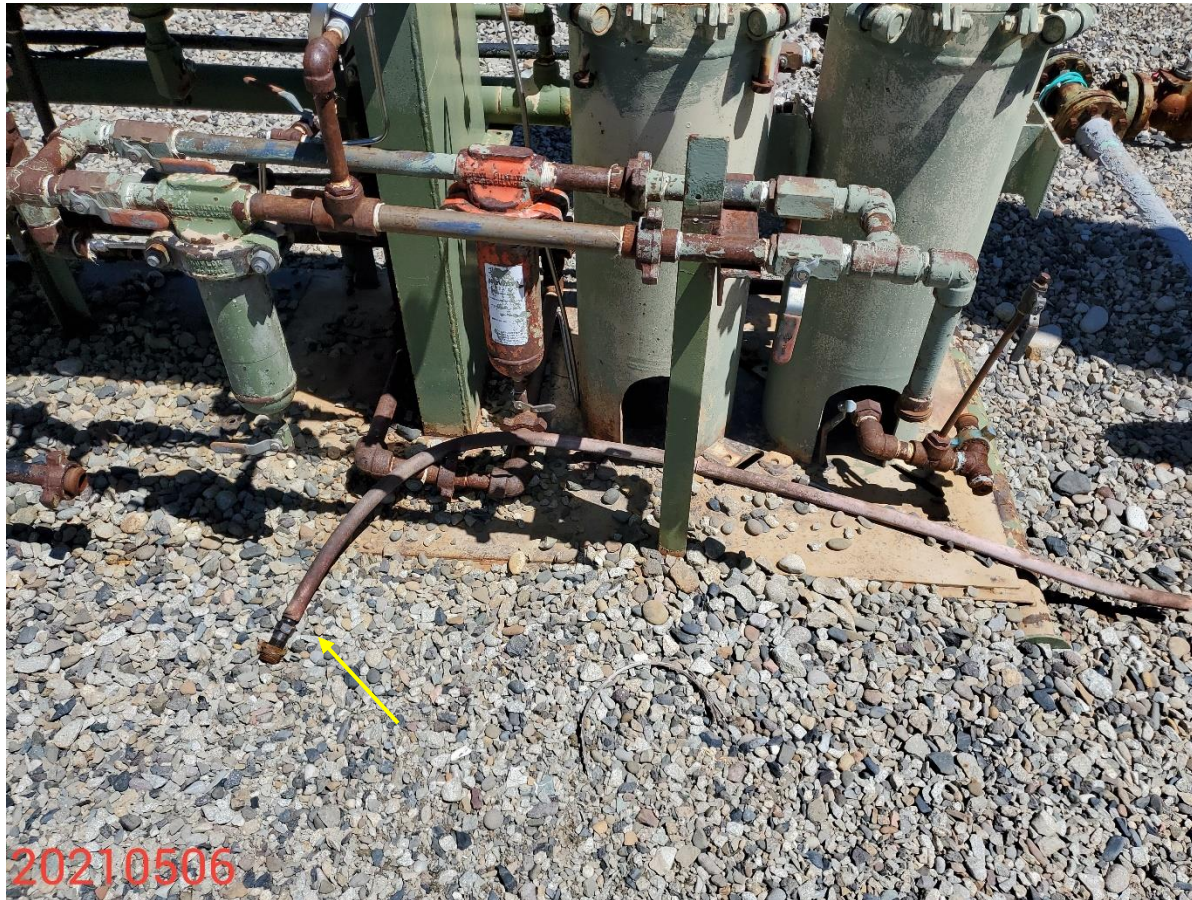
Photo 9: : Photo taken from the southern area of the production area. Photo shows various unused equipment, trash or debris observed on the Location. Remove unused equipment, trash and debris in accordance with Rule 606.