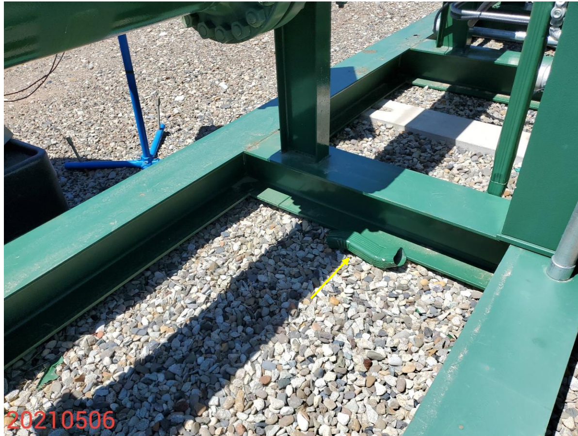
Photo 14: Photo taken from the northern end of the production area. Photo shows various unused equipment, trash or debris observed on the Location. Remove unused equipment, trash and debris in accordance with Rule 606.