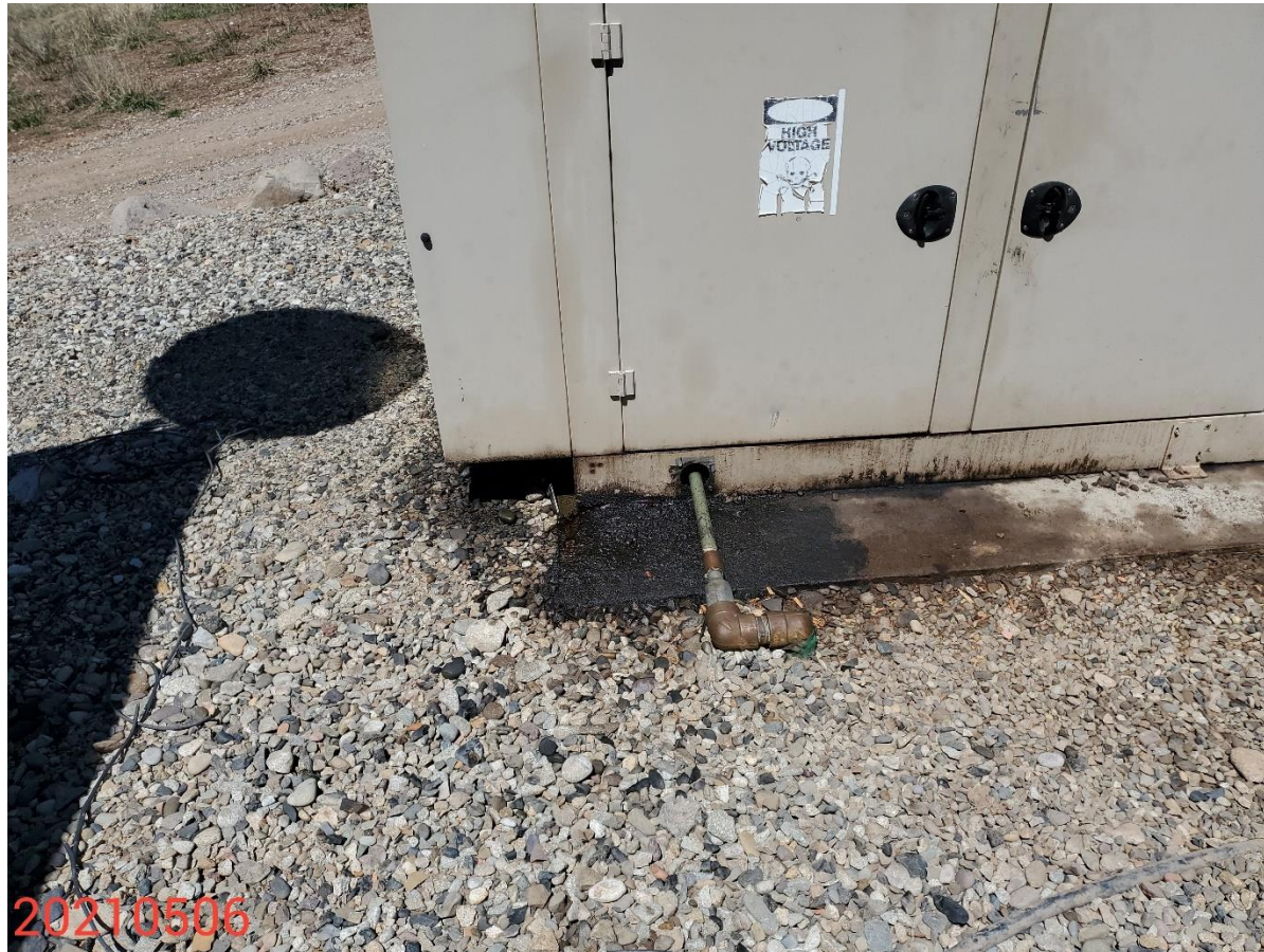
Photo 4: Photo taken from the west end of the Location. Photo shows equipment that appears to be leaking; spill/stained soils observed around base of equipment. Ensure proper mechanical conditions of equipment to prevent further leaking and clean spill.