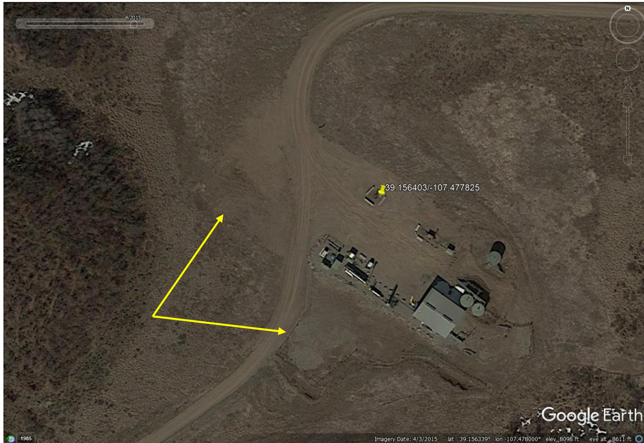
Photo 19: 2015 Google Earth aerial imagery. Photo shows equipment was removed from the south and west ends of the Location, sometime between 2011 and 2015