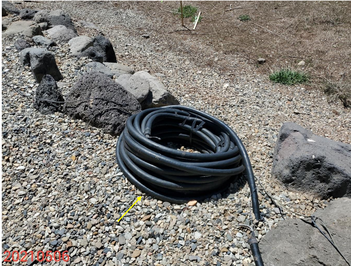
Photo 8: : Photo taken from the southern area of the production area. Photo shows various unused equipment, trash or debris observed on the Location. Remove unused equipment, trash and debris in accordance with Rule 606.