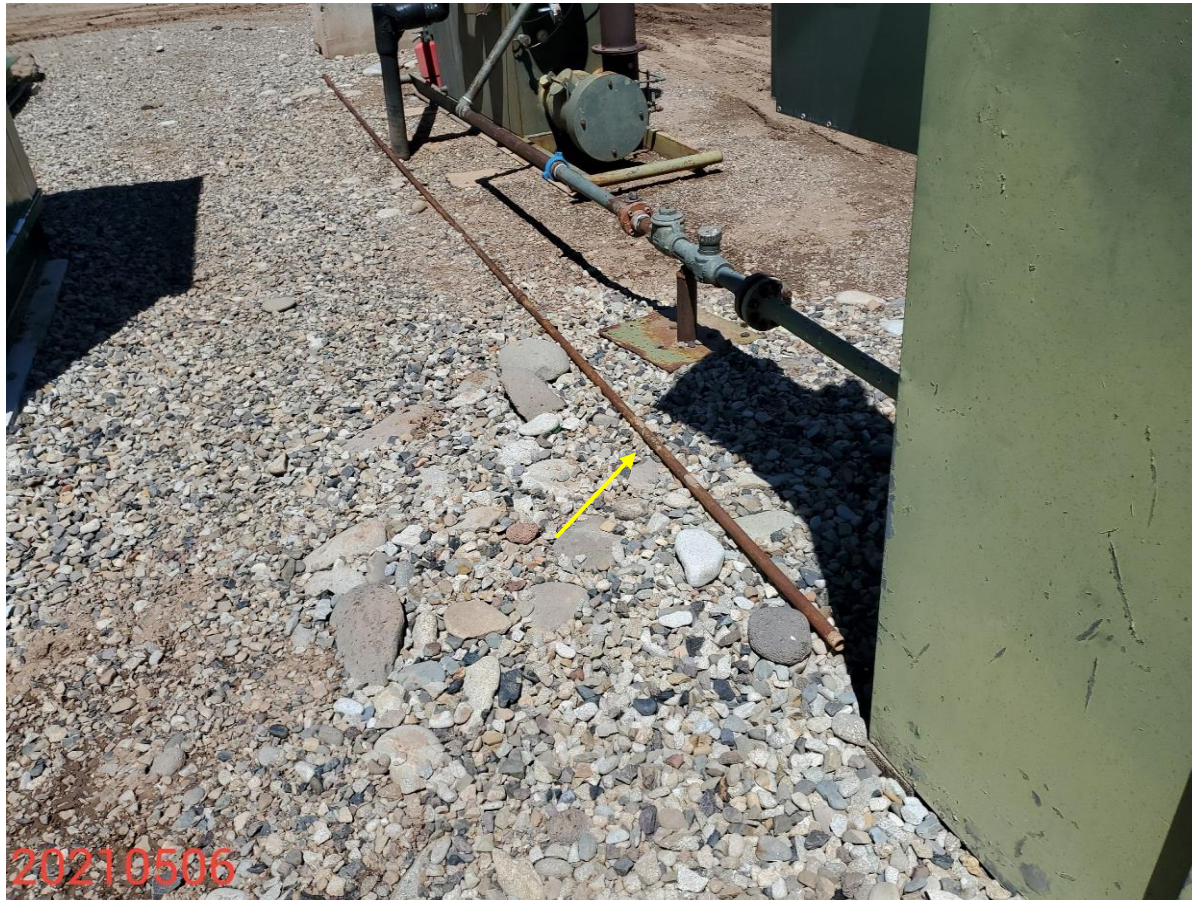
Photo 13: Photo taken from the northern area of the production area. Photo shows various unused equipment, trash or debris observed on the Location. Remove unused equipment, trash and debris in accordance with Rule 606.