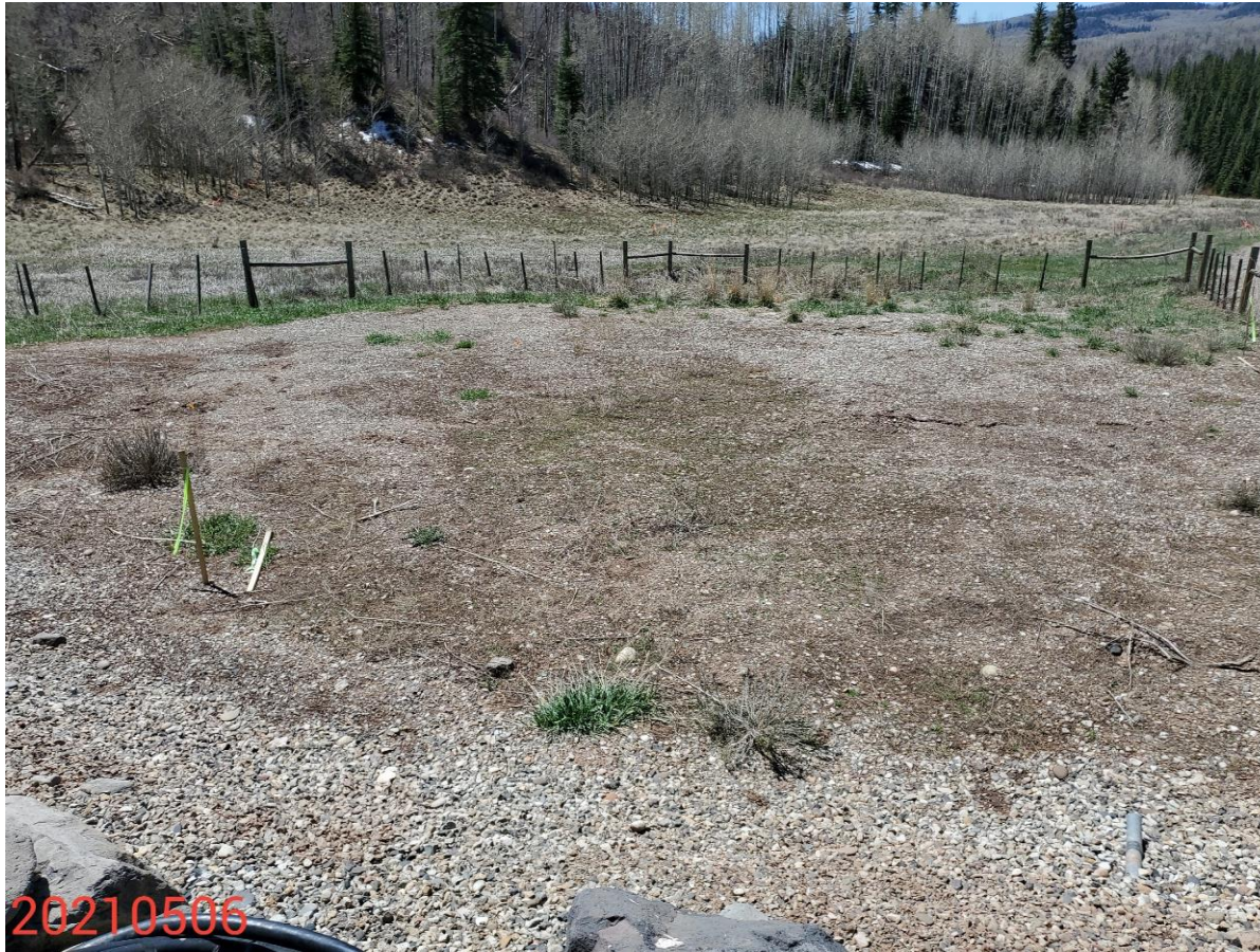
Photo 17: Photo taken from the western end of the Location, facing southeast. Photo shows areas of the Location not needed for production; areas require reclamation in accordance with 1003 rules.