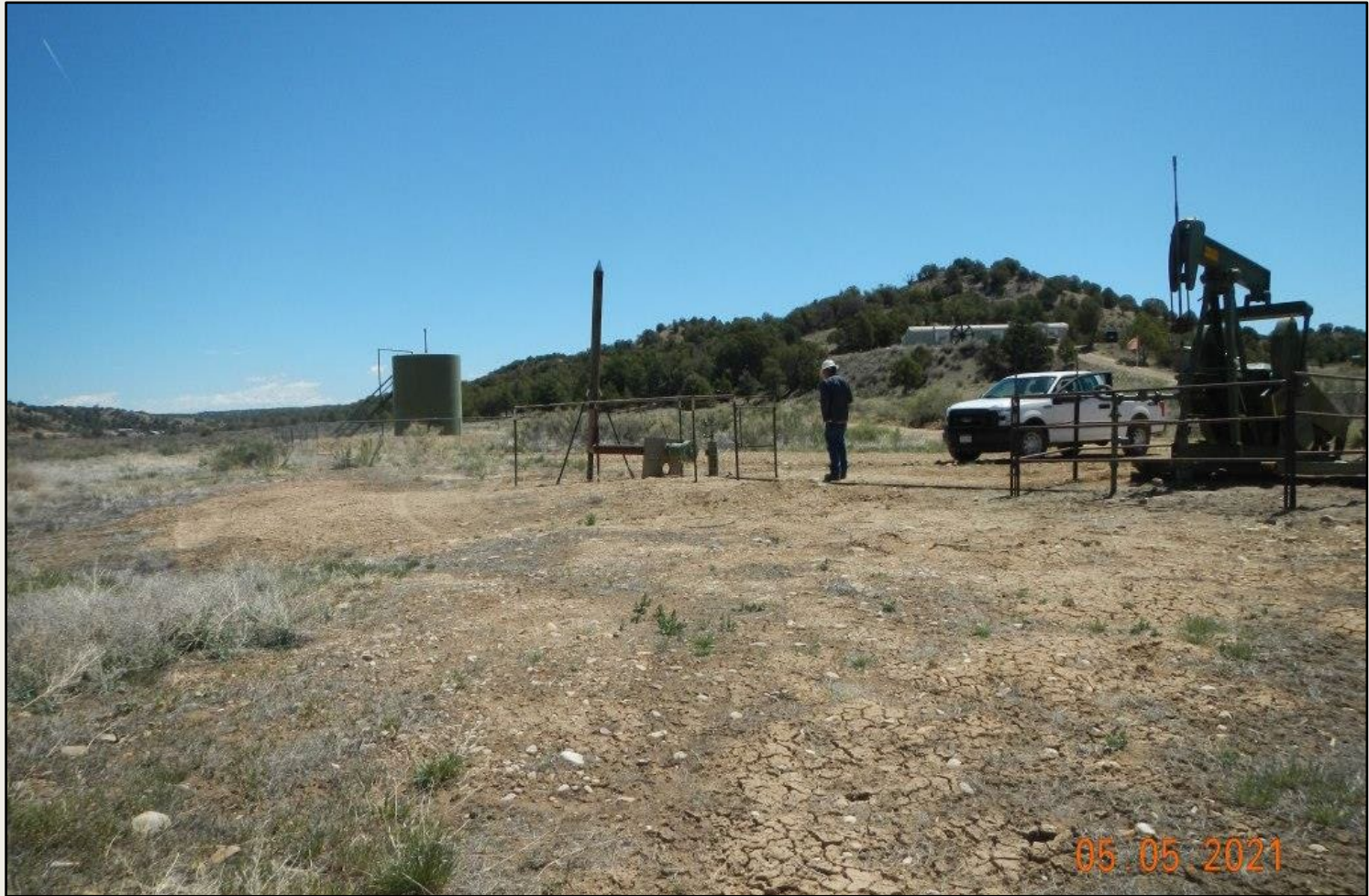
Photo 1. View of the project area from the northwestern corner facing center.