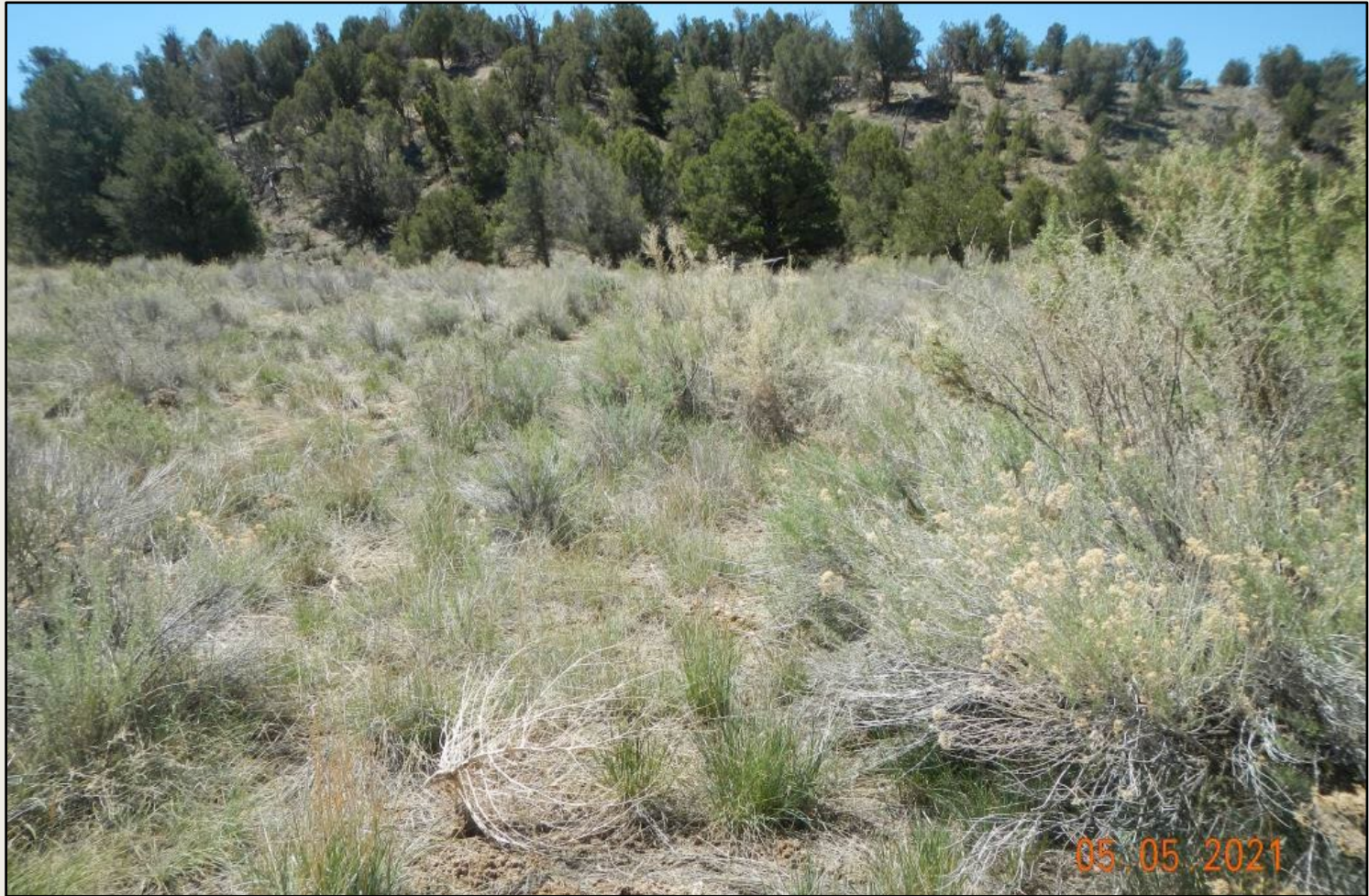
Photo 4. View of the reference area comprised of greasewood, rabbitbrush, and sagebrush shrubland with understory of grasses such as smooth brome and crested wheatgrass.