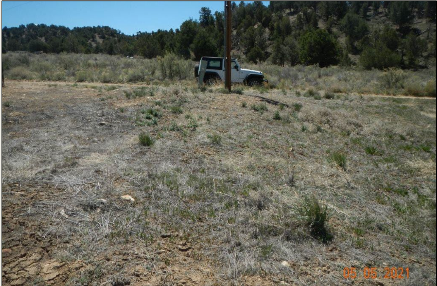
Photo 3. View of the western project area facing southward.