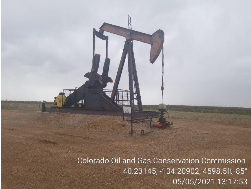
Colorado Oil and Gas Conservation Commission 40.23145, -104.20902, 4598.5ft, 85° 05/05/2021 13:17:53