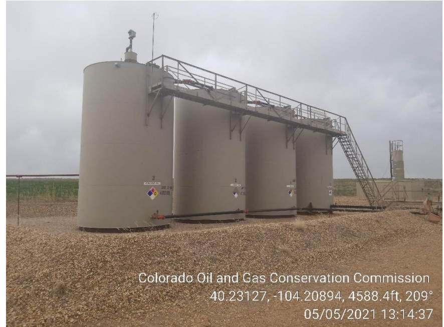
Colorado Oil and Gas Conservation Commission 40.23127, -104.20894, 4588.4ft, 209° 05/05/2021 13:14:37