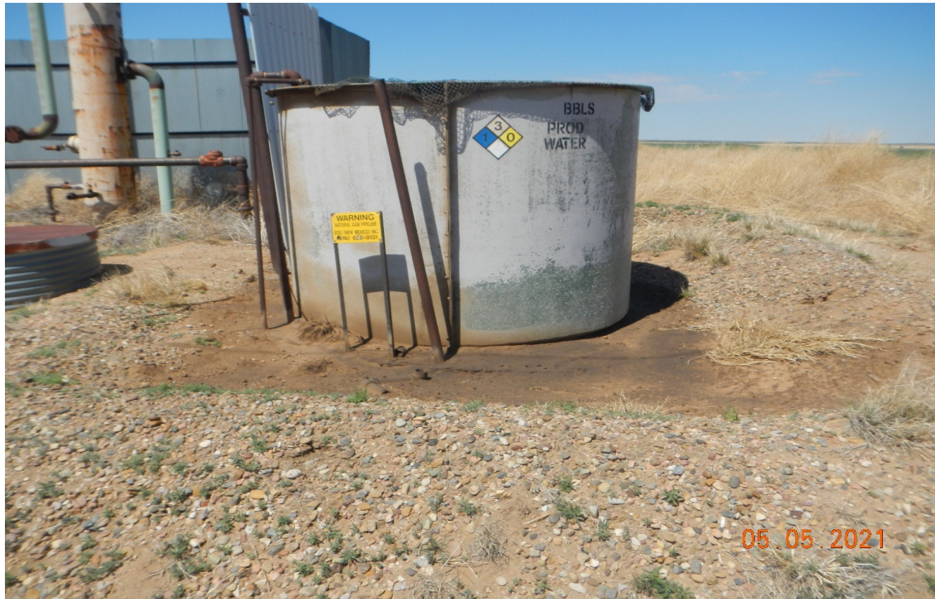
Photo 2. There is oil stained soil near the Produced Water tank. The tank is labeled produced water but appeared to contain oil inside. Netting was over the top of tank. Additionally the berm does not appear to be sufficient to contain a spill.