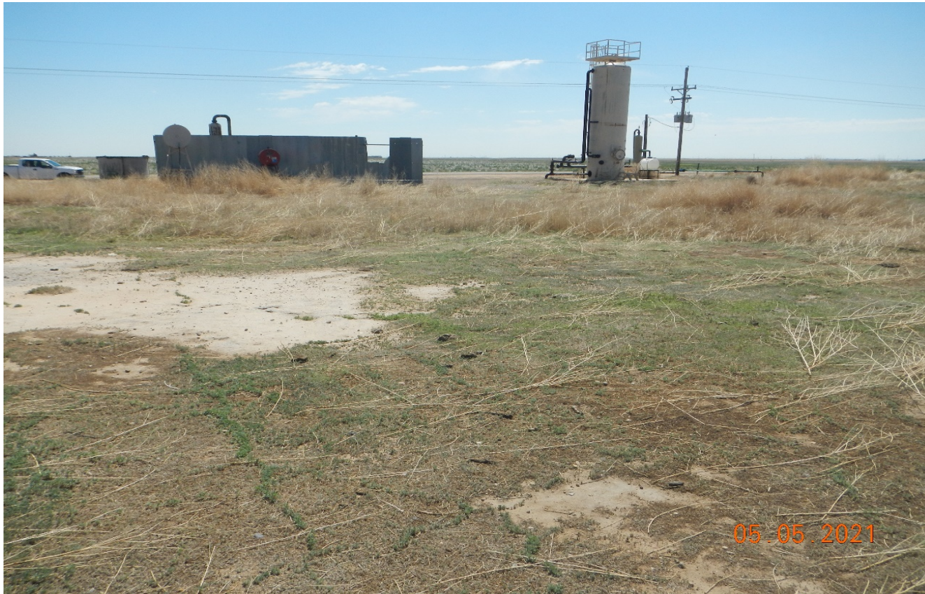
Photo 9. Facing southeast behind the compressor facility. There is undesirable weeds throughout this disturbed area which weeds will need to be controlled and the disturbance area reclaimed.