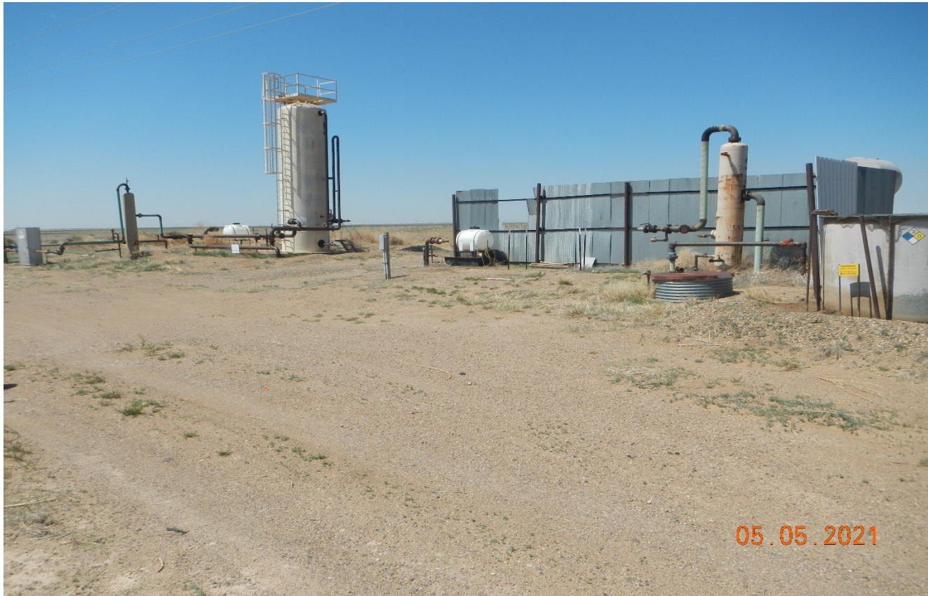
Photo 9. Facing southwest toward the location which is adjacent to County Rd. 44.