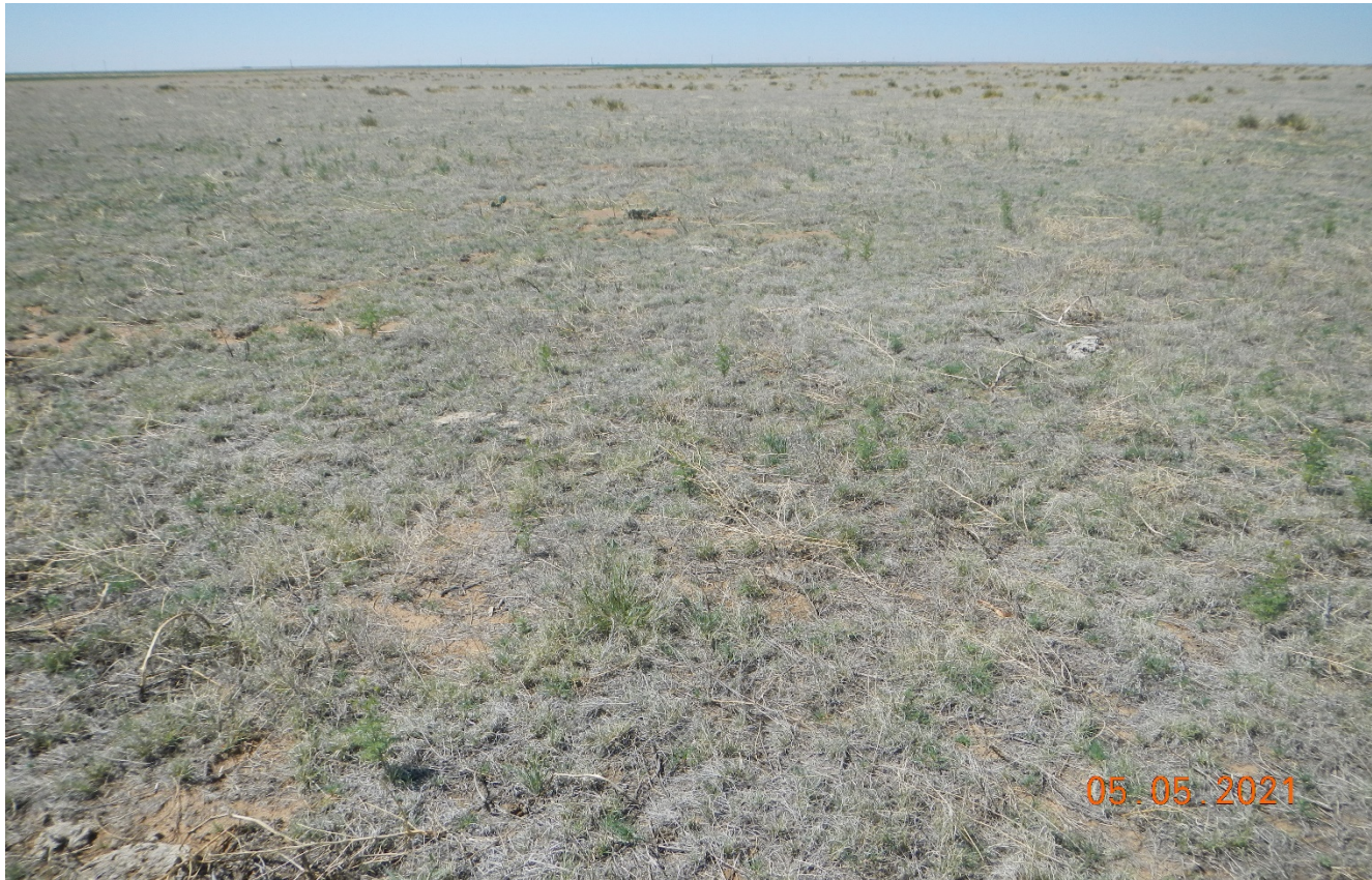
Photo 11. Facing west toward the surrounding undisturbed pasture which consists of desirable native vegetation.