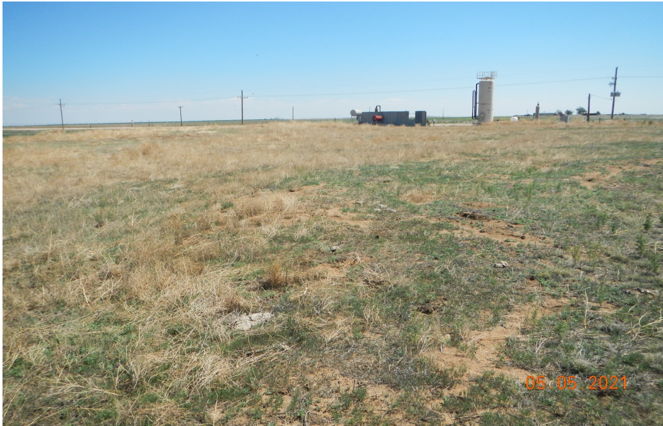
Photo 10. Facing northeast behind the compressor facility. There is undesirable weeds throughout this disturbed area which weeds will need to be controlled and the disturbance area reclaimed.