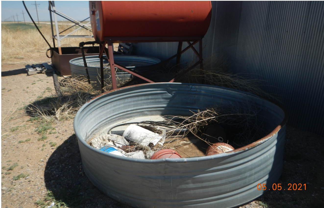
Photo 7. On the backside of the metal panels is unused equipment. There is various supplies and waste stored in the tanks. Unused equipment/supplies has not been removed. Previous corrective action was not performed.