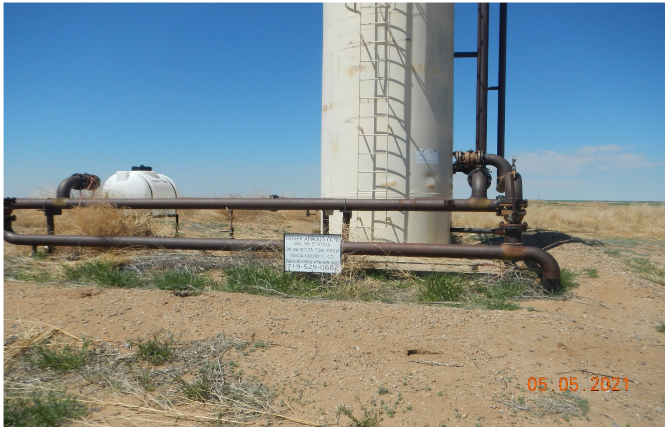
Photo 7. The facility sign is posted but contains incomplete and inaccurate information. Previous corrective action was not performed.