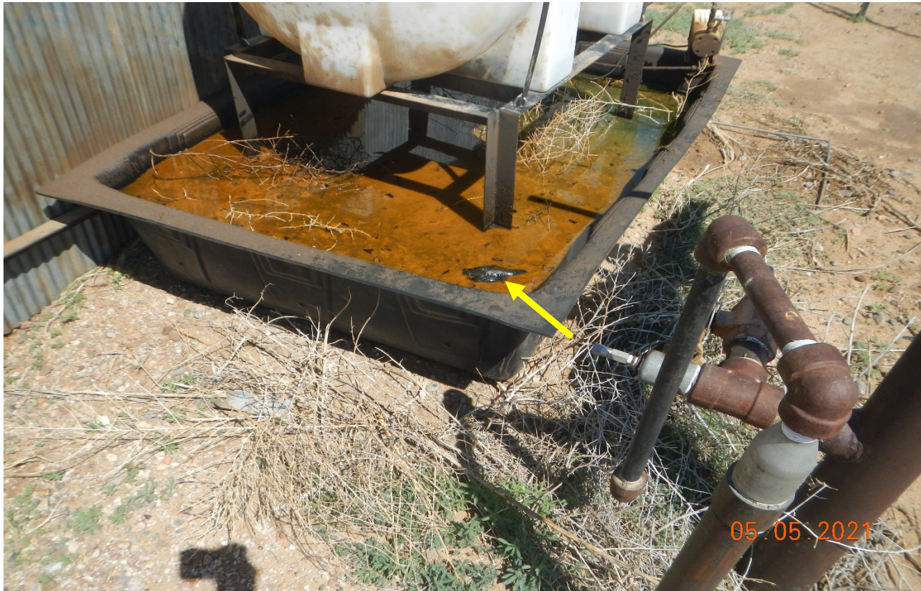
Photo 4. There is oily waste inside this containment which is near the top of the containment and appears to have spilled over. The oily waste has not been removed and properly disposed since last inspection. There is now a dead bird observed shown at red arrow.