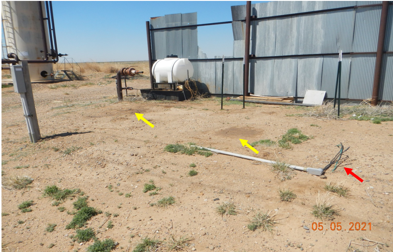
Photo 3. The black containers have been removed. There is an exposed electric utility that remain at red arrow. There is oil stained soil shown at yellow arrow.