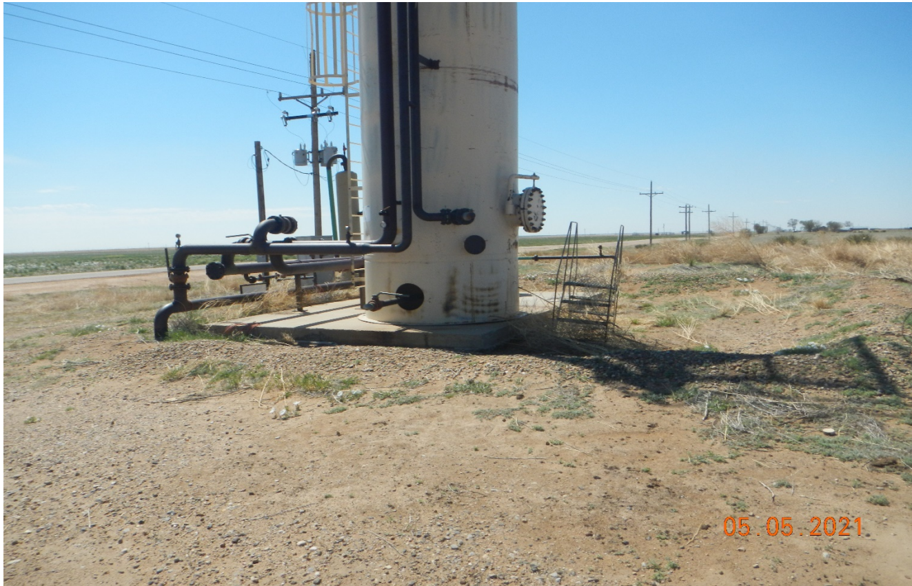
Photo 6. The berm around the tank vessel is inadequate in size and has animal burrows in it. The berm has not been repaired since previous inspection.