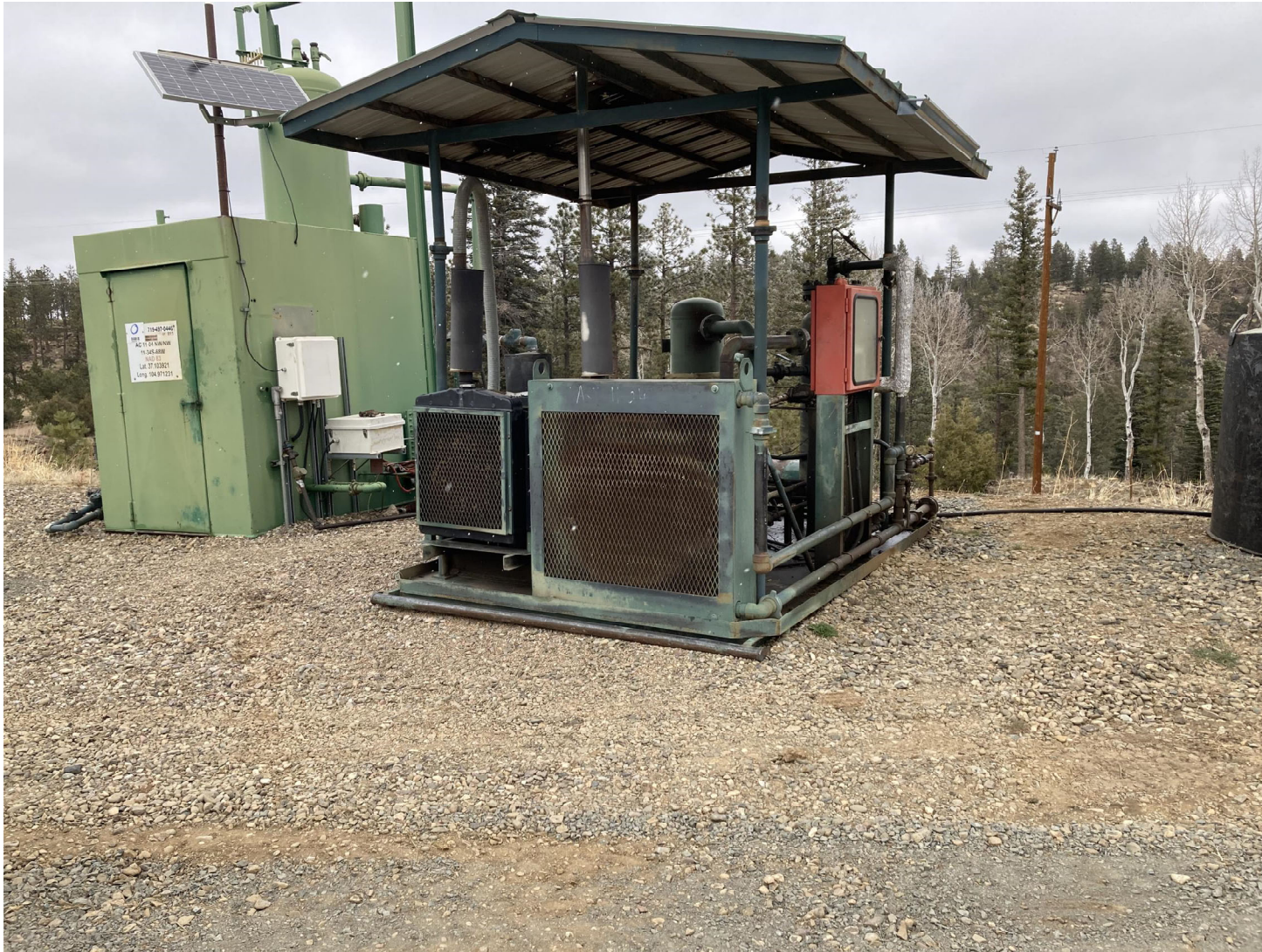
PHOTO 4: THE SCRUBBER LIQUID WAS REMOVED FROM THE PRODUCED WATER TANK AND DISPOSED OF PER OGRIS'S WASTE MANAGEMENT PLAN AND THE COGCC RULES AND REGULATIONS.

APACHE CANYON 11-04 API# 05-071-06127 – TIMBER CREEK OPERATING OGCC OPERATOR NUMBER 10672 - DATE: OCTOBER, 21 2020 CORRECTIVE ACTIONS COMPLETED REGARDING COGCC FIR DOCUMENT # 695103370