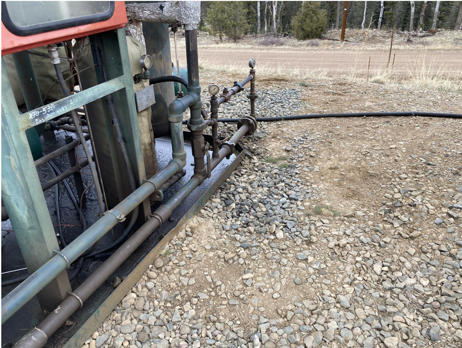
PHOTO 3: THE FLUID ACCUMULATION WAS REMOVED FROM THE CONTAINMENT OF THE LIQUID RING COMPRESSOR.

APACHE CANYON 11-04 API# 05-071-06127 – TIMBER CREEK OPERATING OGCC OPERATOR NUMBER 10672 - DATE: APRIL 14, 2021 CORRECTIVE ACTIONS COMPLETED REGARDING COGCC FIR DOCUMENT # 695103370