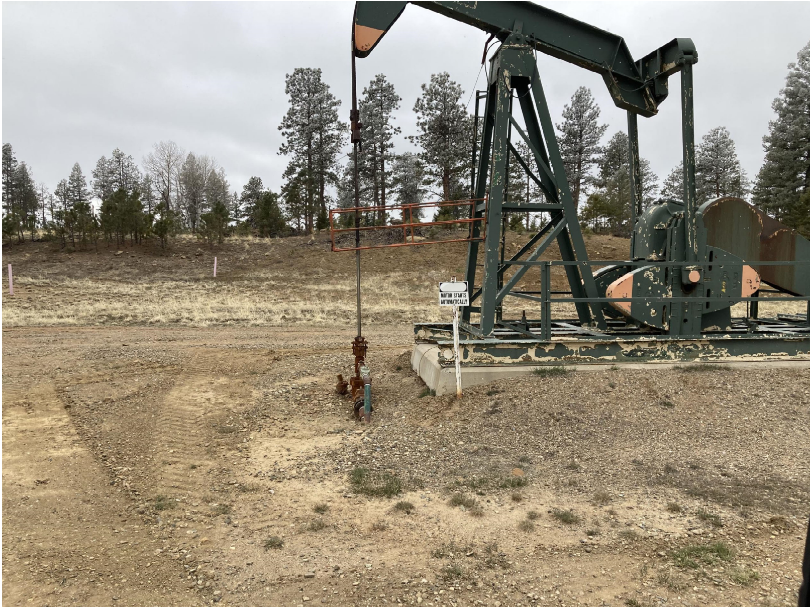
PHOTO 2: THE WELLHEAD PACKINGS WERE REPLACED AND THE STUFF BOX WAS SECURELY FASTENED TO STOP THE WATER LEAK. THE GROUND IS DRY AND NO IMPACTS WERE DISCOVERED.

APACHE CANYON 11-04 API# 05-071-06127 – TIMBER CREEK OPERATING OGCC OPERATOR NUMBER 10672 - DATE: OCTOBER, 06 2020 CORRECTIVE ACTIONS COMPLETED REGARDING COGCC FIR DOCUMENT # 695103370