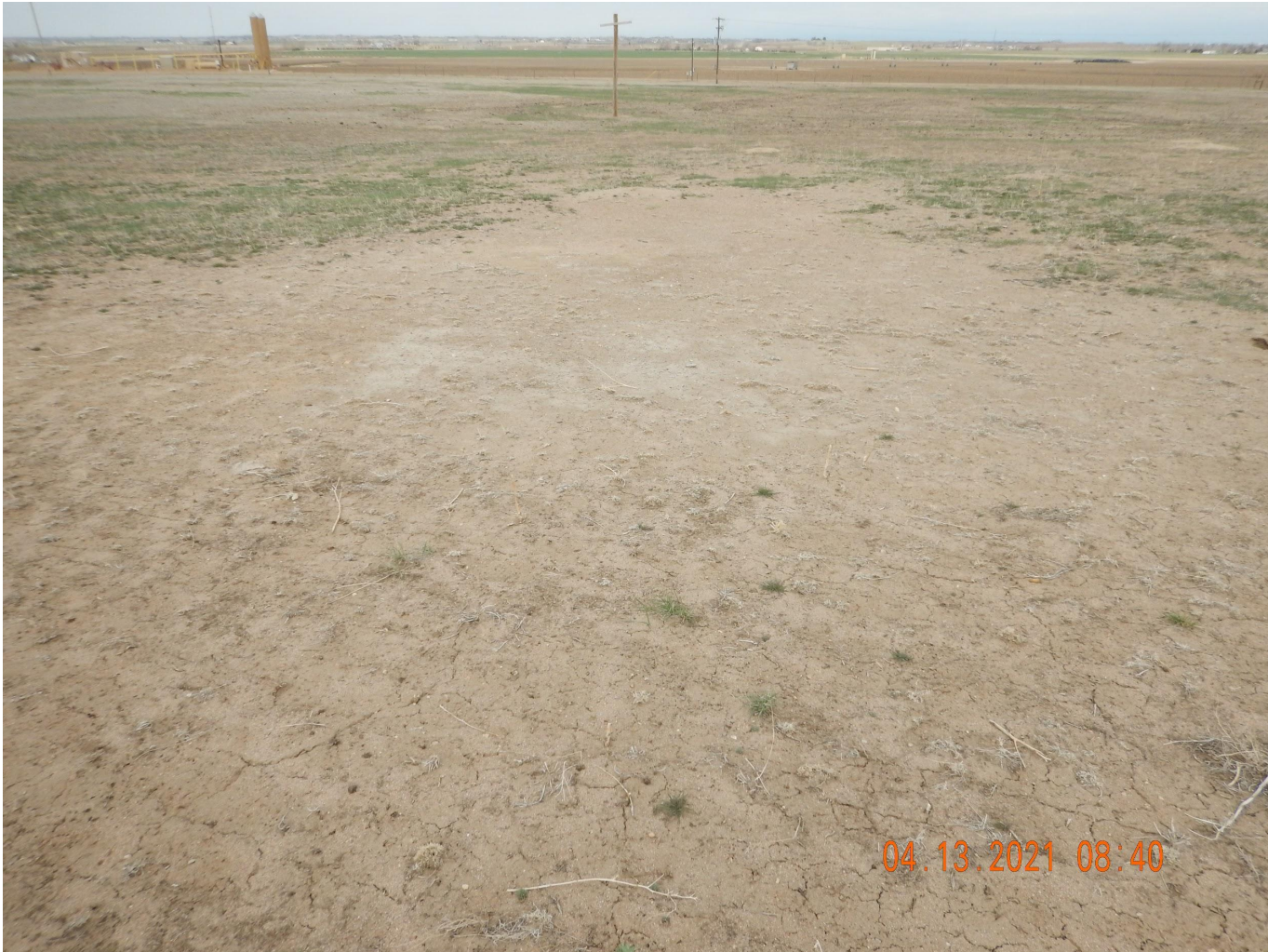
Photo 3. Photo taken from the well location, facing West. See comments under Photo 2.