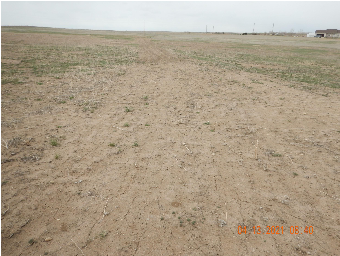
Photo 2. Photo taken from the well location, facing South. Photo illustrates little to no establishment of desirable plant species.