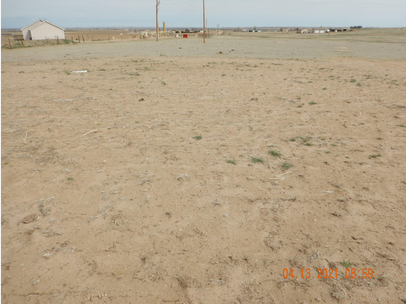
Photo 5. Photo taken from the associated offsite tank battery location, facing North. See comments under Photo 2.