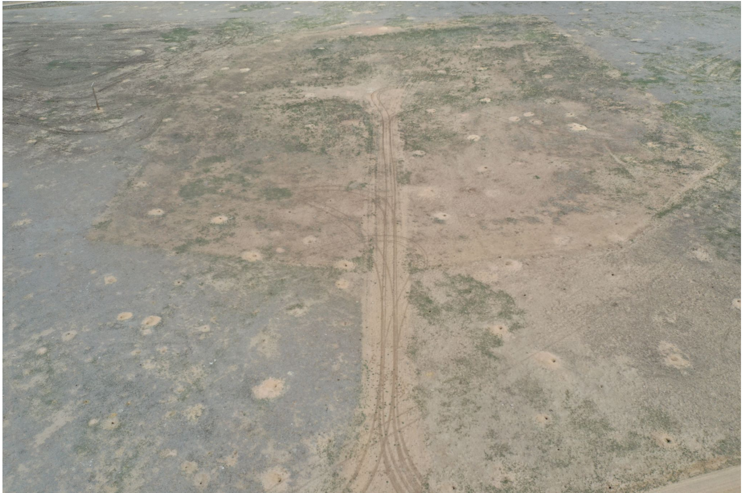
Photo 1. Drone aerial imagery from 4/13/2021, facing North. Photo illustrates the Wyscaver #5-14 well location and access road.