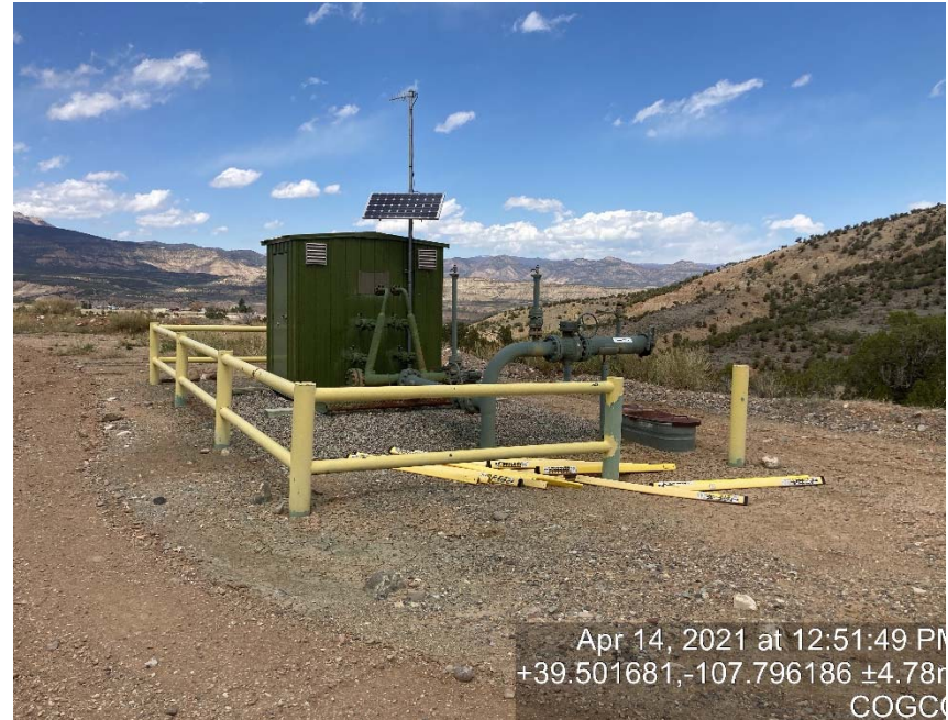
location and debris