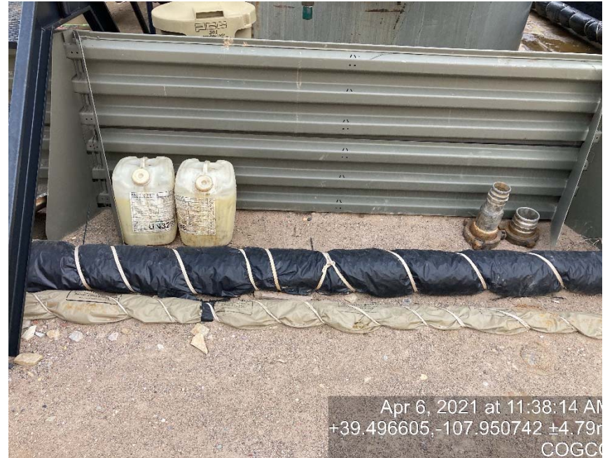
Debris and jugs of chemical not in a containment. Pumper had moved jugs in side containment during inspection