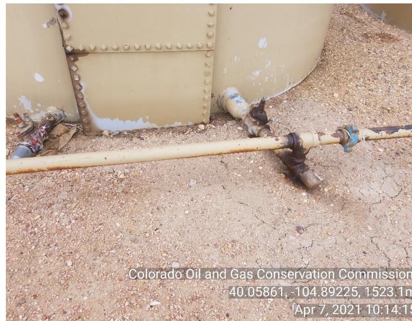
Photo 6 mechanical issue fittings and valves leaking on load out lines on crude oil tanks