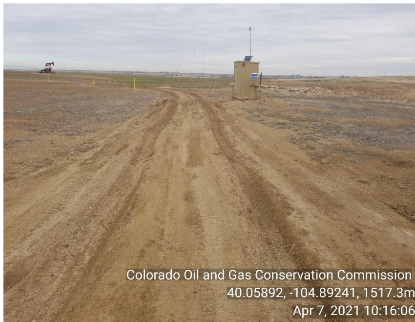
Photo 9 Deep ruts on access road, road in need of proper BMP's