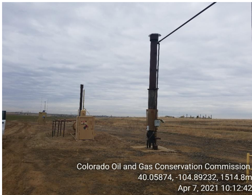
Photo 3 production equipment