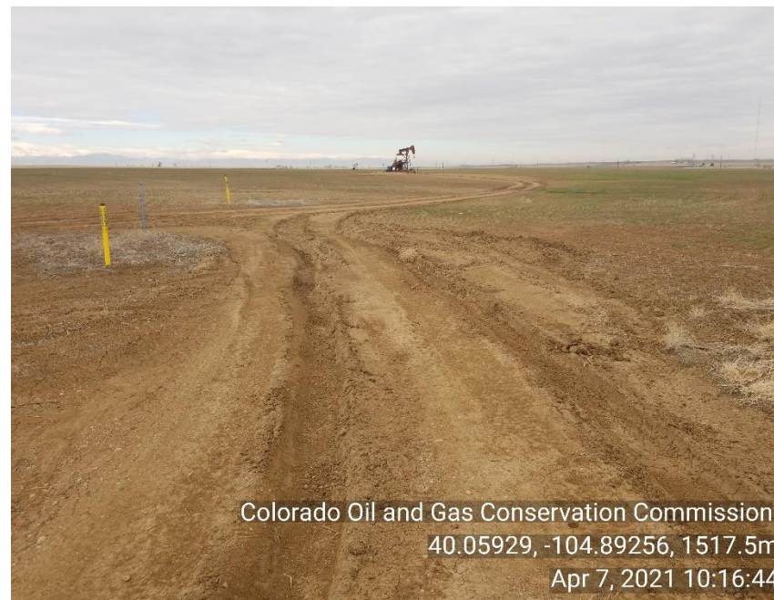
Photo 10 Deep ruts on access road, road in need of proper BMP's