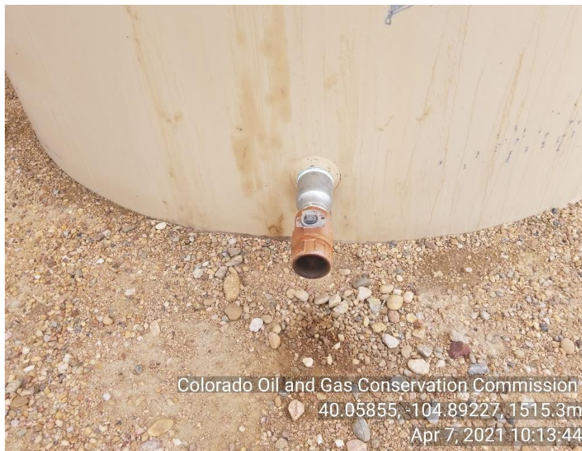
Photo 5 mechanical issue no bull plug and stained soil under unsecured valve on produced water tank