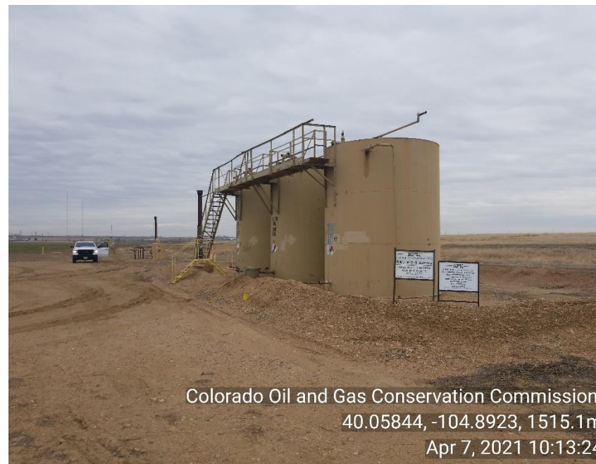
Photo 4 TNK BTRY