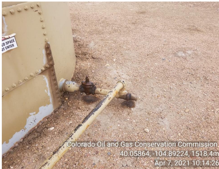
Photo 7 Mechanical issue and stained soil on load out lines on crude oil tanks.