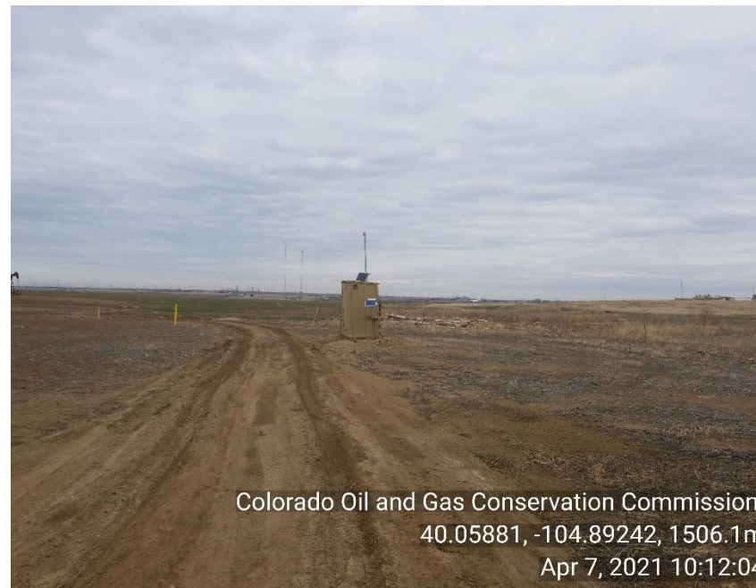
Photo 2 Meter house