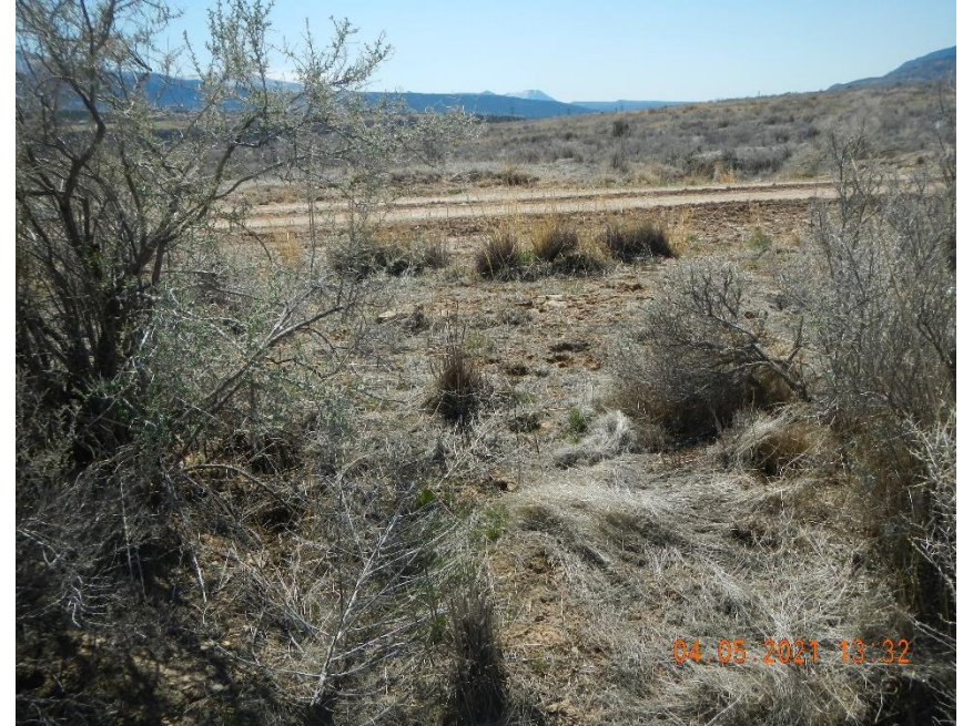
39.47991 108.02467 Drainage ditch