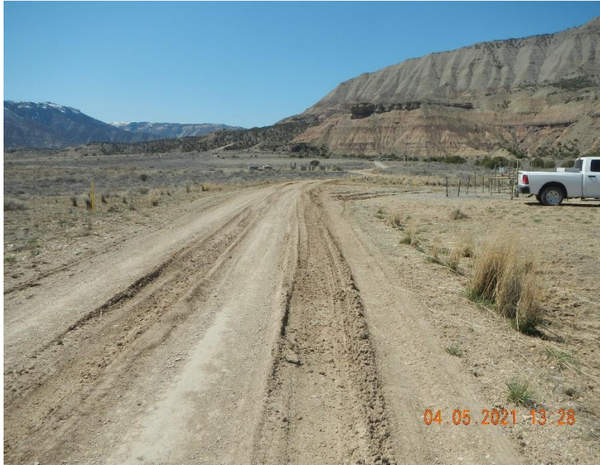
Rutted access road.