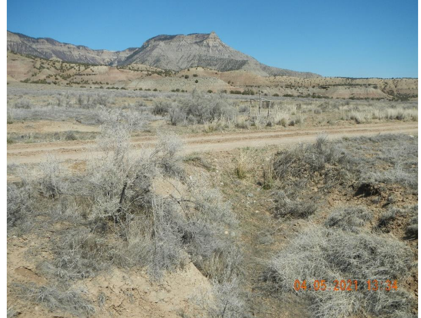
39.47991 108.02467 Drainage ditch