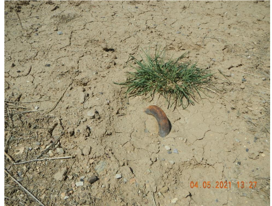
Unmarked deadman south east corner of location.