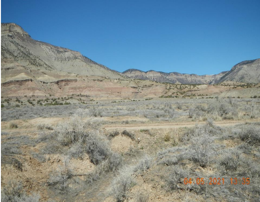
39.47991 108.02467 Drainage ditch