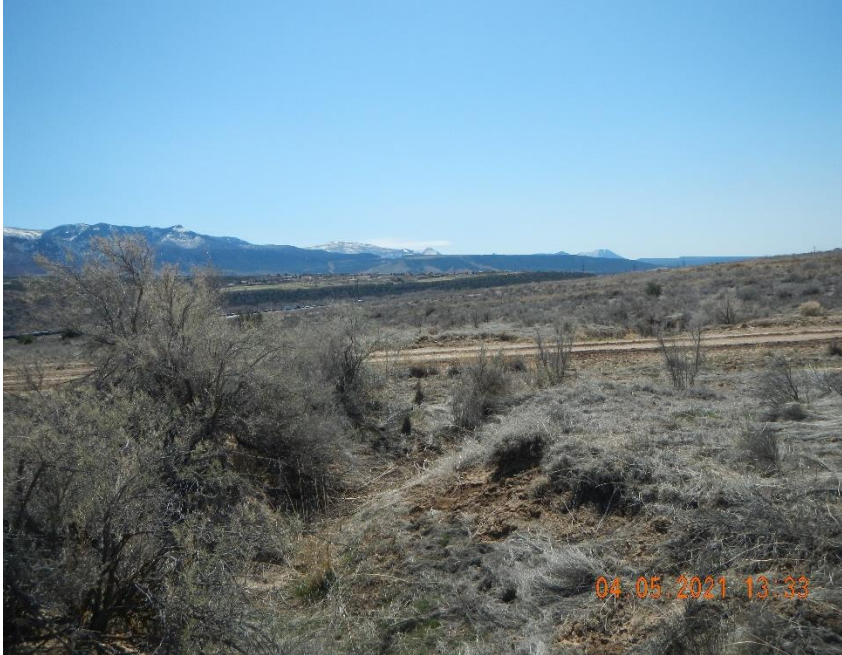
39.47991 108.02467 Drainage ditch