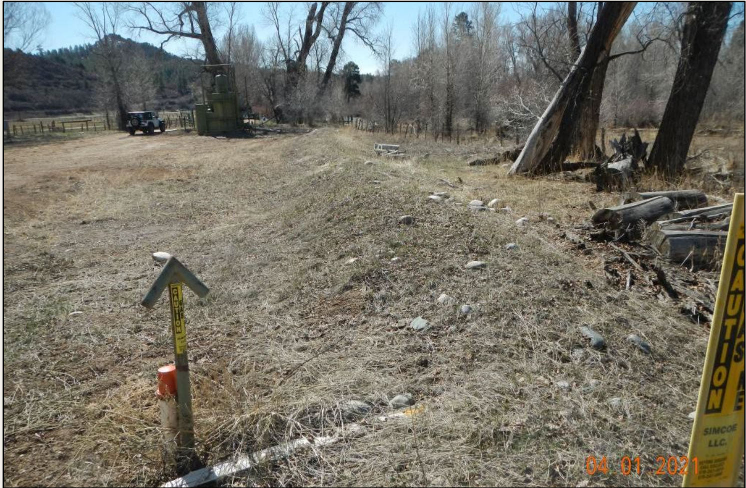
Photo 3. View of the western project area from the northwestern corner facing southward.