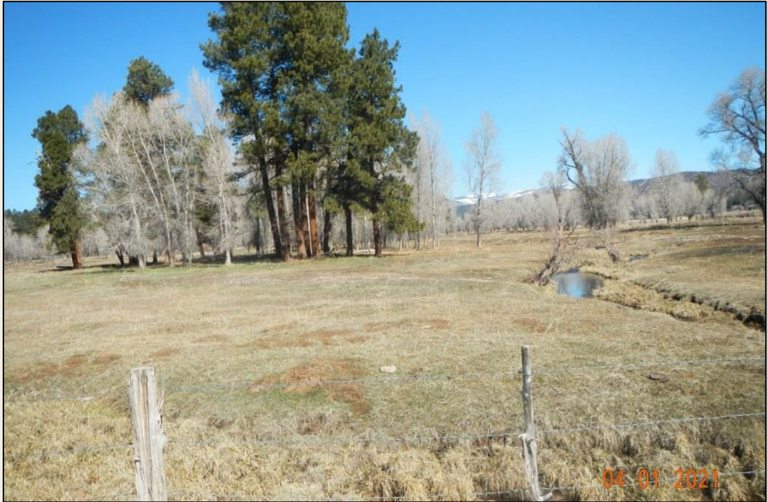
Photo 5. View of the reference area comprised of irrigated grass field, cottonwood trees, and ponderosa pines.