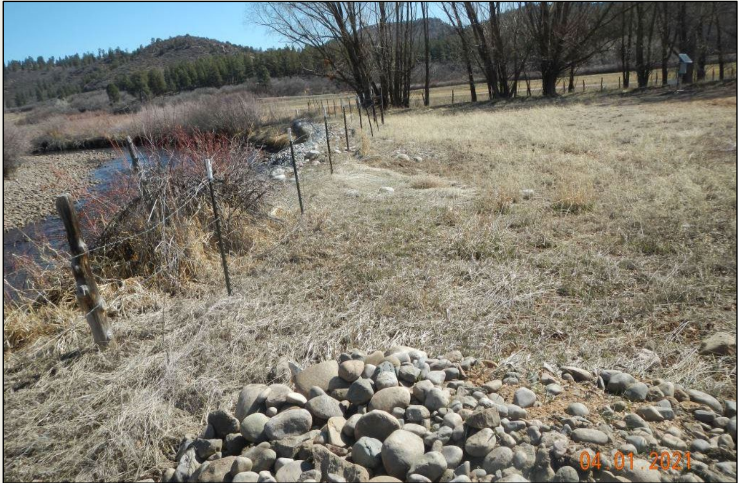
Photo 2. View of the northern project area from the northwestern corner facing eastward. Revegetation is progressing, largely with smooth brome and sand dropseed.