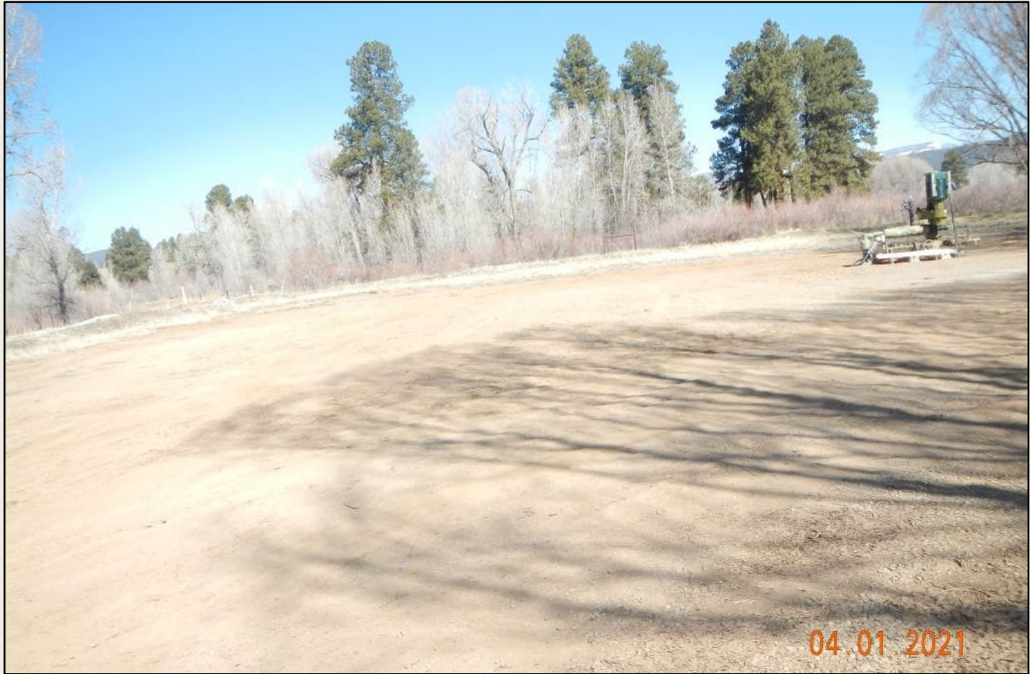
Photo 1. View of the project area from the well pad entrance facing center.