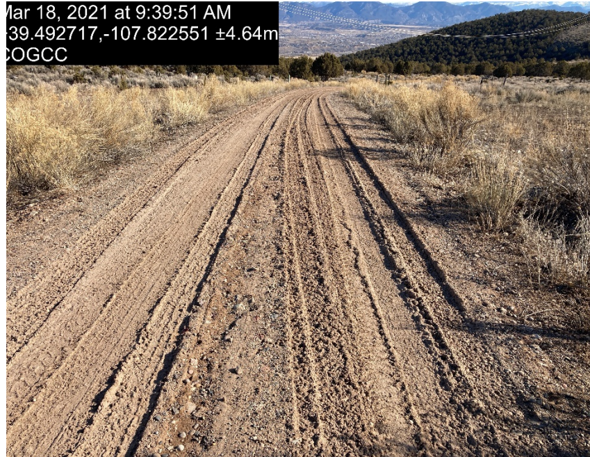
Location entrance access road lack of stabilization/compaction