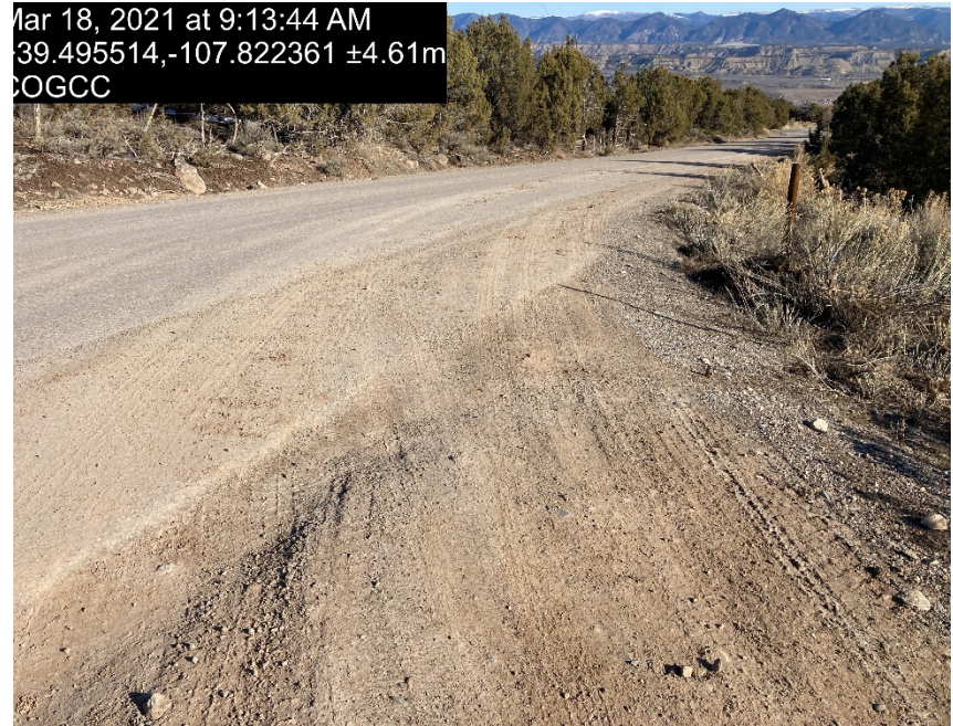
Tracking on to CR 317