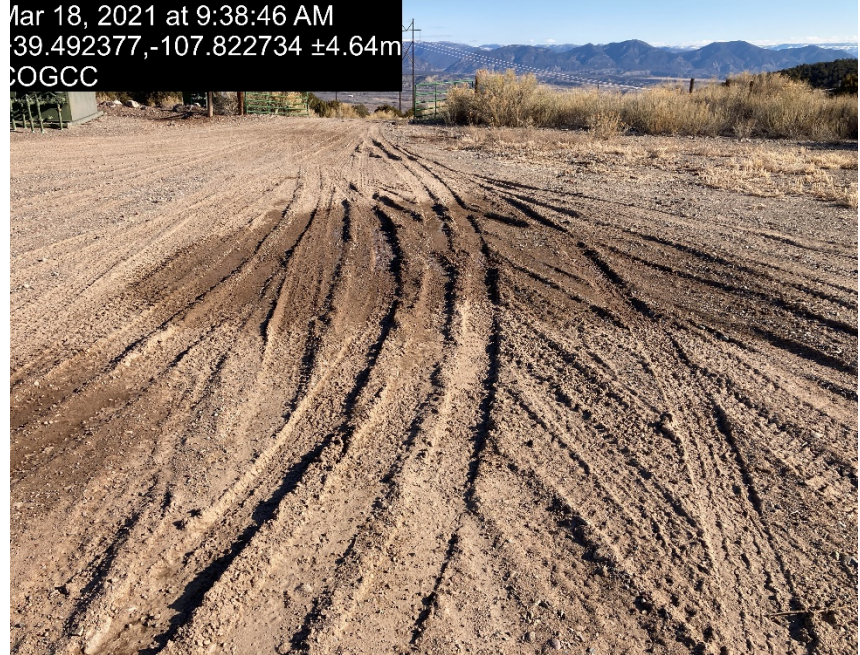
lack of stabilization/compaction

Mar 18, 2021 at 9:38:46 AM 39.492377,-107.822734 ±4.64m COGCC