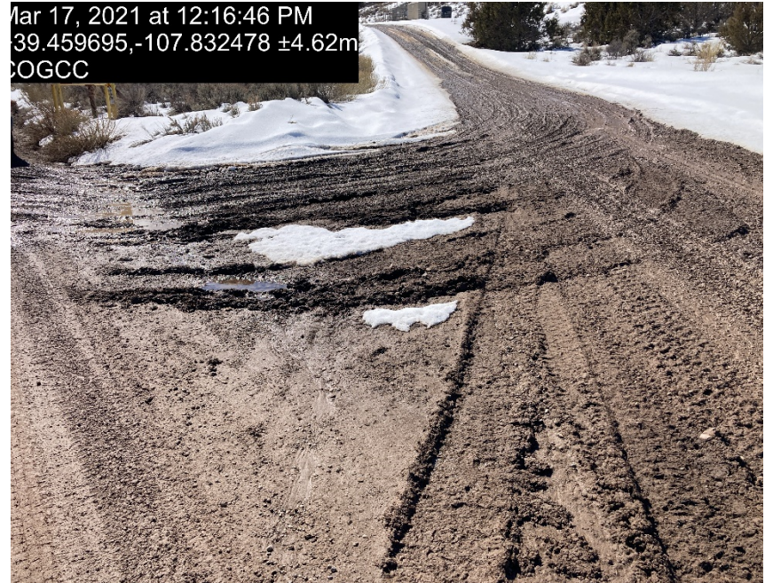
location/entrance off of main road