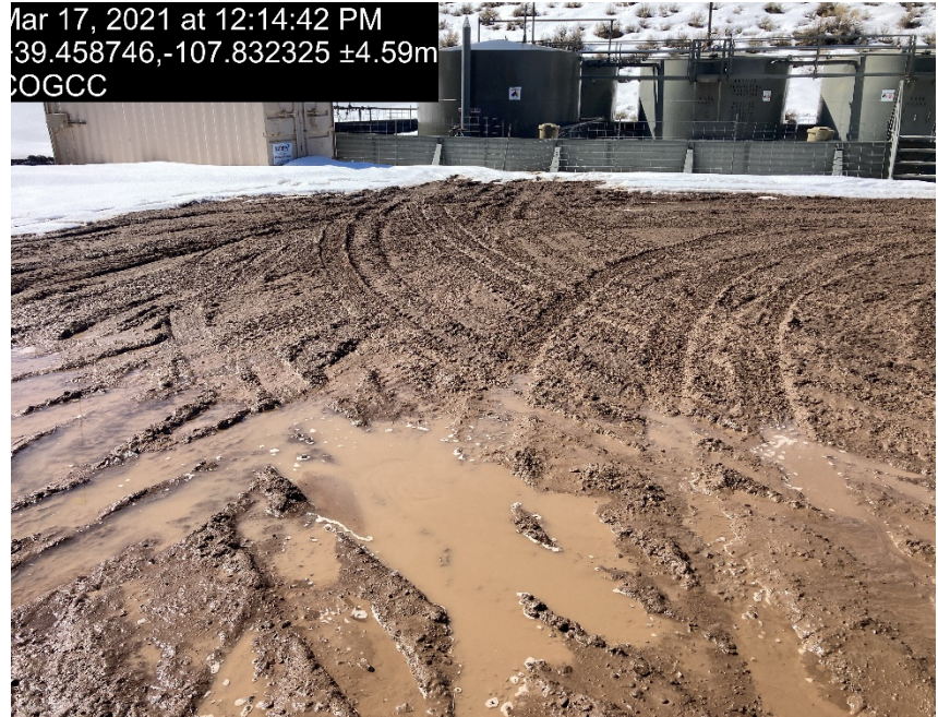
Lack of stabilization

Mar 17, 2021 at 12:14:42 PM 39.458746,-107.832325 ±4.59m COGCC