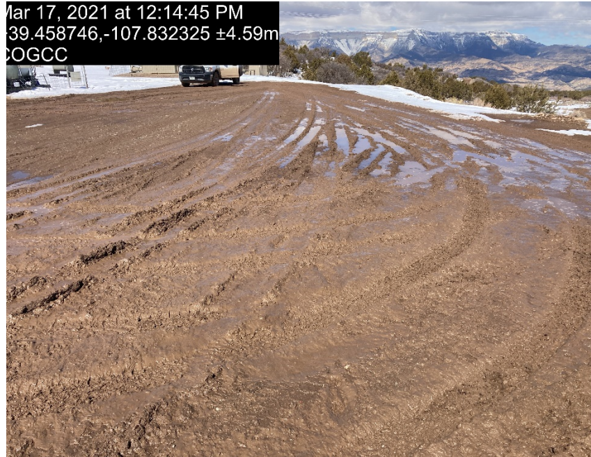
Lack of stabilization