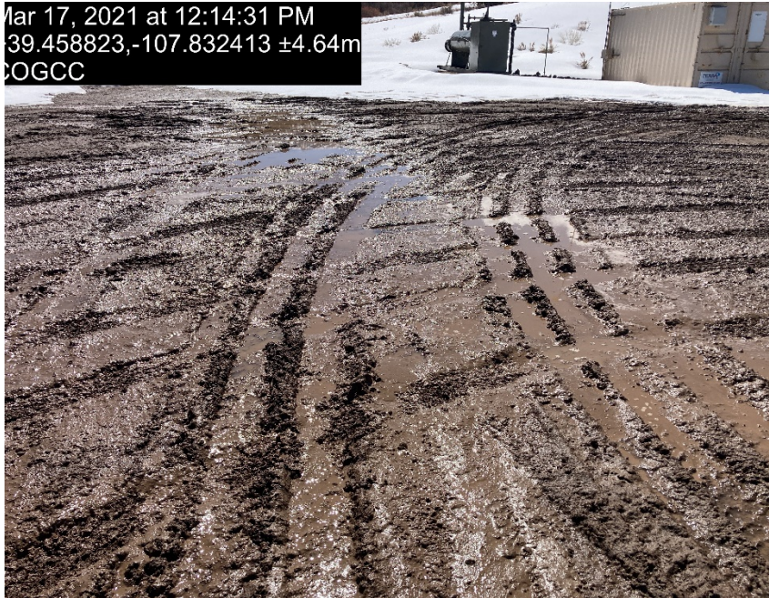
Lack of stabilization

Mar 17, 2021 at 12:14:31 PM 39.458823,-107.832413 ±4.64m COGCC