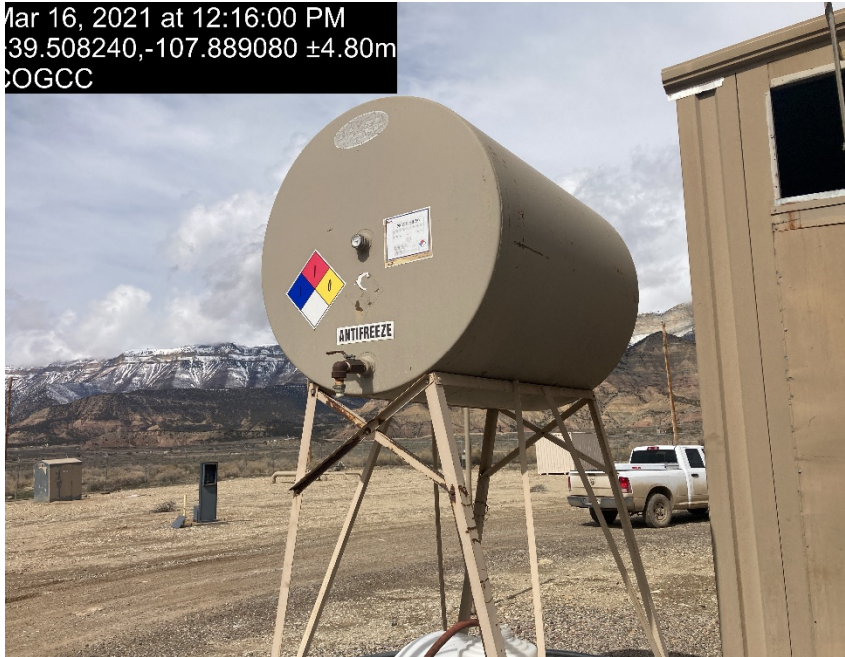
Lacking information on tank

Mar 16, 2021 at 12:16:00 PM 39.508240,-107.889080 ±4.80m COGCC