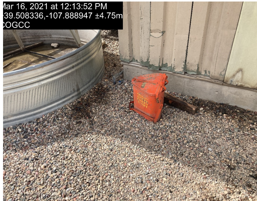
Staining and can not in secondary containment

Mar 16, 2021 at 12:13:52 PM 39.508336,-107.888947 ±4.75m COGCC