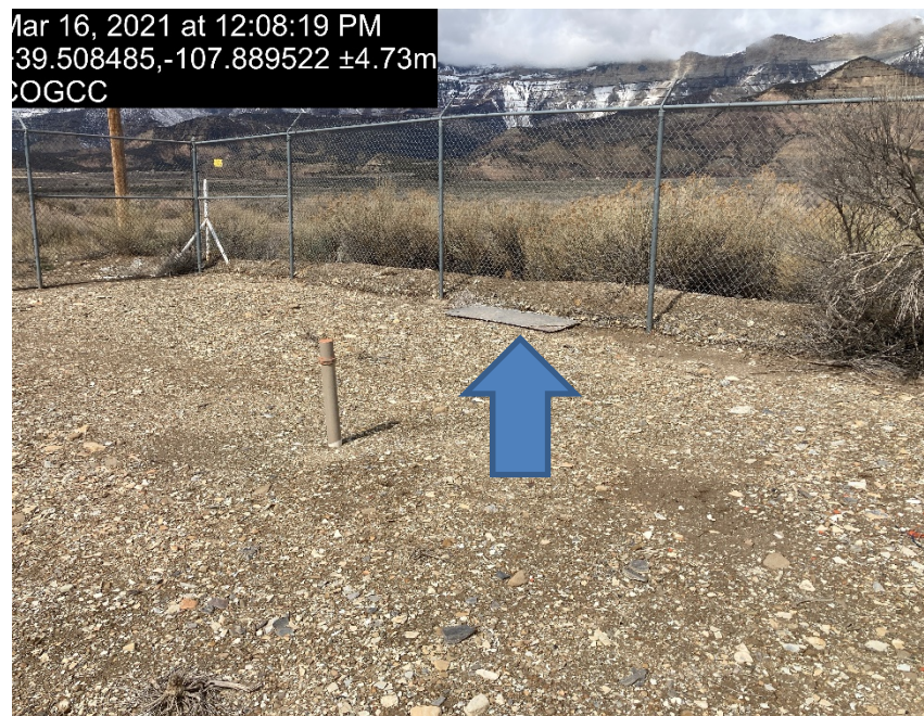
Debris (door to meter house)