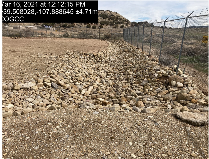
Storm water BMP's

Mar 16, 2021 at 12:12:15 PM 39.508028,-107.888645 ±4.71m COGCC