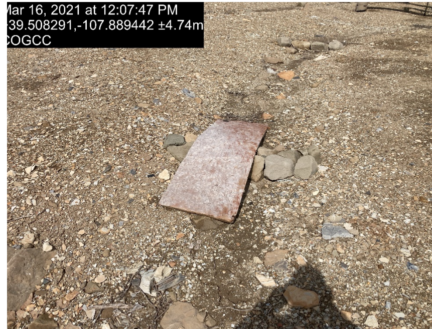
Debris (door to meter house)