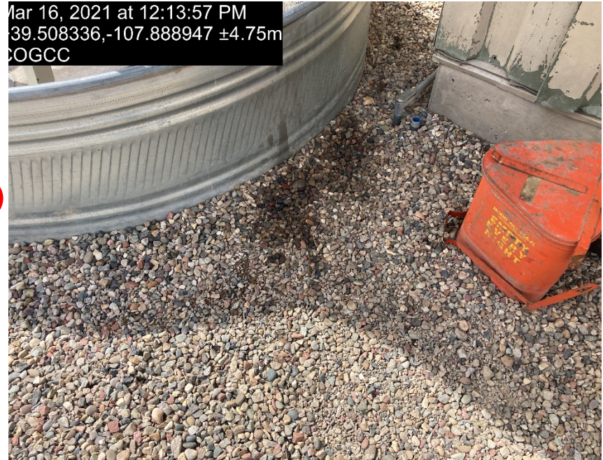
Staining and can not in secondary containment

Mar 16, 2021 at 12:13:57 PM 39.508336,-107.888947 ±4.75m COGCC