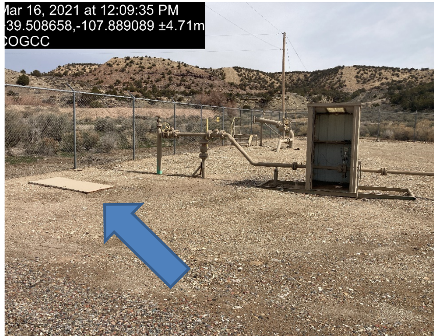
Debris (door to meter house)