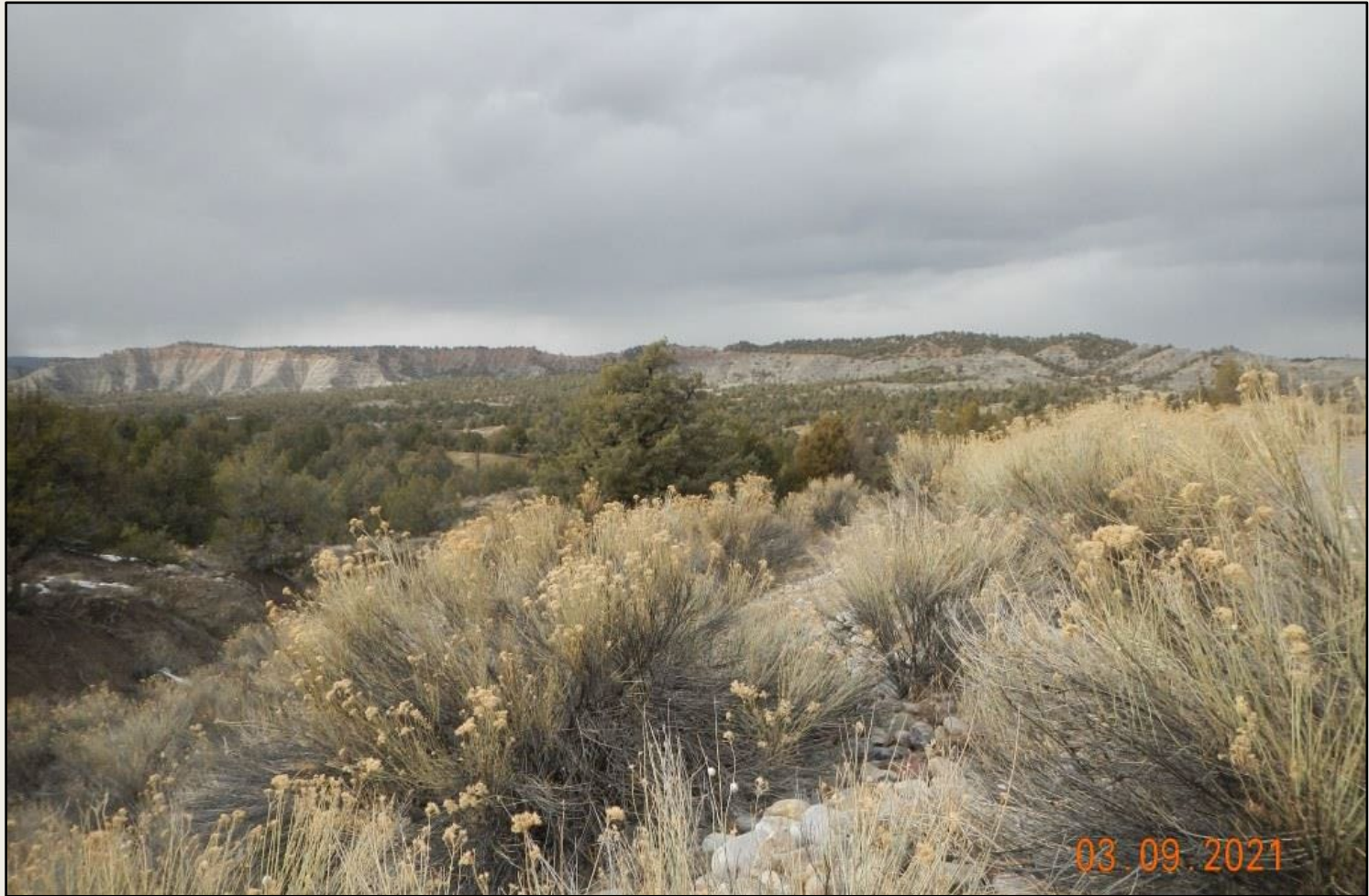
Photo 2. View of the western fill slope facing northwestward. Revegetation is progressing with sand dropseed, western wheatgrass, and rubber rabbitbrush.