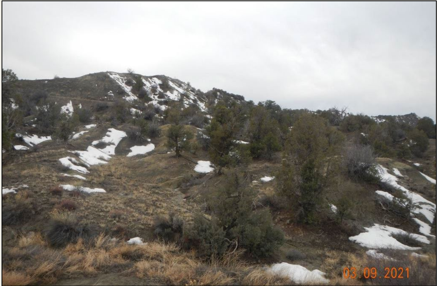
Photo 4. View of the reference area comprised of pinyon and juniper woodland, with understory of grasses and forbs such as Palmer's penstemon and Indian ricegrass.