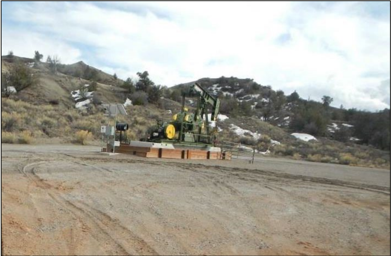
Photo 1. View of the project area from the well pad entrance facing center.