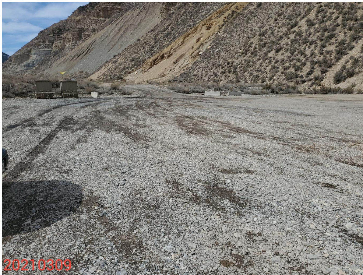
Photo 3: Photo taken from the south end of the Location, facing west. Photos 3-6 provide an overview of the Location from west, northwest, northeast to east. Photos also show areas on the northwest corner of the Location not necessary for production that requires reclamation.