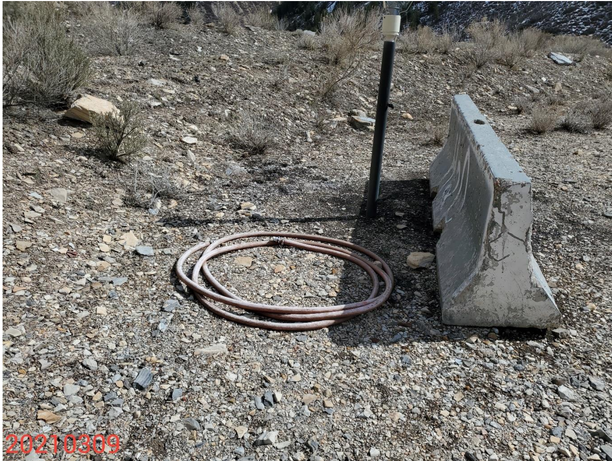
Photo 10: Photo shows unused hose equipment stored on the northeast corner of the Location.