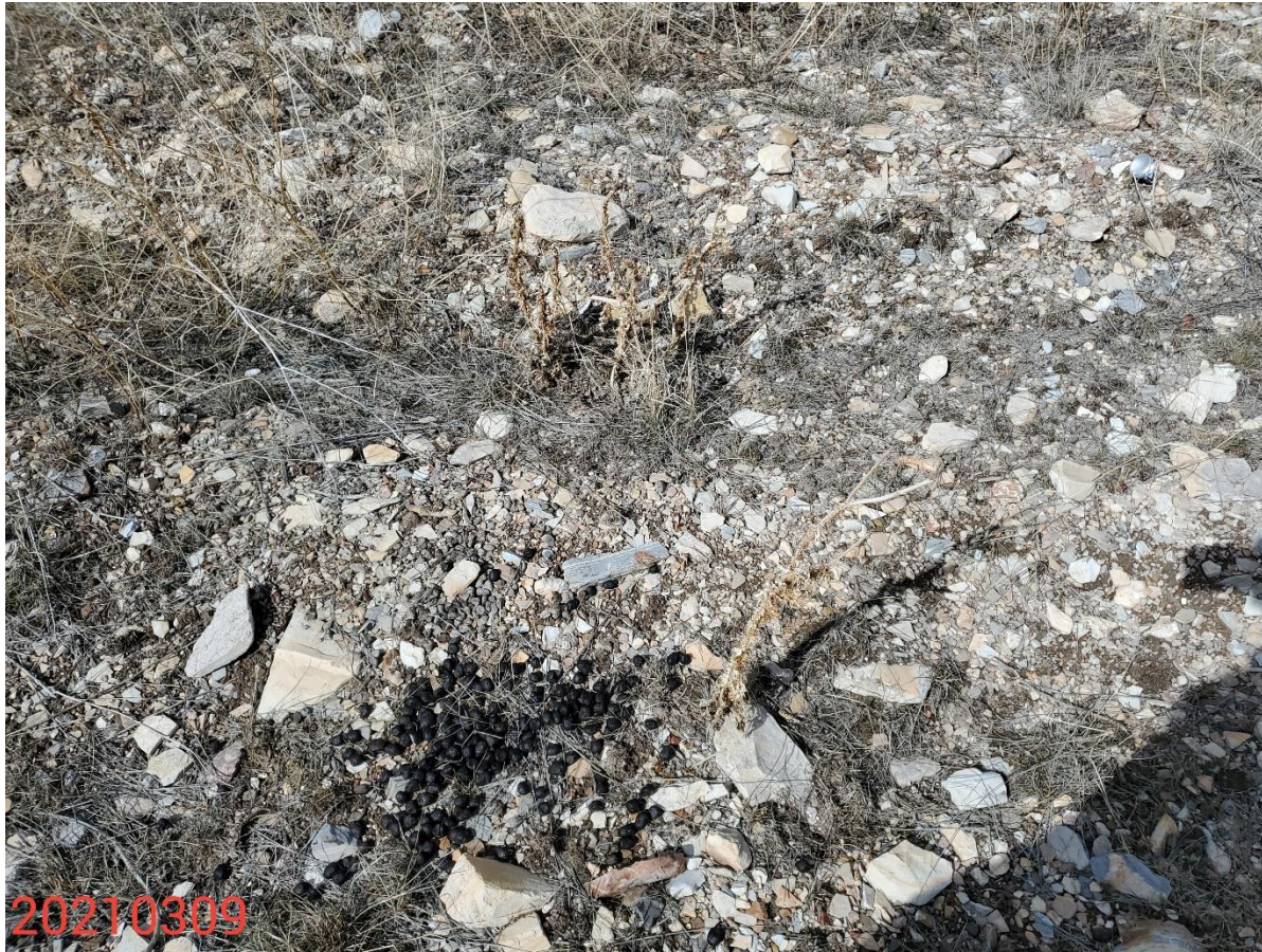
Photo 14: Photo taken from the southeastern interim areas. Photo shows Musk thistle remnants from the 2020 growing season. Unclear if sufficient noxious weed management efforts were performed prior to the onset of winter conditions. A follow up inspection will be conducted to determine compliance with Rule 1003.f