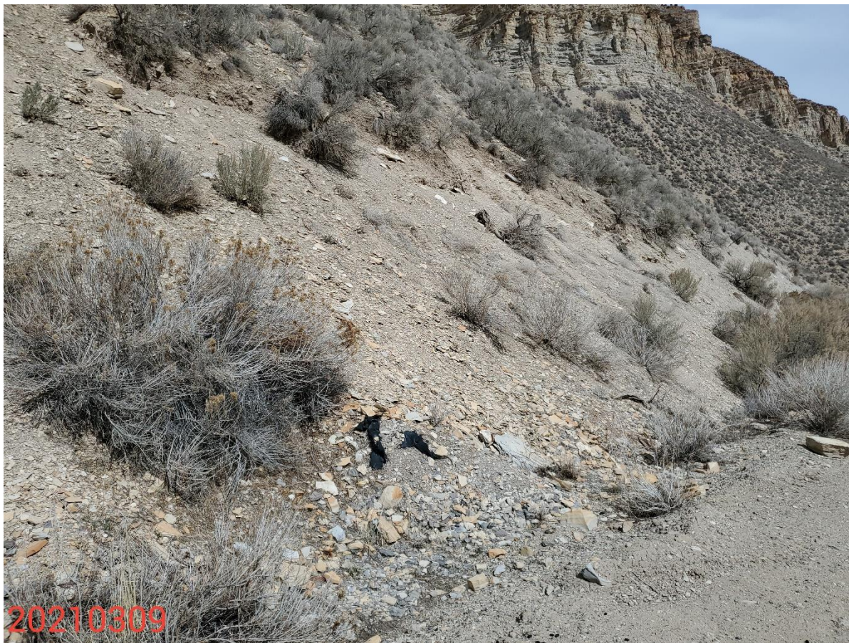
Photo 7: Photo taken from the slopes on the north end of the Location, facing northeast. Photo shows that control measures to stabilize and protect the slopes are missing or insufficient. Uniform vegetative establishment is not progressing towards 1003 standards.