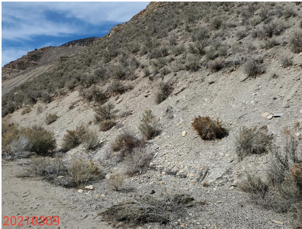
Photo 9: Photo taken from the slopes on the north end of the Location, facing northwest. Photo shows that control measures to stabilize and protect the slopes are missing or insufficient. Uniform vegetative establishment is not progressing towards 1003 standards.