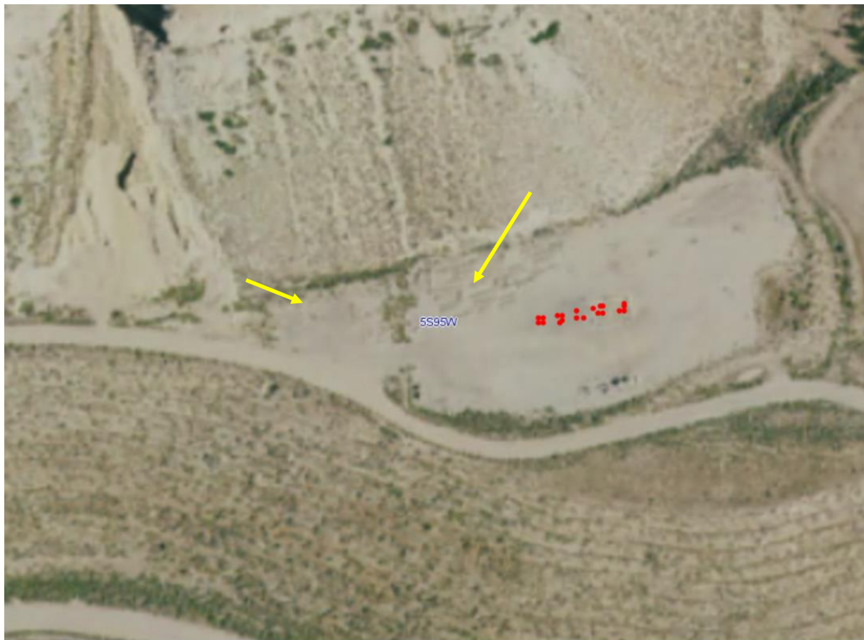
Photo 2: 2019 COGIS areal image. Photo shows constructed areas to the west, and northwest of the Location not needed for production, and require reclamation in accordance with COGCC 1003 rules. Remediation project #7966 currently in process on the northern and northeastern areas of the Location.