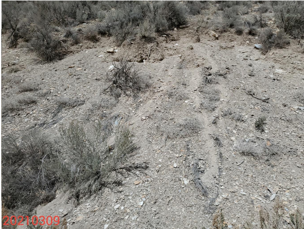
Photo 8: Photo taken from the slopes on the north end of the Location, facing north. Photo shows that control measures to stabilize and protect the slopes are missing or insufficient. Uniform vegetative establishment is not progressing towards 1003 standards.