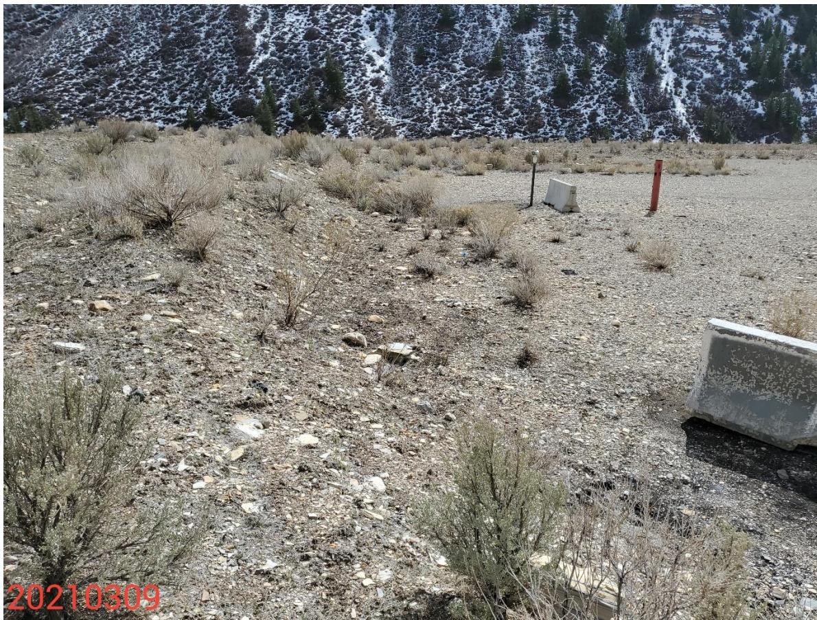
Photo 11: Photo taken from the northeast corner of the pad, facing south. Photos 11-13 provide an overview of the Location from south, southwest to west. Remediation project #7966 currently in process on the northern and northeastern areas of the Location.