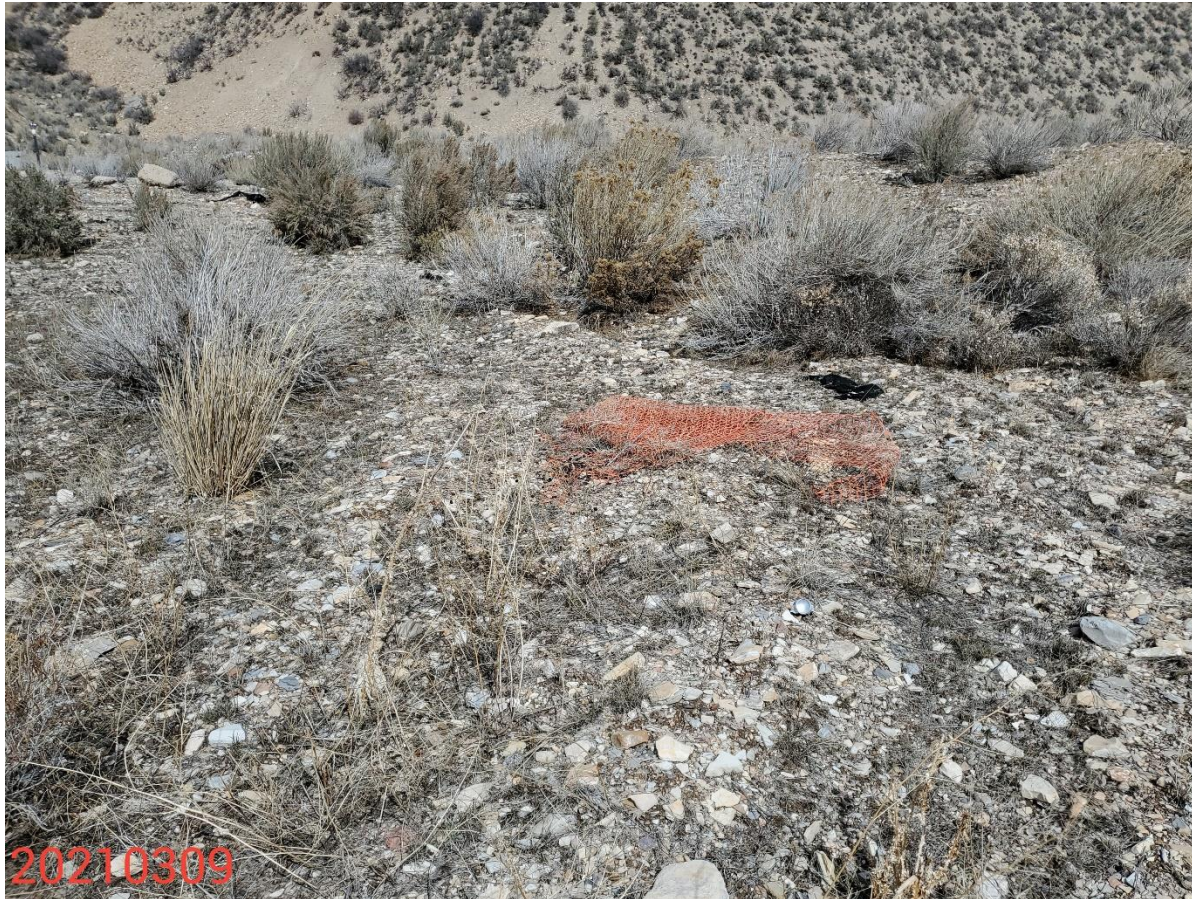
Photo 15: Photo taken from the southeastern interim areas, facing north. Photo shows trash debris (orange safety fence).