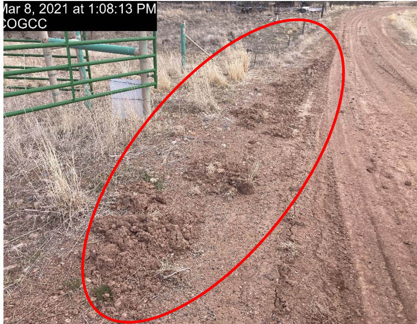
Sediment leaving location