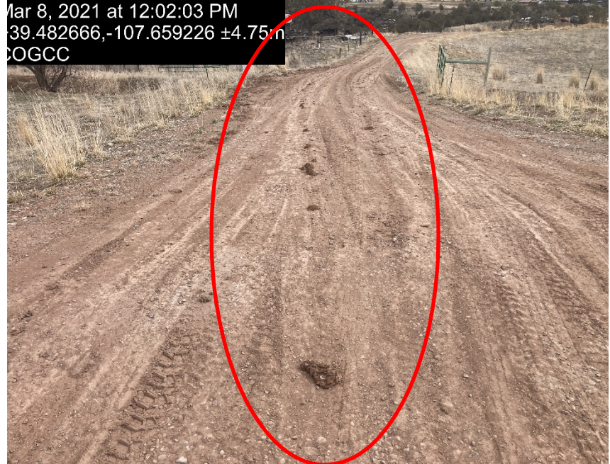
Sediment leaving location

Mar 8, 2021 at 12:02:03 PM 39.482666,-107.659226 ±4.75m COGCC