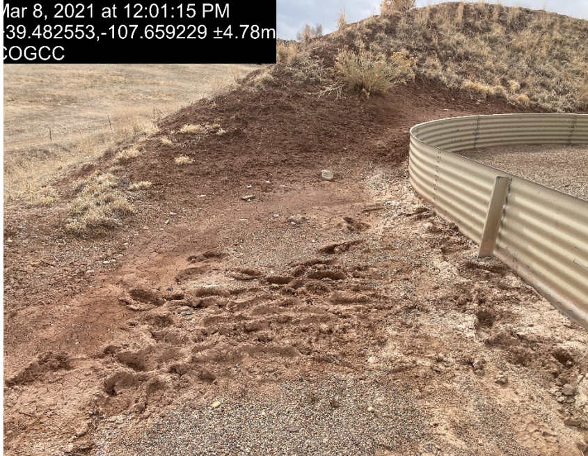
Cut slope not stabilized

Mar 8, 2021 at 12:01:15 PM 39.482553,-107.659229 ±4.78m COGCC