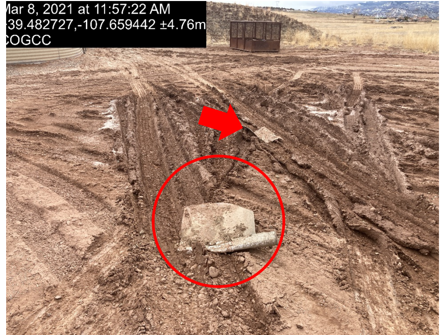
Location shows signs of lack of stabilization/compaction and debris(truck mud flaps and mud flap assembly)

Mar 8, 2021 at 11:57:22 AM 39.482727,-107.659442 ±4.76m COGCC