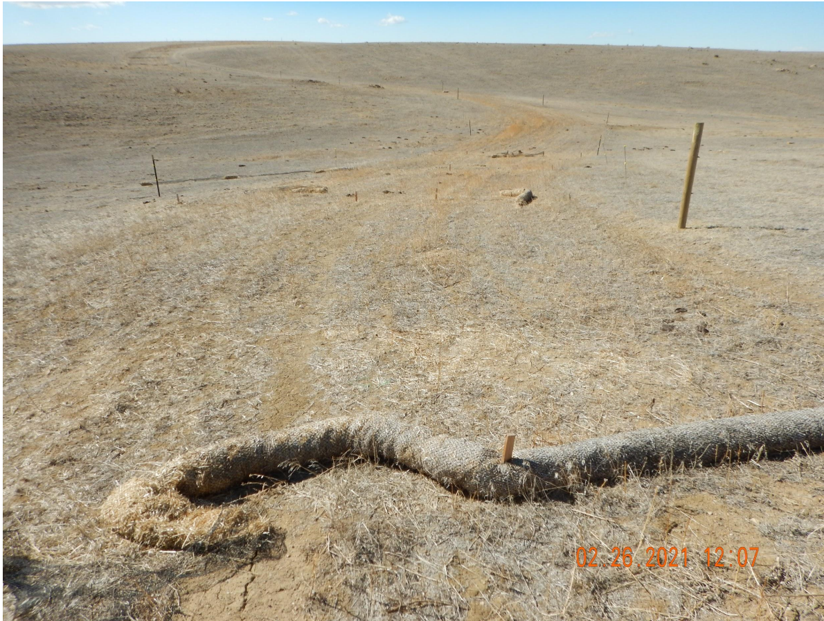
Photo 3. Photo taken from the eastern well location access road, facing West. See comments under Photo 1.