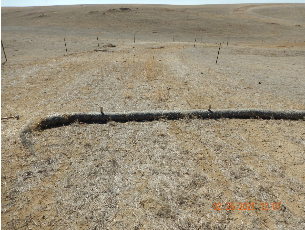
Photo 1. Photo taken from the eastern well location access road, facing West. Photo illustrates the Operator has performed final reclamation activities; however, there was little to no germination of desirable perennial species. Also, stormwater BMPs are in need of maintenance, as well as fencing.