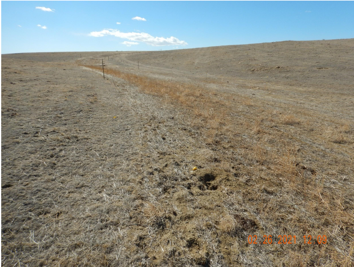
Photo 5. Photo taken from the eastern well location access road, facing West. See comments under Photo 1.