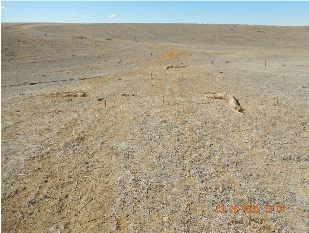
Photo 4. Photo taken from the eastern well location access road, facing West. See comments under Photo 1.