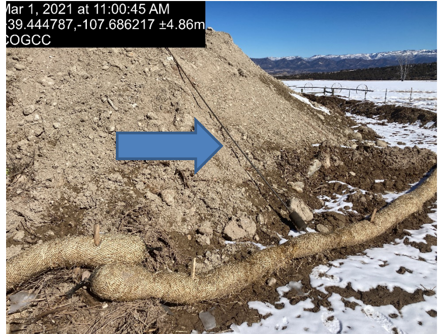
Random debris (ESD tank float)