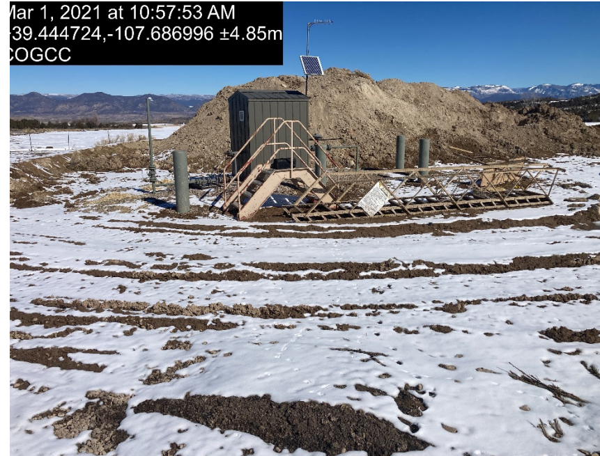
Follow up inspection photo of equipment still stored on pad surface