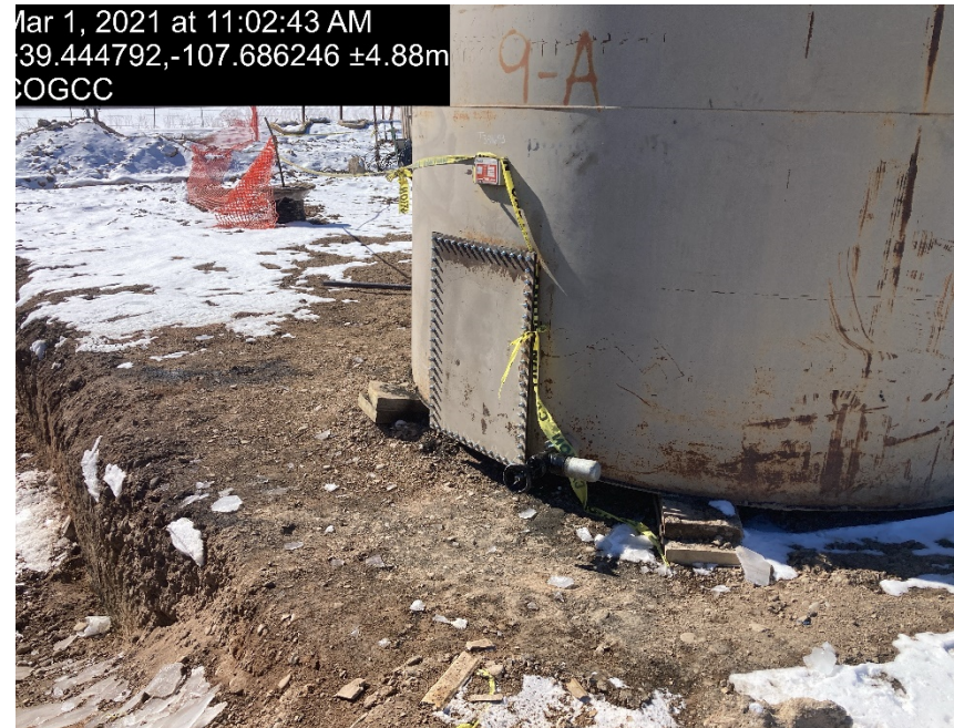
Follow up inspection of manway is sealed but still no secondary containment