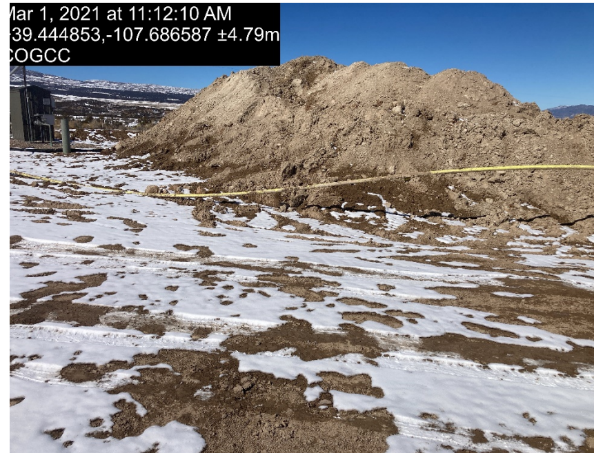
Follow up inspection photo of soil storage on location