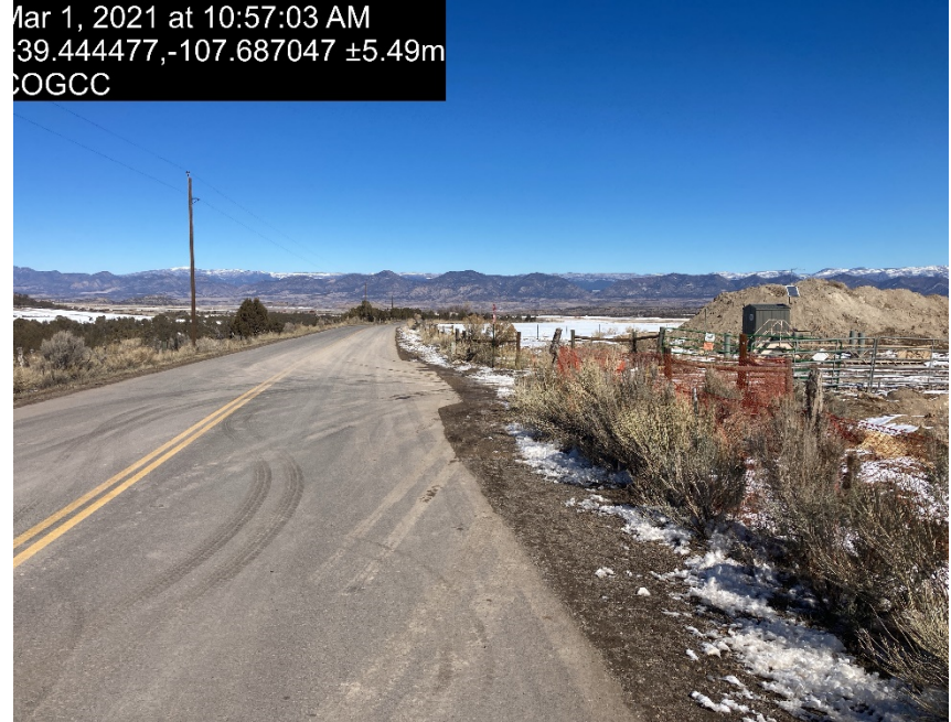
Looking north on CR 315 by entrance

Mar 1, 2021 at 10:57:03 AM 39.444477,-107.687047 ±5.49m COGCC