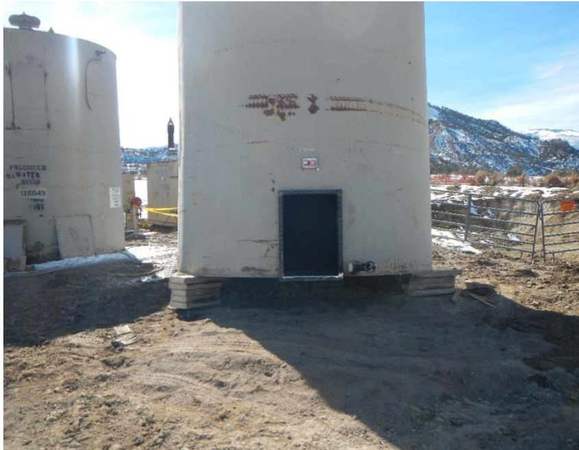
Previous inspection of manway open