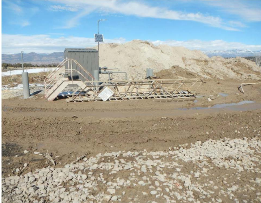
Previous inspection photo of equipment stored on pad surface