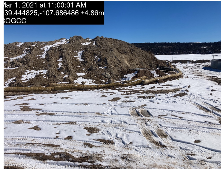
Follow up inspection photo of material storage on pad surface