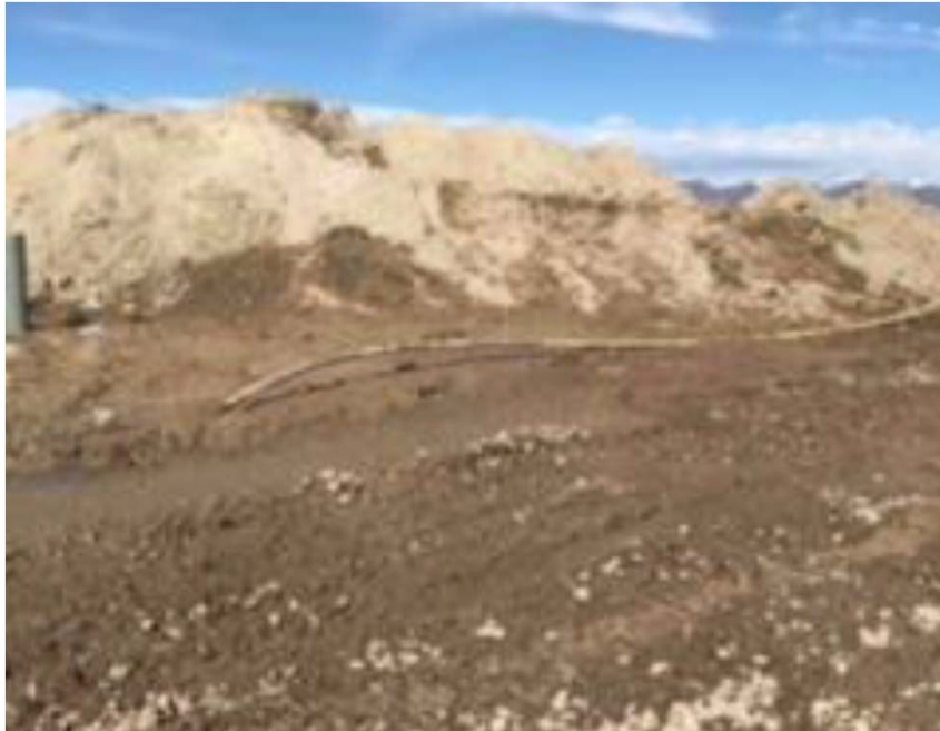
Previous inspection photo of soil storage on location