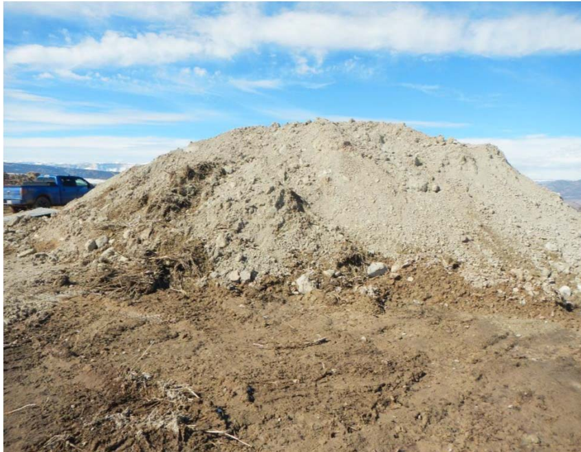
Previous inspection photo of material storage on pad surface