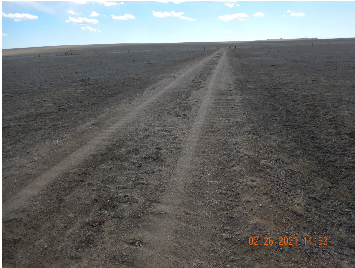
Photo 3. Photo taken from the well location, facing South. Photo illustrates Operator has failed to reclaim the access road.