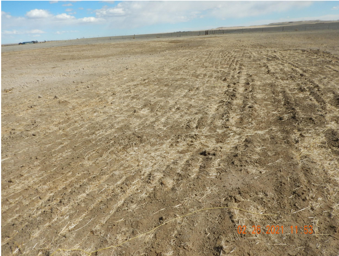
Photo 1. Photo taken from the well location, facing East. Photo illustrates the Operator has performed final reclamation activities.