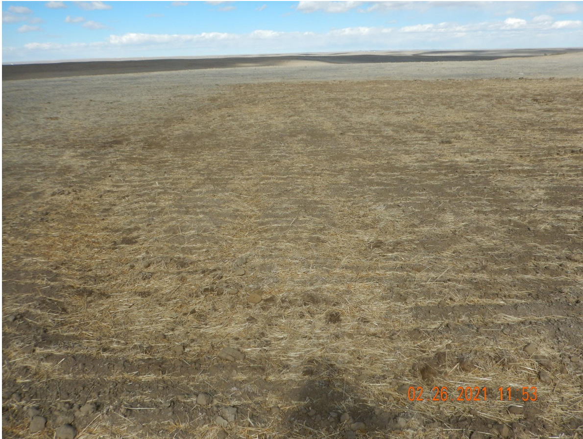
Photo 2. Photo taken from the well location, facing North. See comments under Photo 1.