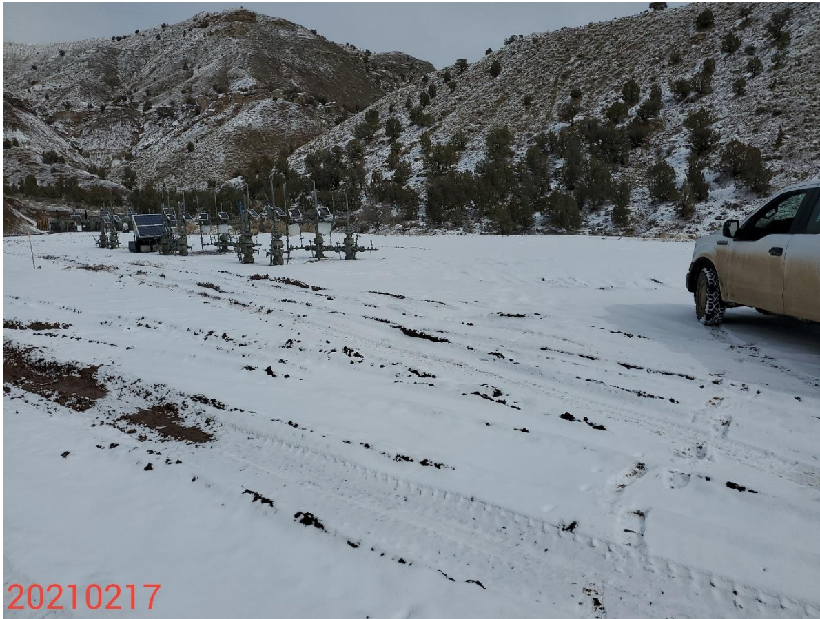
Photo 2: Photo taken from the south end of the Location, facing northeast. Photo provides an overview of the Location