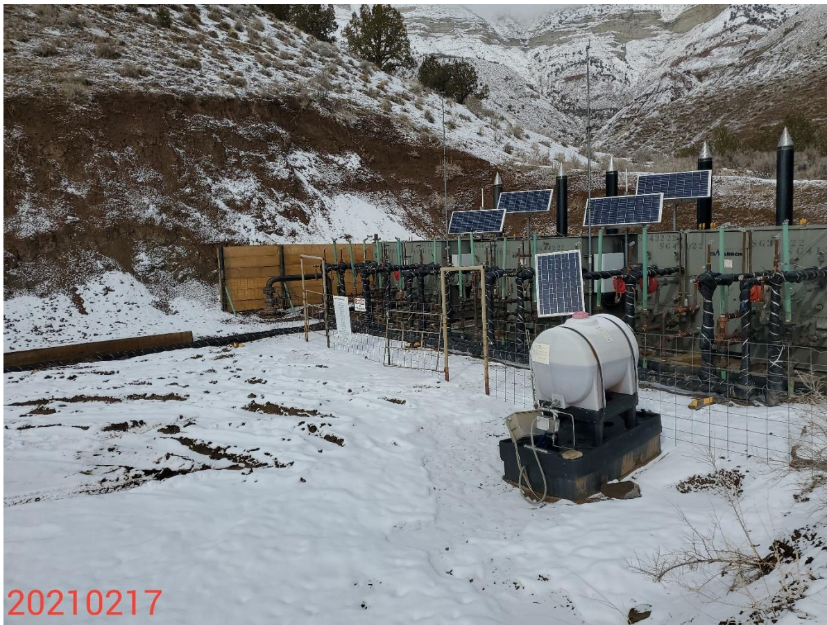
Photo 7: Photo taken from the northeast end of the Location, facing north. Photo shows separator equipment and cut slopes. BMPs missing or insufficient to manage run-on, and stabilize/protect the cut slope; sediment observed falling from cut slopes during inspection.