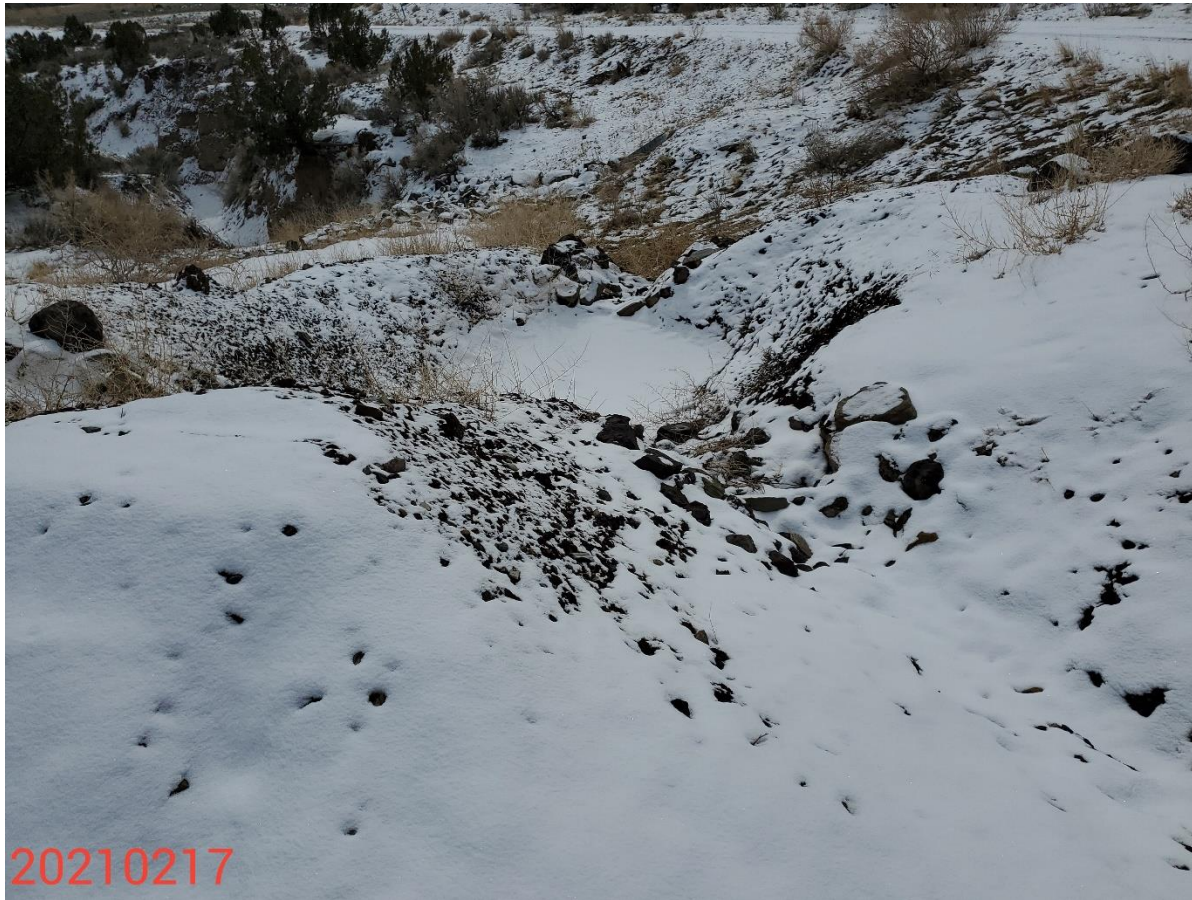
Photo 5: Photo taken from the south end of the Location, facing south. Photo of sediment trap.