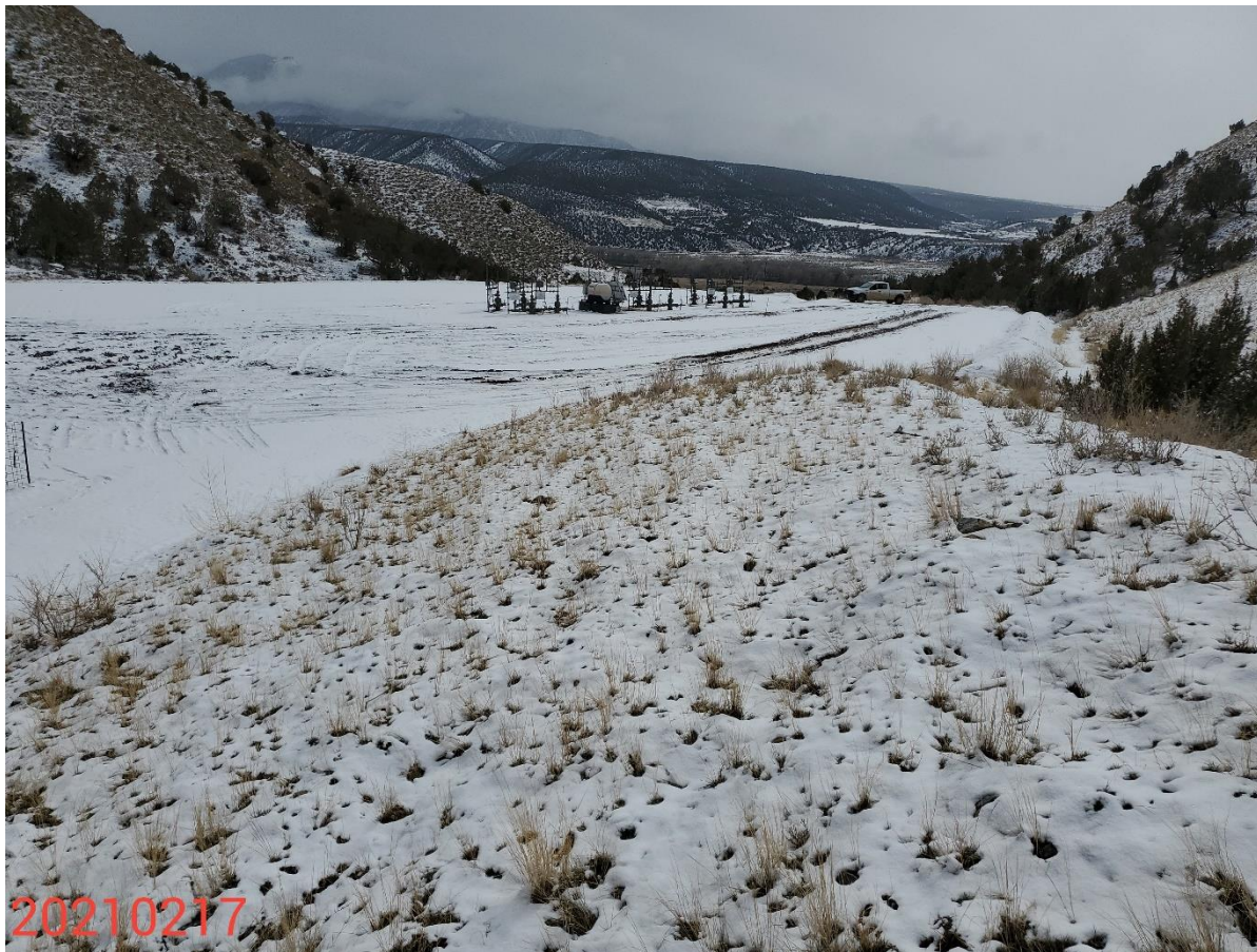
Photo 12: Photo taken from the northwest corner of the Location, facing south. Photo provides an overview of the production area, and interim areas. Visible vegetation predominantly desirable perennial plant species.