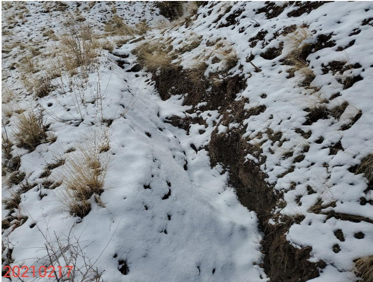
Photo 14: Continued from photo 13. Photo shows ditch has not been constructed in accordance with good engineering practices; stormwater incision within the ditch evident.