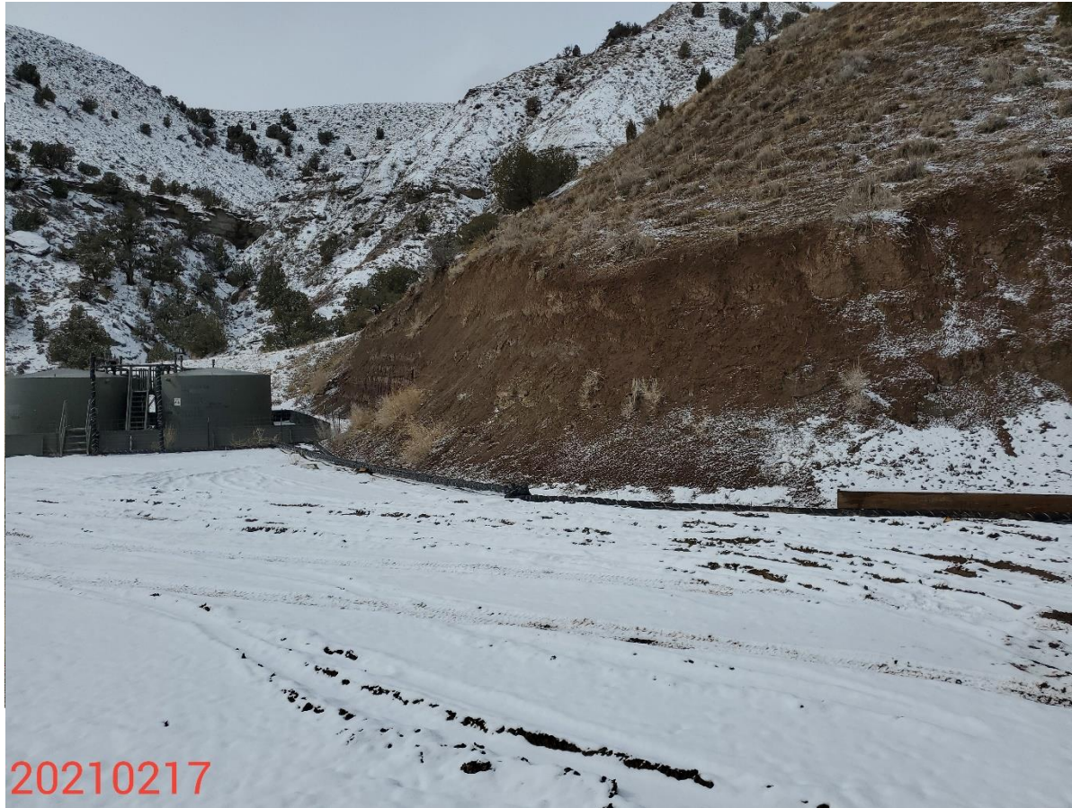
Photo 8: Photo taken from the north end of the Location, facing west. Photo shows cut slope has been constructed with a steep slope and that BMPs to manage run-on, and to stabilize/protect the cut slope are missing or insufficient.