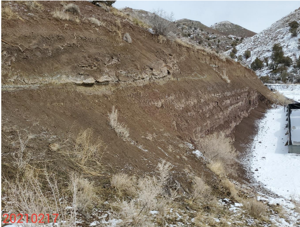
Photo 11: Photo taken from the northwest corner of the Location, facing east. Photo shows cut slope has been constructed with a steep slope and that BMPs to manage run-on, and to stabilize/protect the cut slope are missing or insufficient.