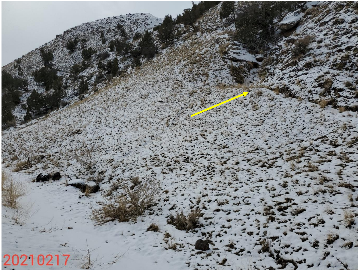
Photo 13: Photo taken from the west end of the Location, facing southwest. Photo shows interim areas and ditch along the west end of the Location/slope.