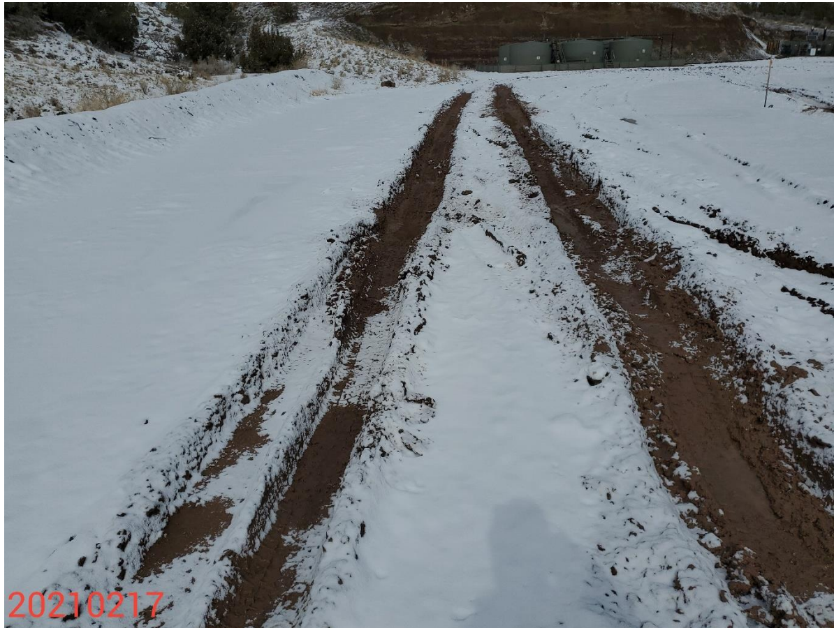
Photo 3: Photo taken from the west end of the Locaiton, facing north. Photo shows tracking/rutting on the location; BMPs to stabilize pad missing or insufficient.