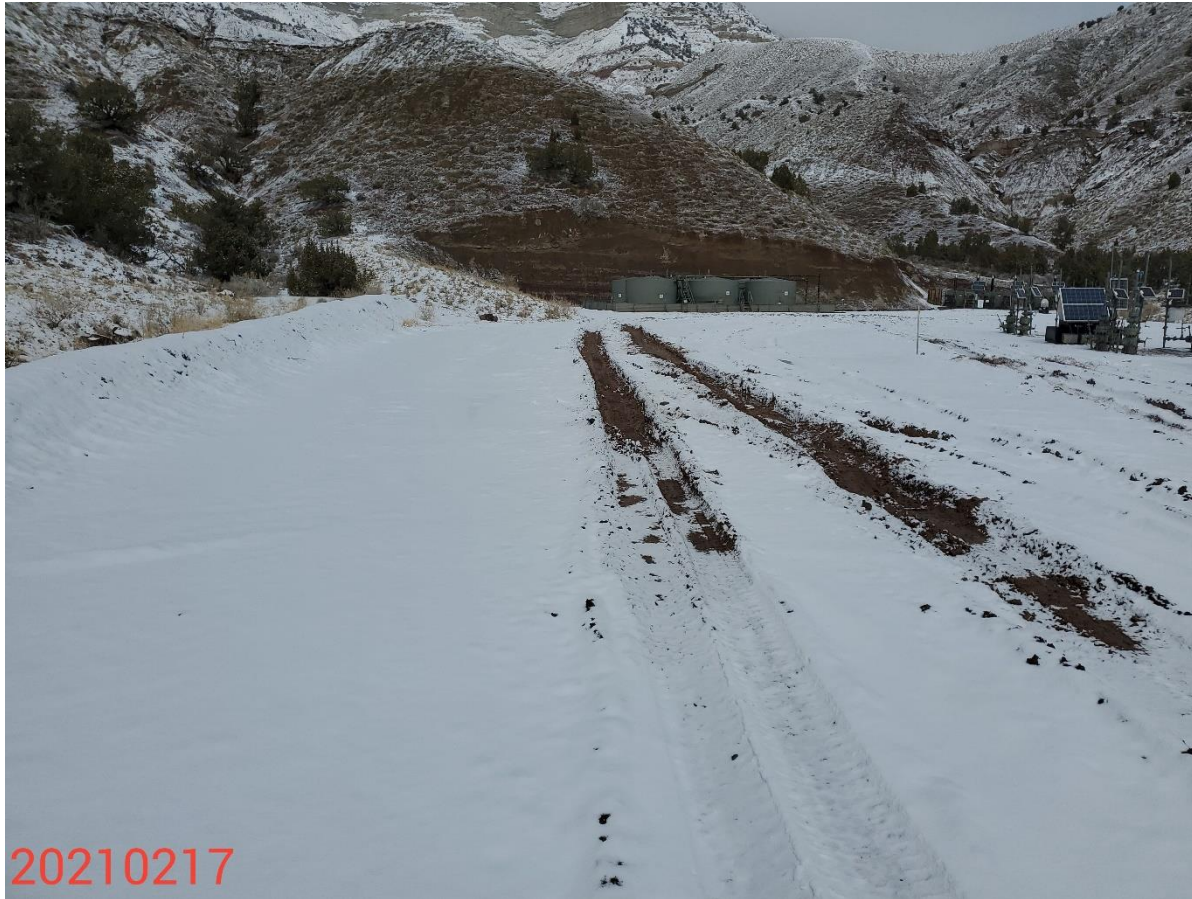
Photo 1: Photo taken from the south end of the Location, facing north. Photo provides an overview of the Location. Photo also show vehicle tracking/rutting issues observed on the Location.