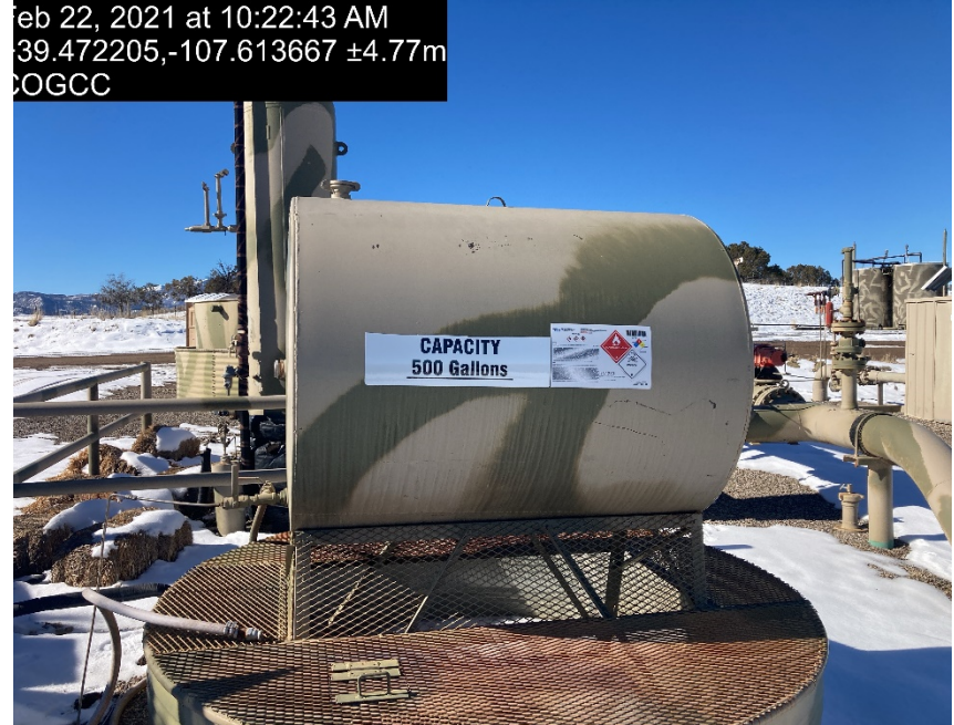
location/ Tank signage is TEP

Feb 22, 2021 at 10:22:43 AM 39.472205,-107.613667 ±4.77m COGCC