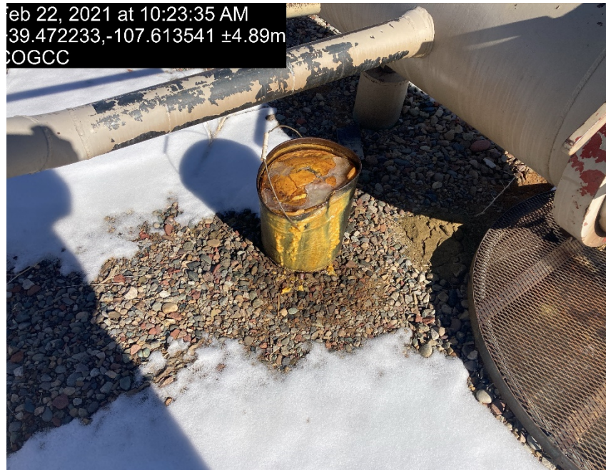
Paraffin over running the bucket/ staining