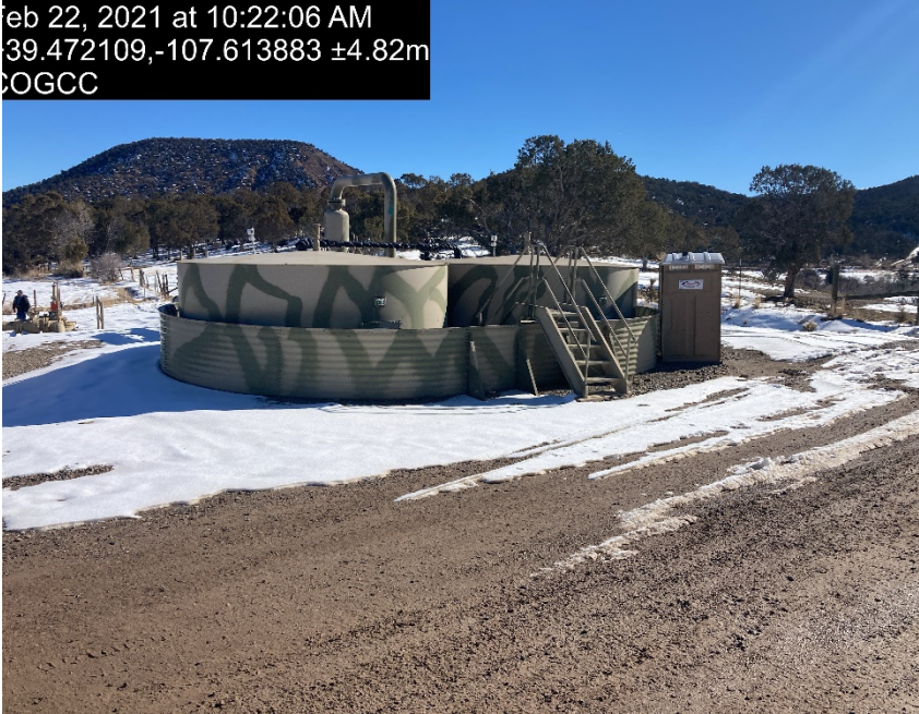
location/ Tank signage is TEP

Feb 22, 2021 at 10:22:06 AM 39.472109,-107.613883 ±4.82m COGCC