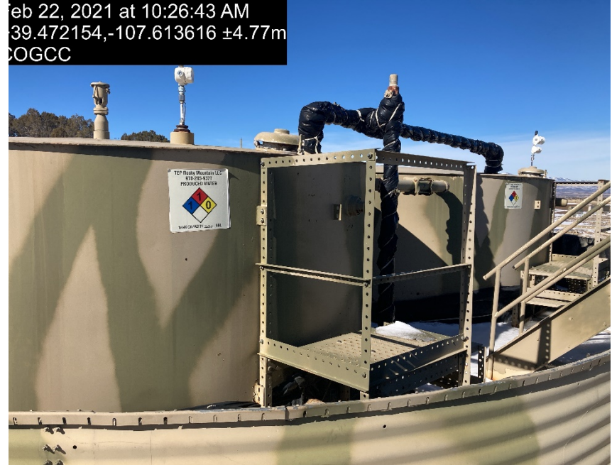
location/ Tank signage is TEP

Feb 22, 2021 at 10:26:43 AM 39.472154,-107.613616 ±4.77m COGCC