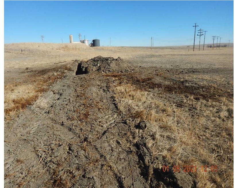
View of surface impacts at flowline release; looking NE toward Pierce battery.