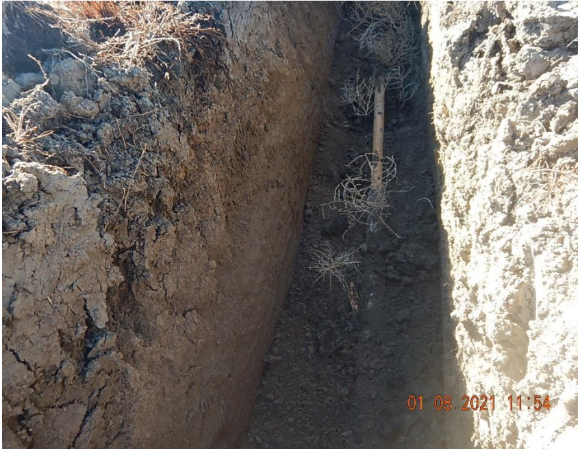
Flowline pipe exposed in trench excavation (yellow jacket pipe/ yellow external coating) .