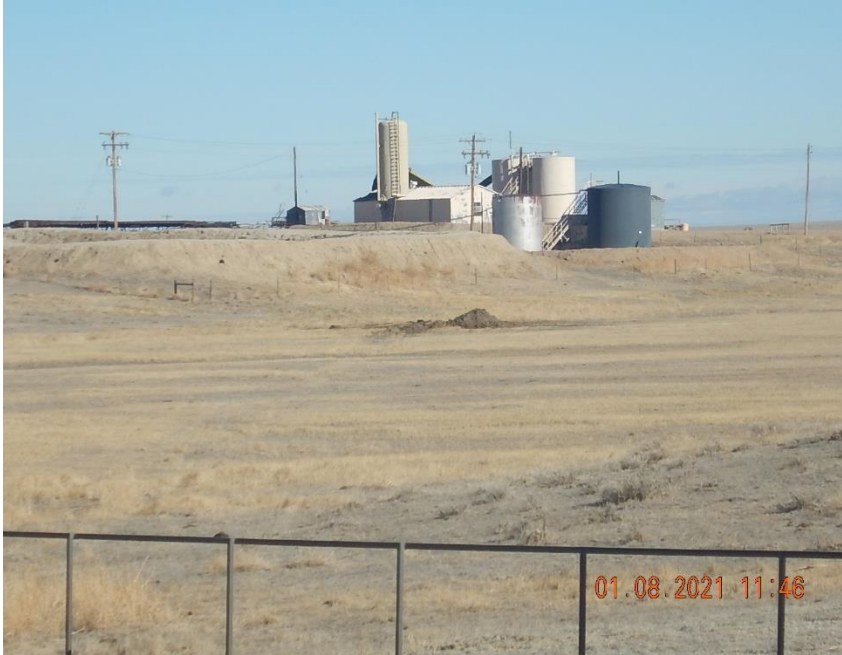
View of excavation at off location flowline release; looking NE from wellhead to battery.