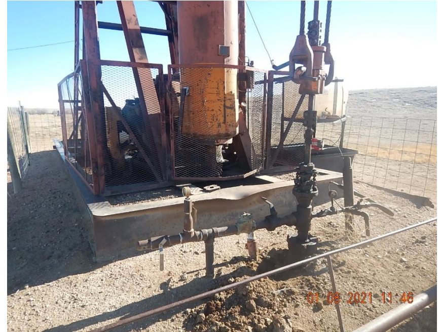
Pierce 1 wellhead (Shut in); No OOSLAT