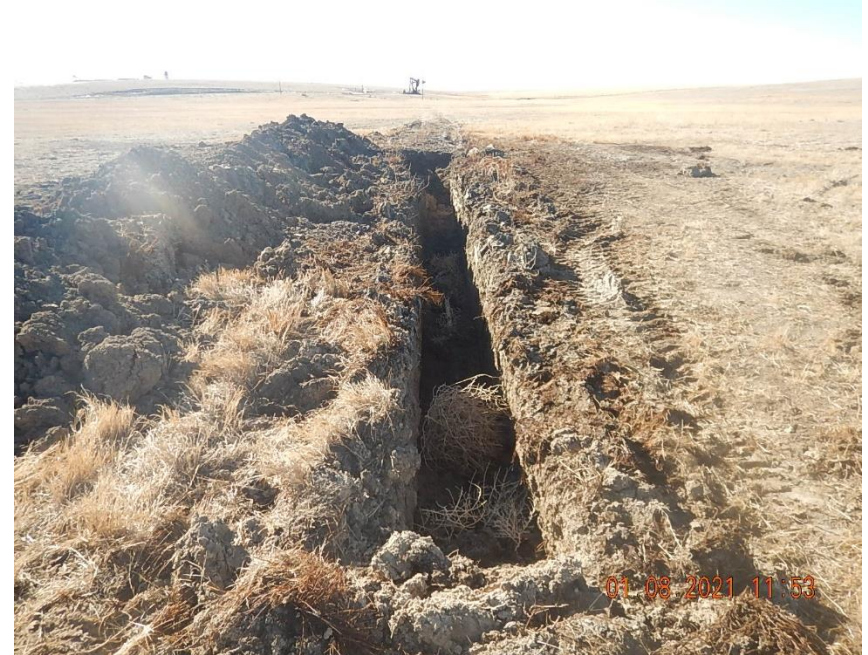
View from trench excavation at spill point; looking SW toward Pierce 1 well.