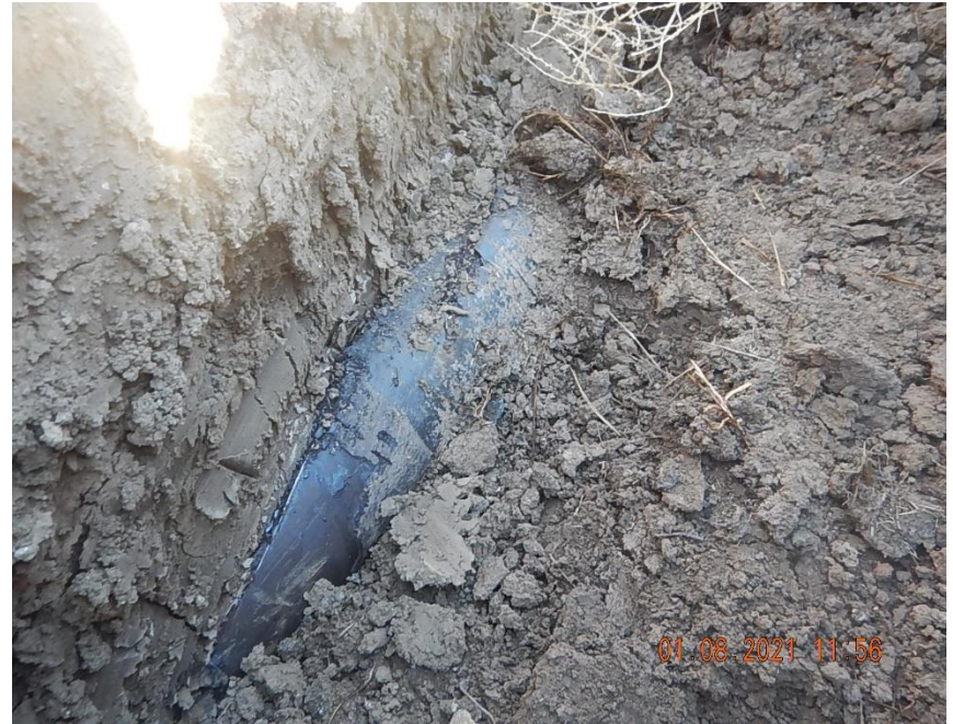
Larger black pipe exposed at NE end of trench excavation; Excavation equipment scored pipe coating.