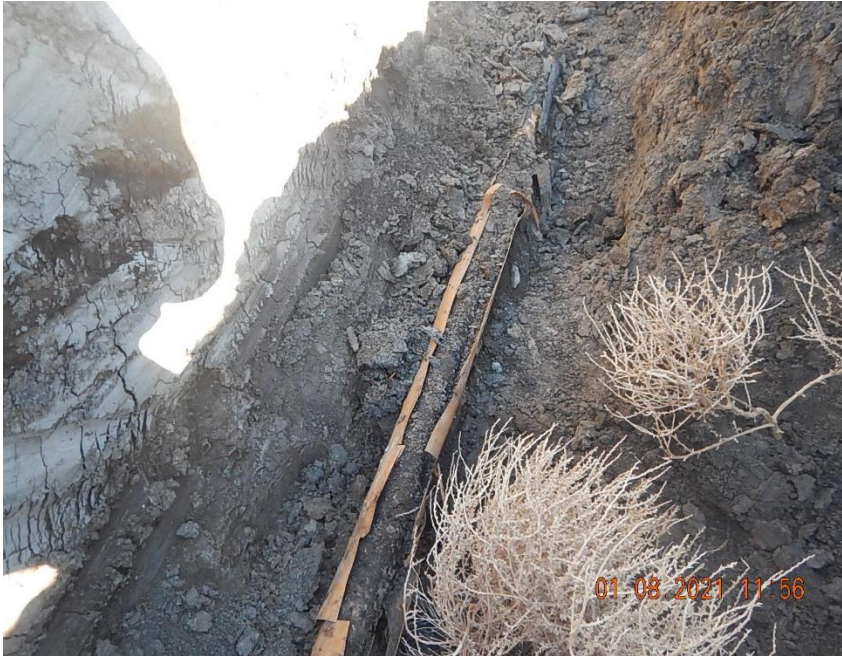
View of Pierce 1 off location flowline exposed in excavation; Significant external coating damage observed.