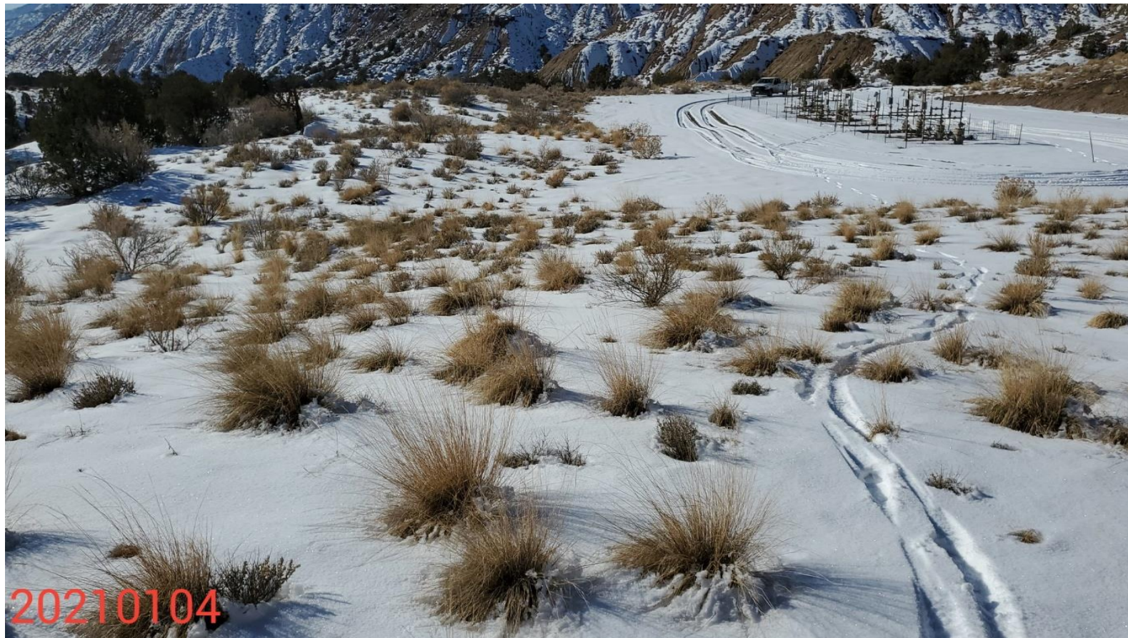
Photo 5: Photo taken from the southeast end of the Location, facing west. Photo provides overview of the Location and reclamation areas.