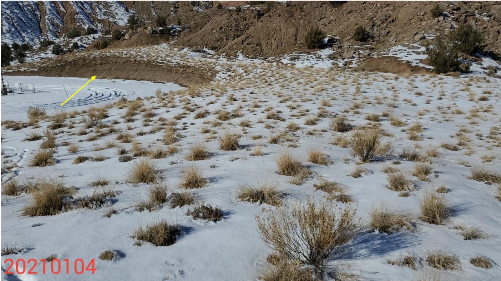
Photo 6: Photo taken from the southeast end of the Location, facing northwest. Photo provides overview of the Location and reclamation areas. Photo also shows slopes along the west end of the Location remain bare and exposed soils. Additional reclamation required.