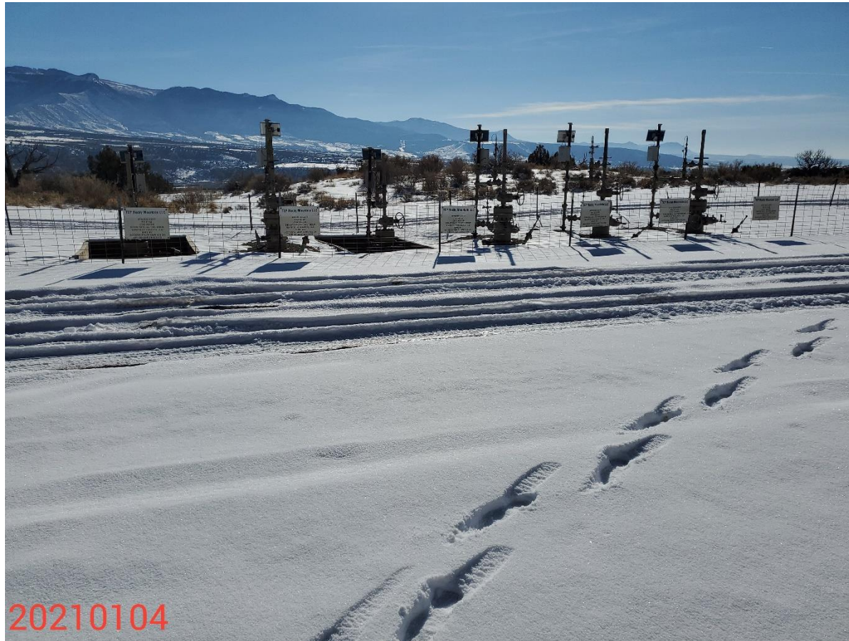
Photo 2: Photo taken from the north end of the Location, facing southwest. Photo shows active wells on the Location.