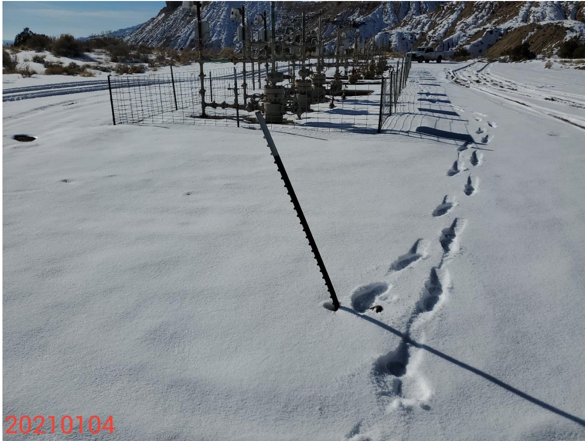
Photo 4: Photo taken from the east end of the Location, facing west. Photo shows example of well markers observed on the Location.