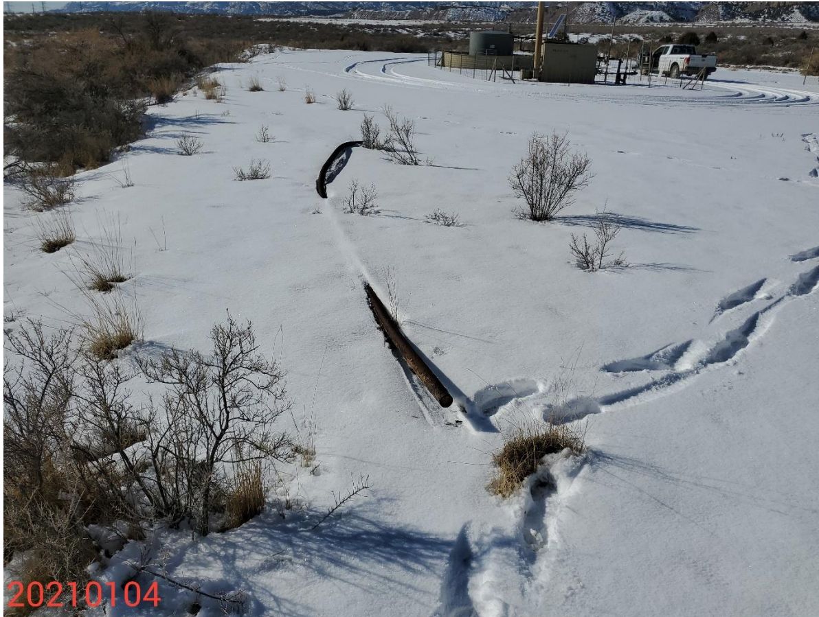
Photo 7: Photo taken from the east end of the Location, facing west. Photo shows pipe debris.