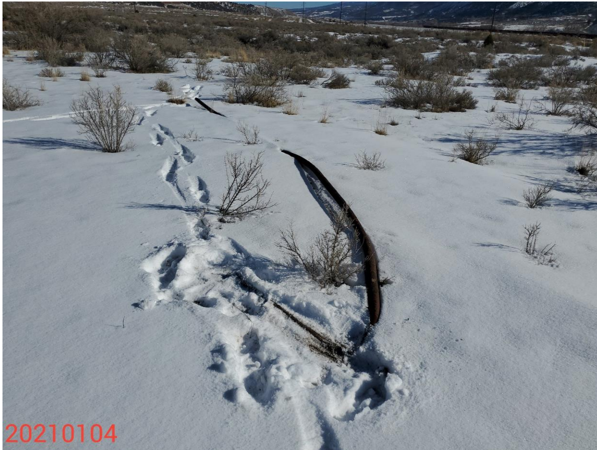
Photo 6: Photo taken from the east end of the Location, facing east. Photo shows pipe debris.