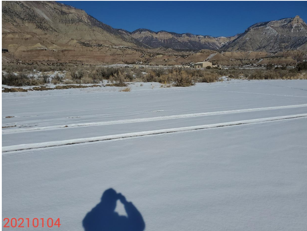
Photo 2: Photo taken from the north end of the Location, facing north. Photos 2-5 provide an overview of the Location from North, Northeast, Southeast to South.