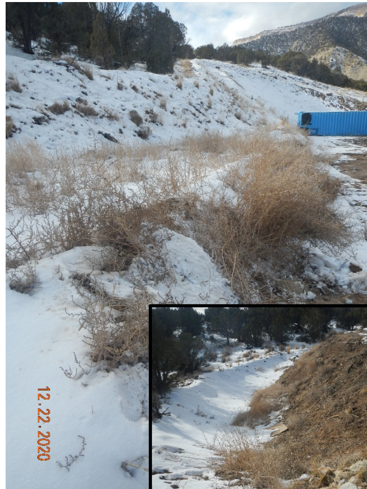
Photo#7: Debris weeds. Insert, area where it appears weeds were cleaned out.