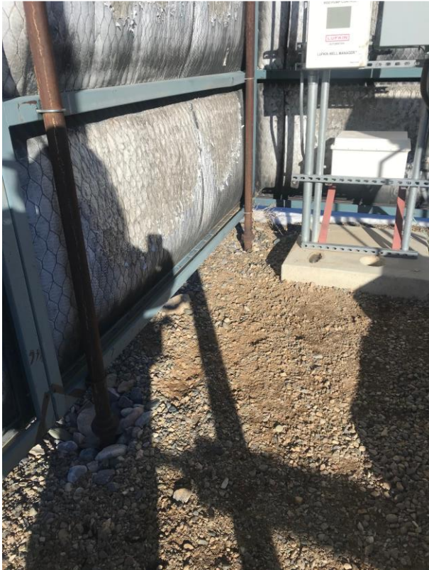
Choose an item.