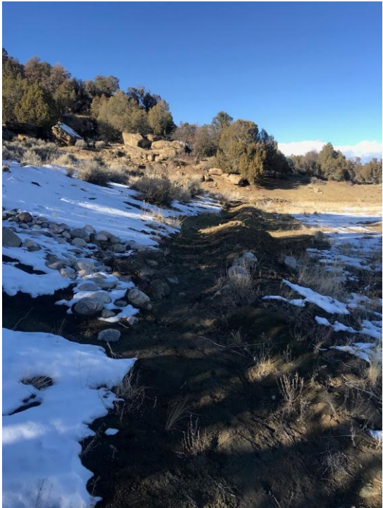
Choose an item.