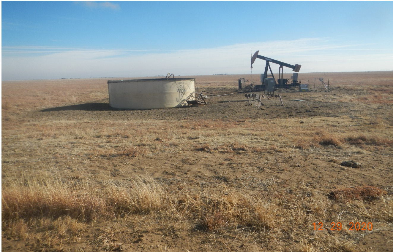
Photo 1. Facing west toward the location..