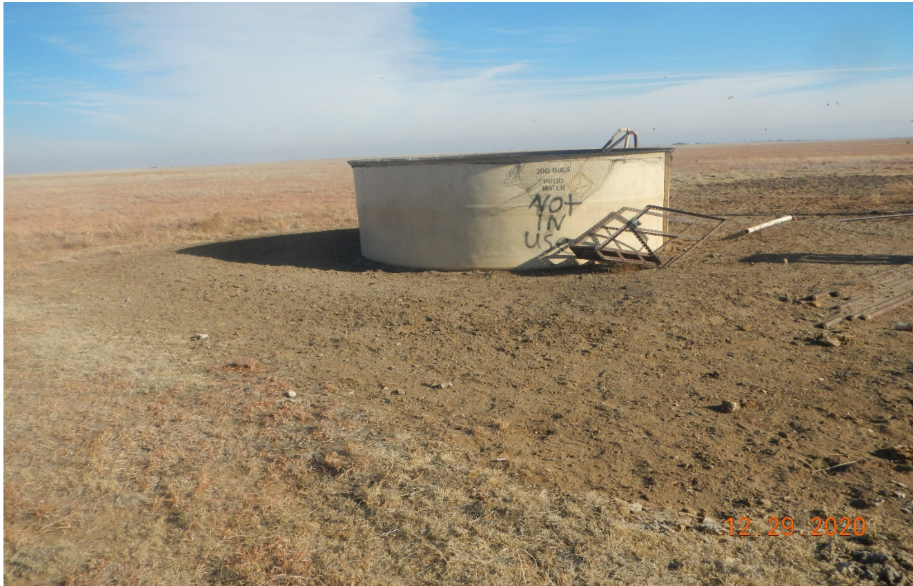
Photo 2. The tank is marked as not in use. Unused equipment must be removed. Additionally the berm around the tank is insufficient.