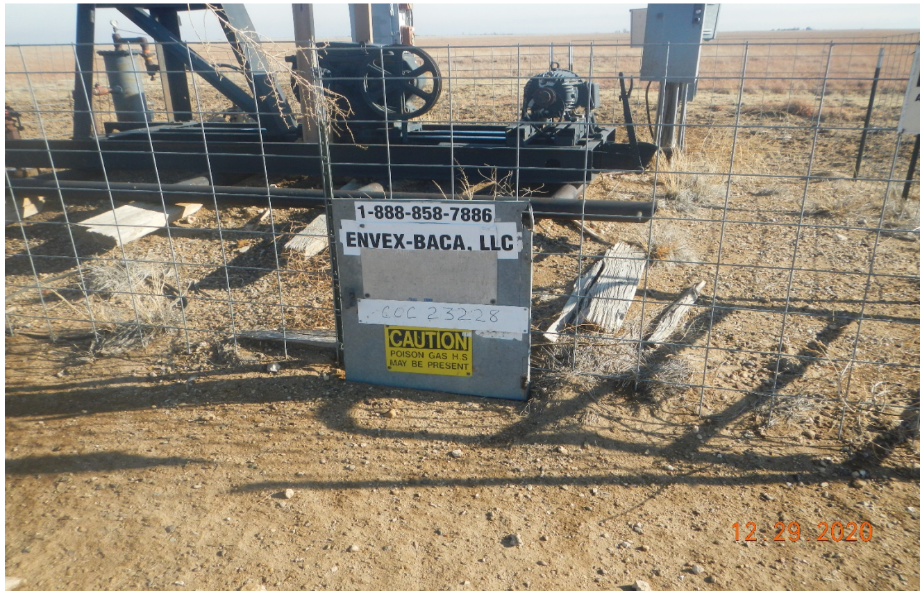
Photo 5. The well sign does not comply with 210.b.