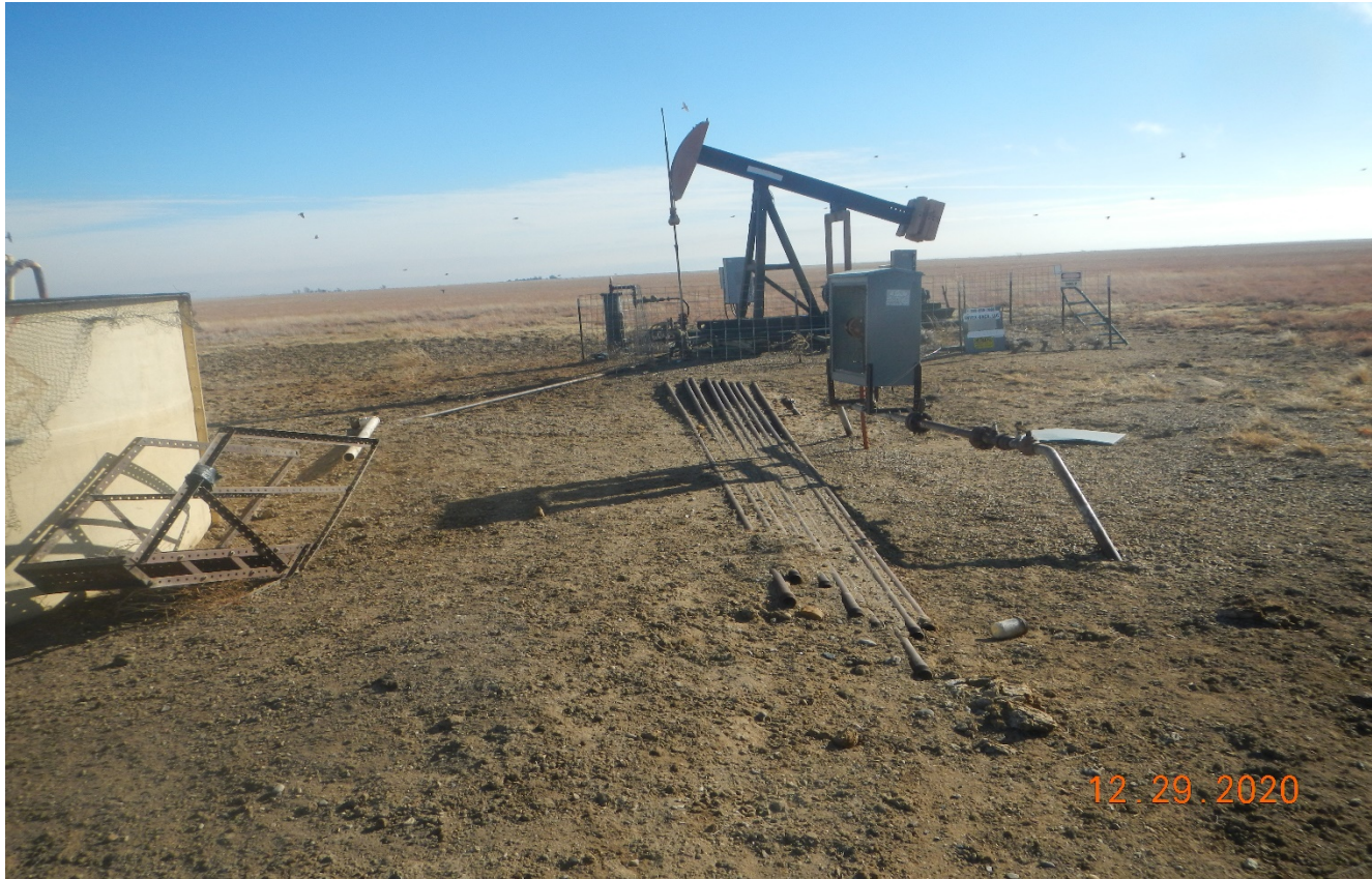
Photo 3. There is unused pipe laying at the location partially buried in dirt. Unused equipment must be removed.