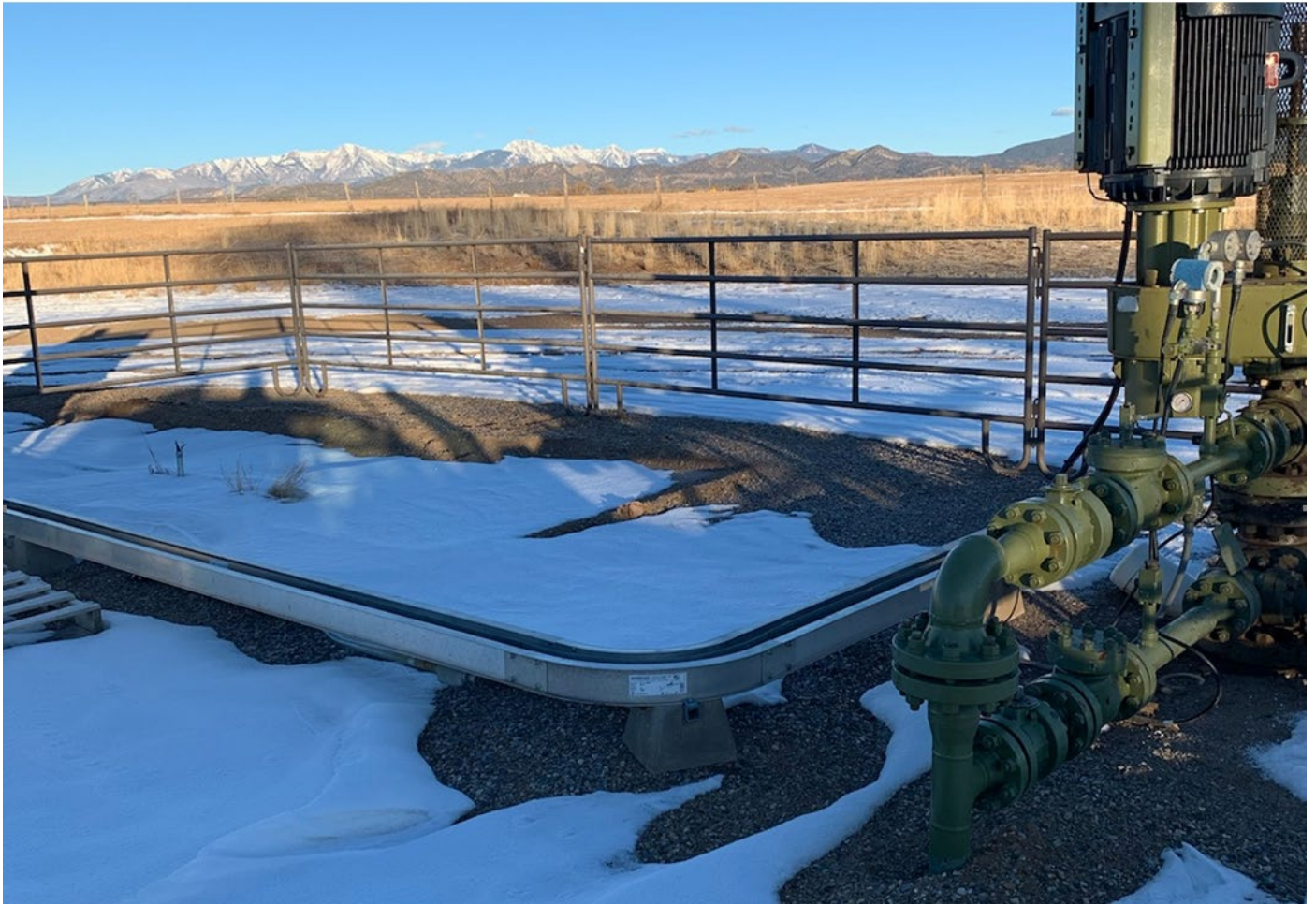
Operator trash, debris or unused equipment removal and disposal