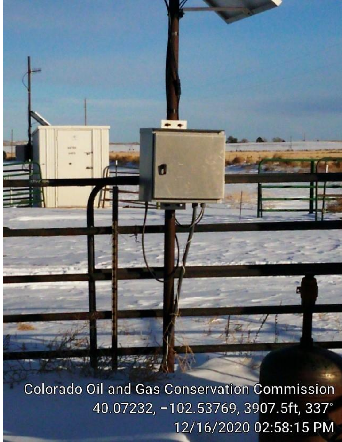
Colorado Oil and Gas Conservation Commission 40.07232, -102.53769, 3907.5ft, 337° 12/16/2020 02:58:15 PM