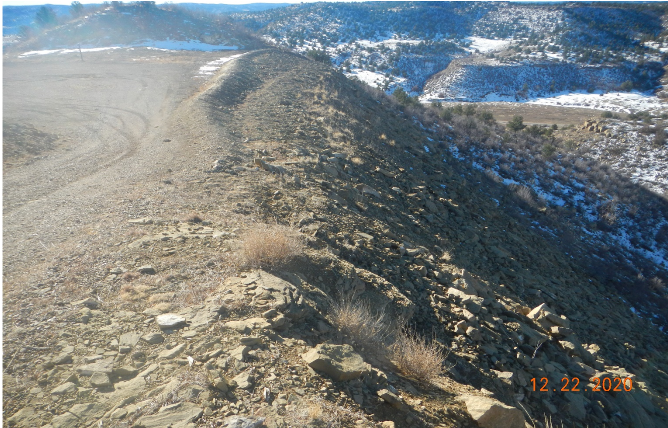
Photo 3. Facing toward the west fill slope.