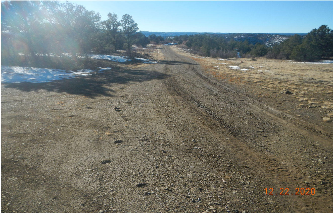
Photo 1. Facing southwest toward the access road which has not been reclaimed.