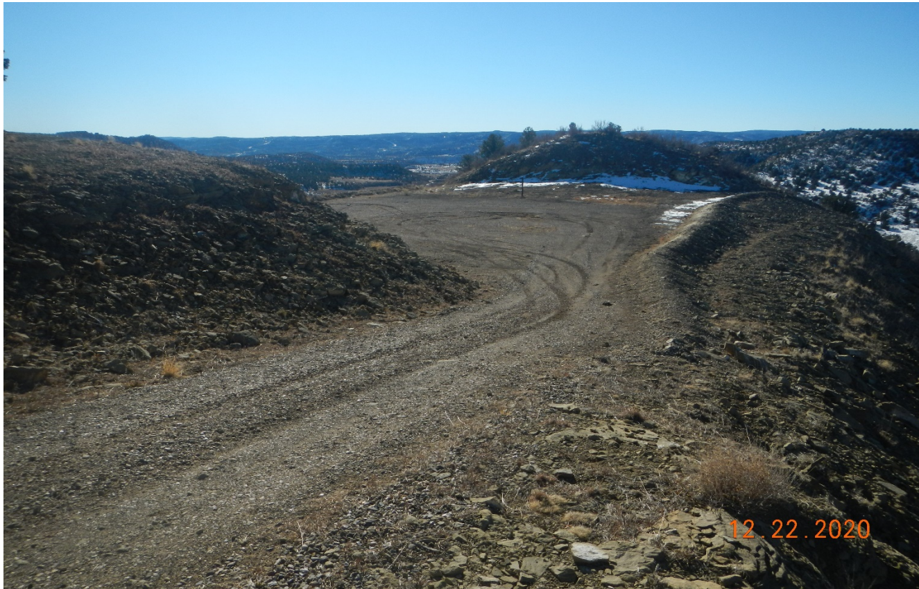
Photo 2. Facing south toward the location which has not been recontoured and reclaimed.