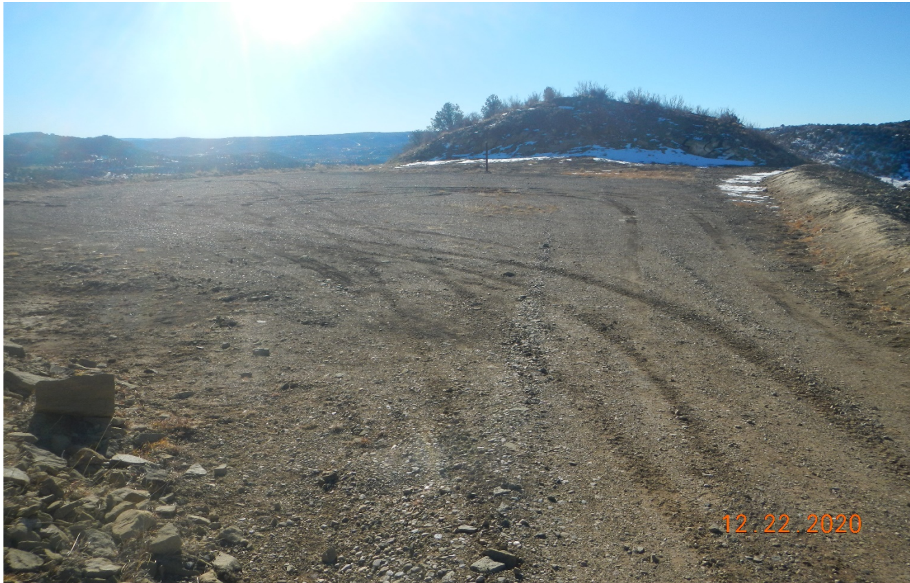
Photo 4. Facing south toward the location.