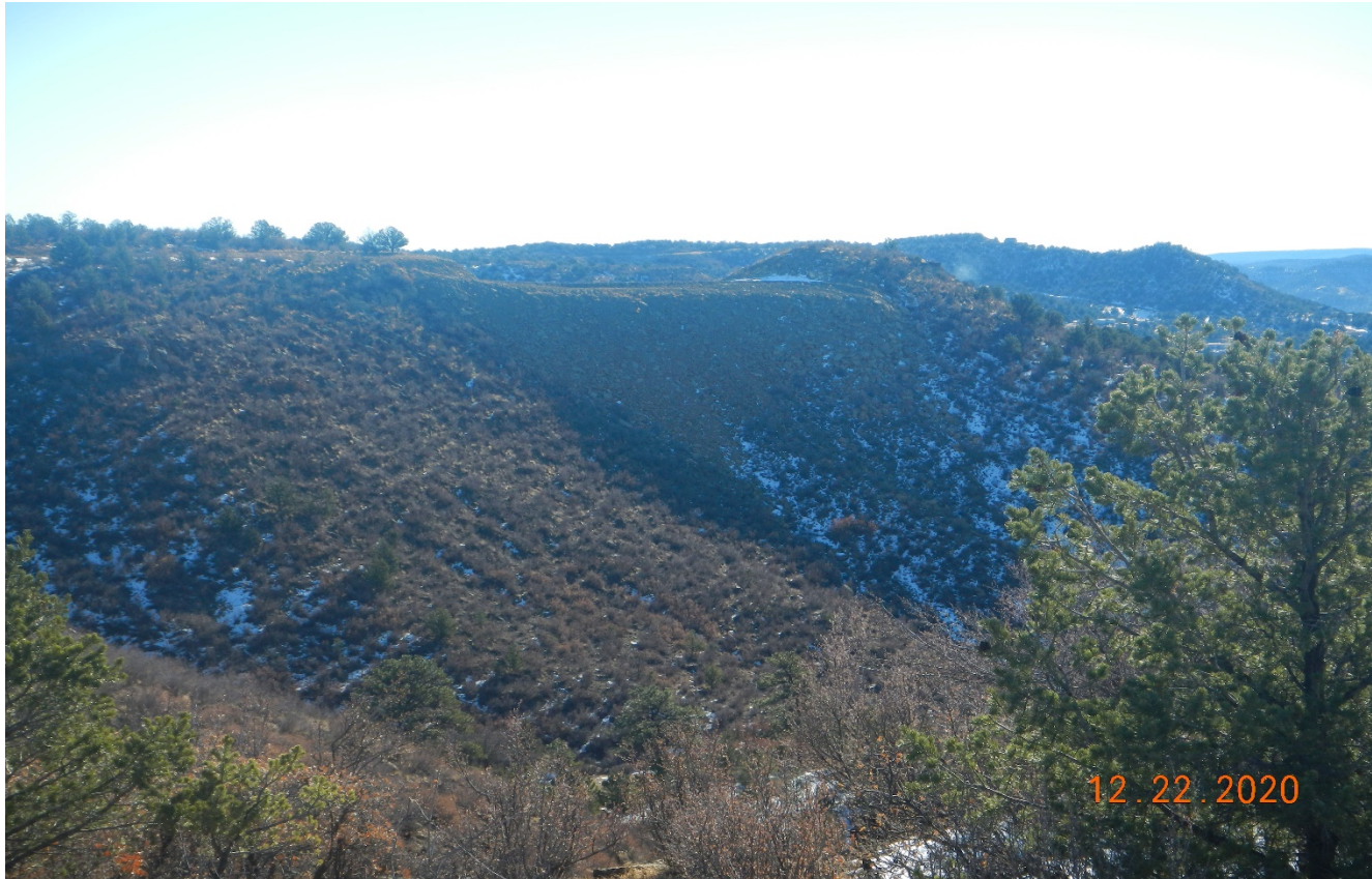
Photo 6. View of the location from a distance across the canyon.