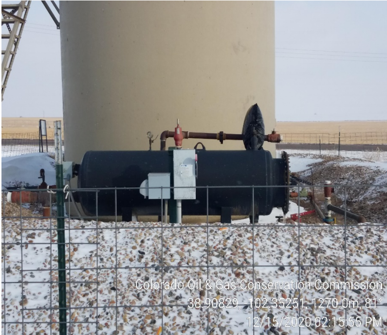
5. Water knockout