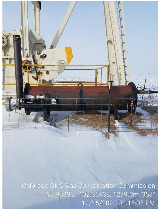
3. Line heater by unit