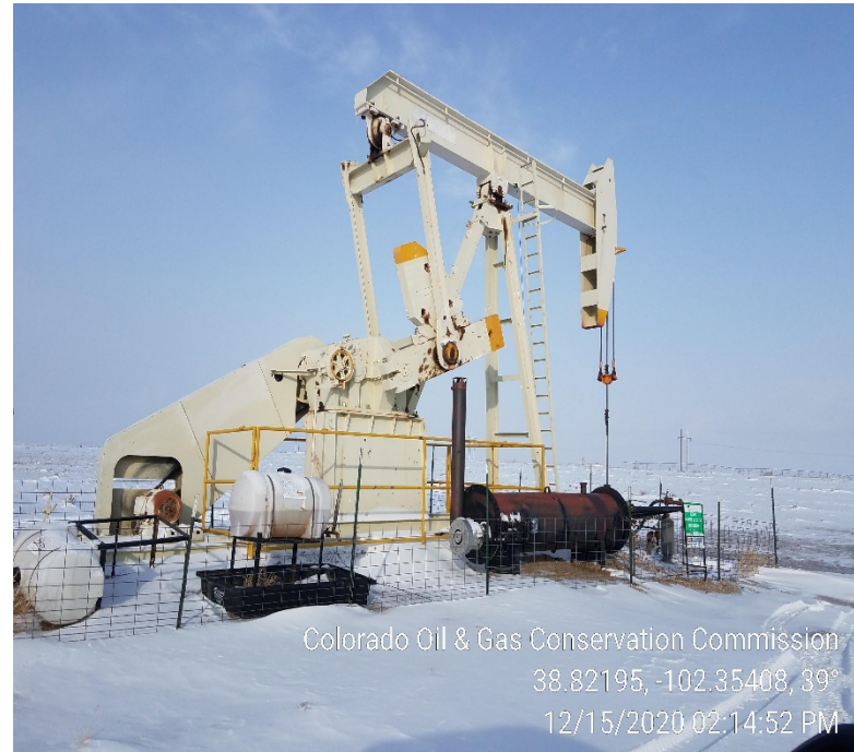
2. Wellhead equipment