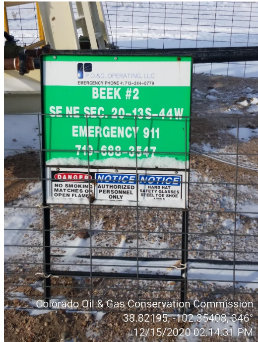
1. Lease sign by well