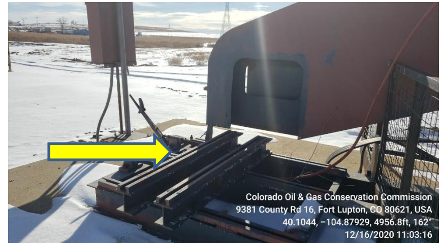
Photo 6 no motor attached to pump jack