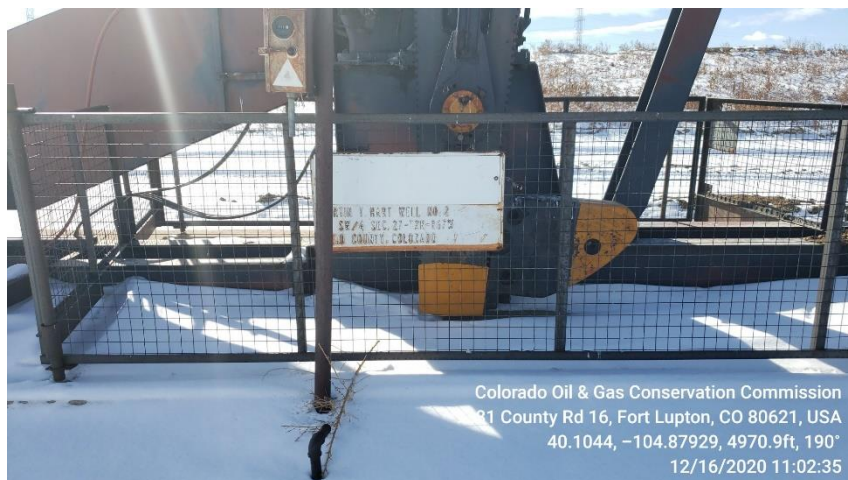
Photo 1 WH sign