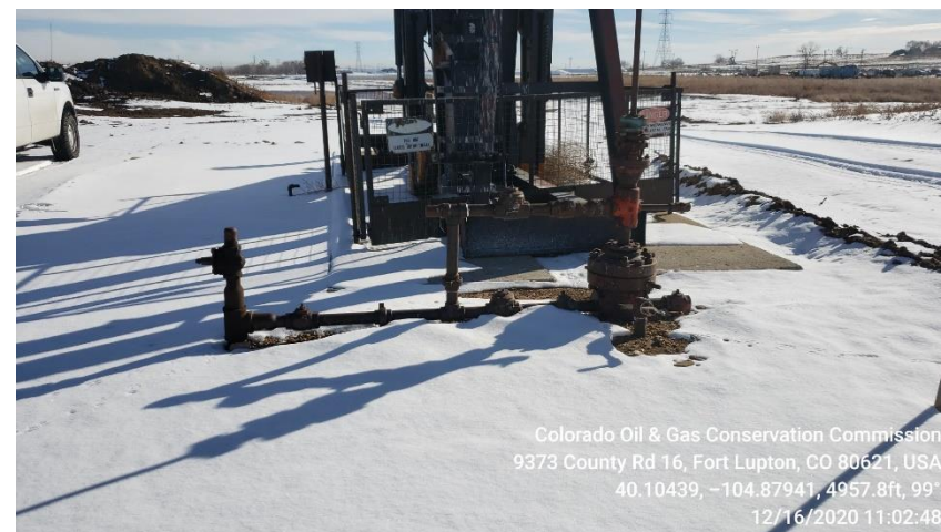
Photo 2 WH