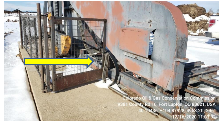
Photo 4 pump jack belts free no motor