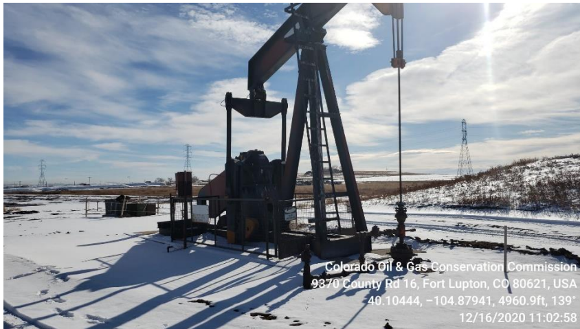
Photo 3 pump jack not in use