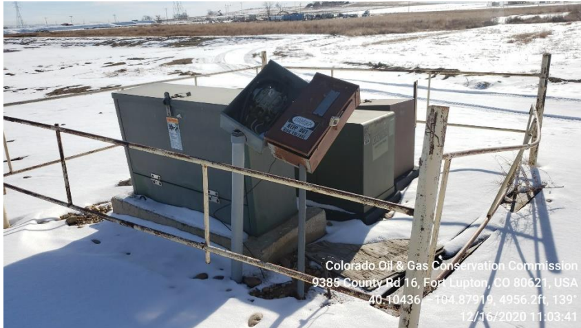
Photo 7 unused Transformers, electric panel and meter box.