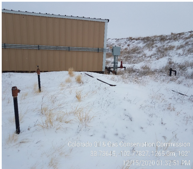
9. Metal shed, Misc risers and piping, No LO/TO.