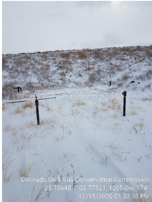
7. Misc flowline risers, No LO/TO.