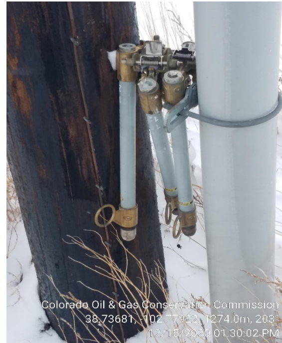
4. Fuses hung on electric pole.