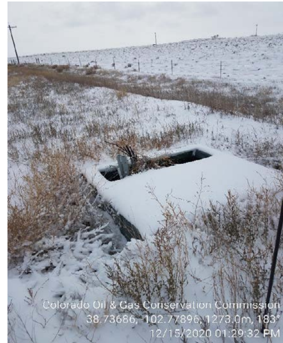
2. Cement pad with exposed electric wires.