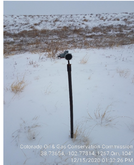
6. 1" gas supply riser, Not LO/TO.