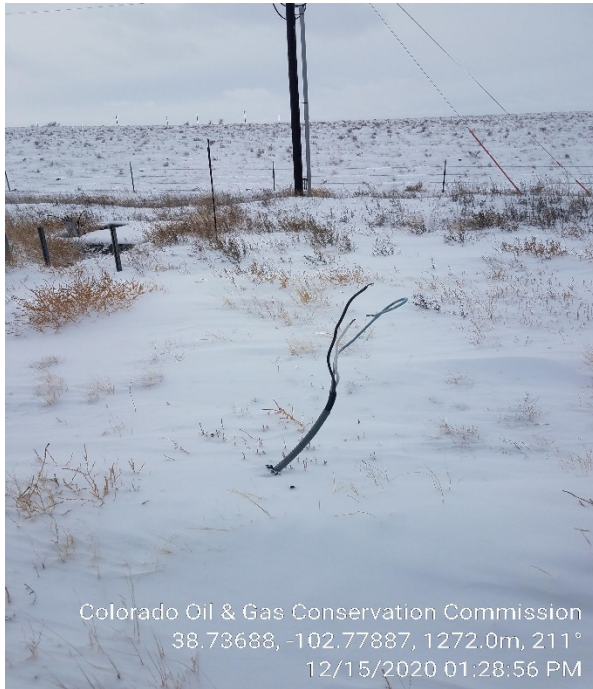
5. Electric wire sticking out of ground.