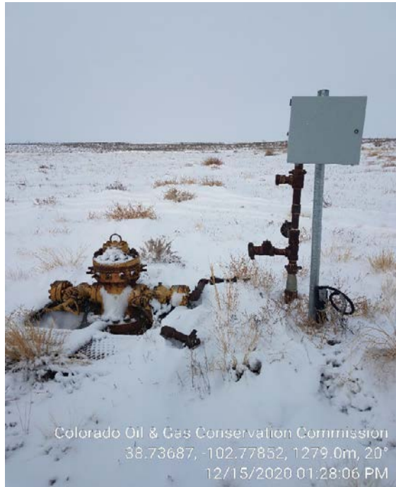
1. Wellhead, No visible lease sign