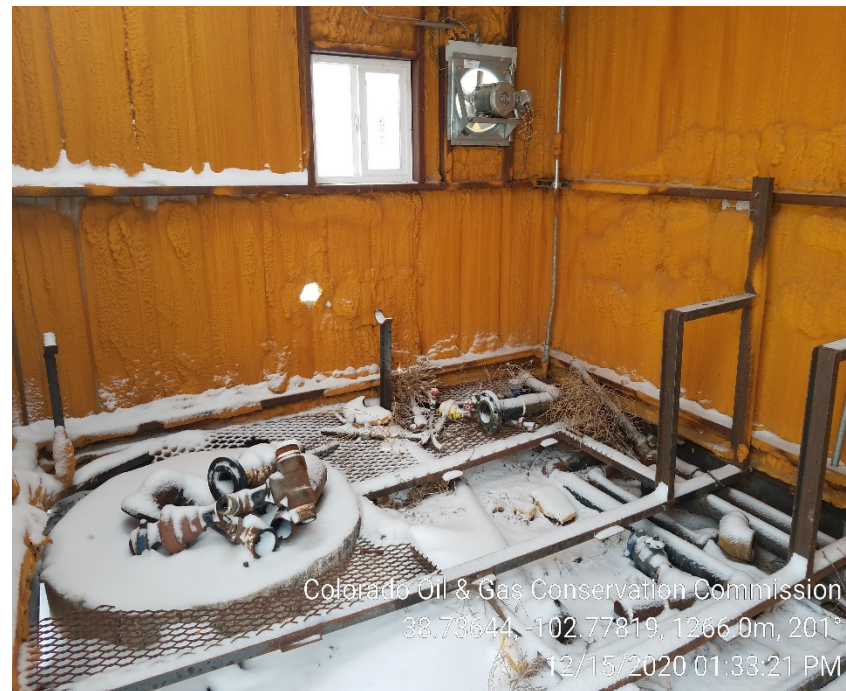
8. Misc risers, No LO/TO, Cement pad & elec panels.