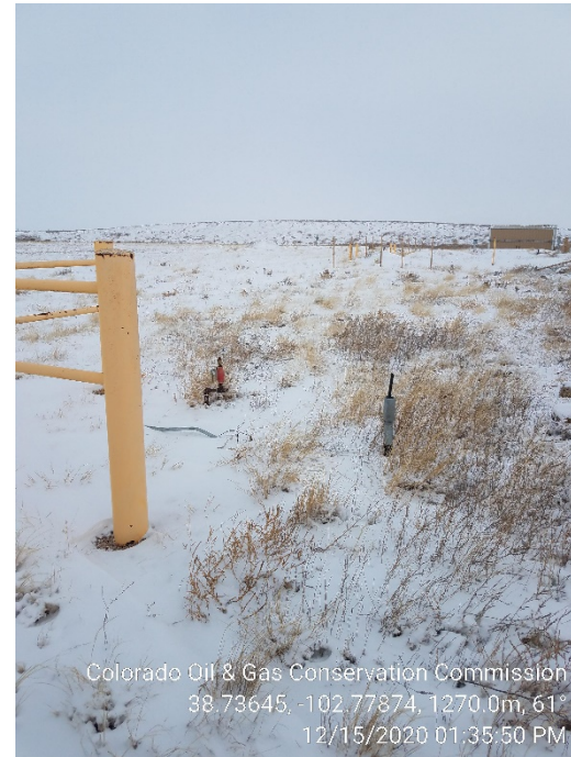
8. Misc risers, No LO/TO.