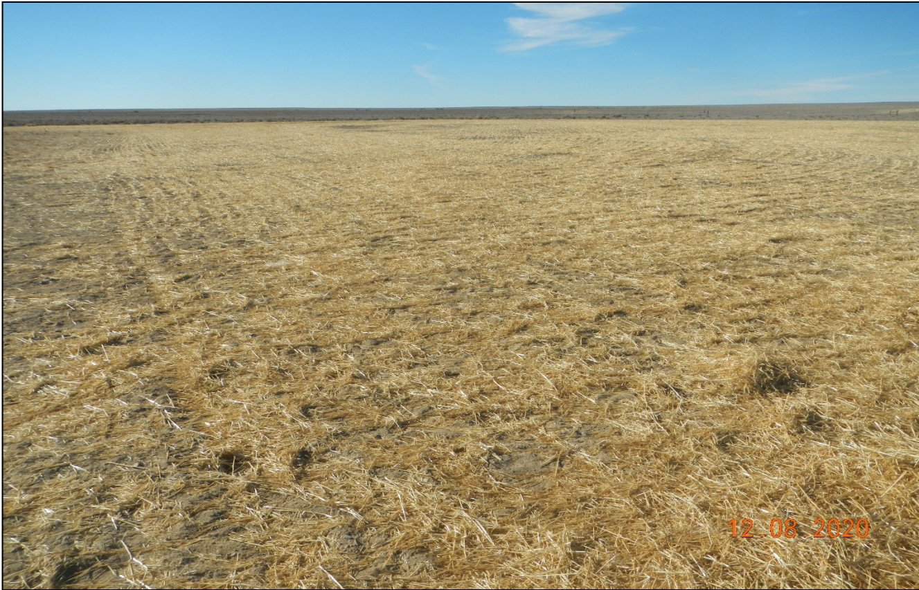
Photo 6. Facing west at the north side of the location.