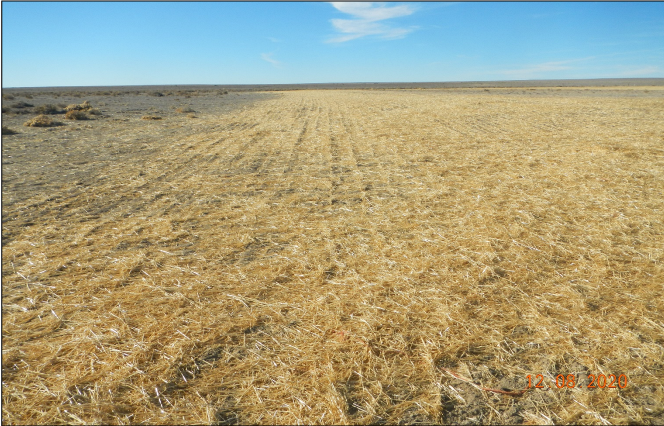
Photo 3. Facing west at the south side of the location. Straw mulch has been crimped into the soil.