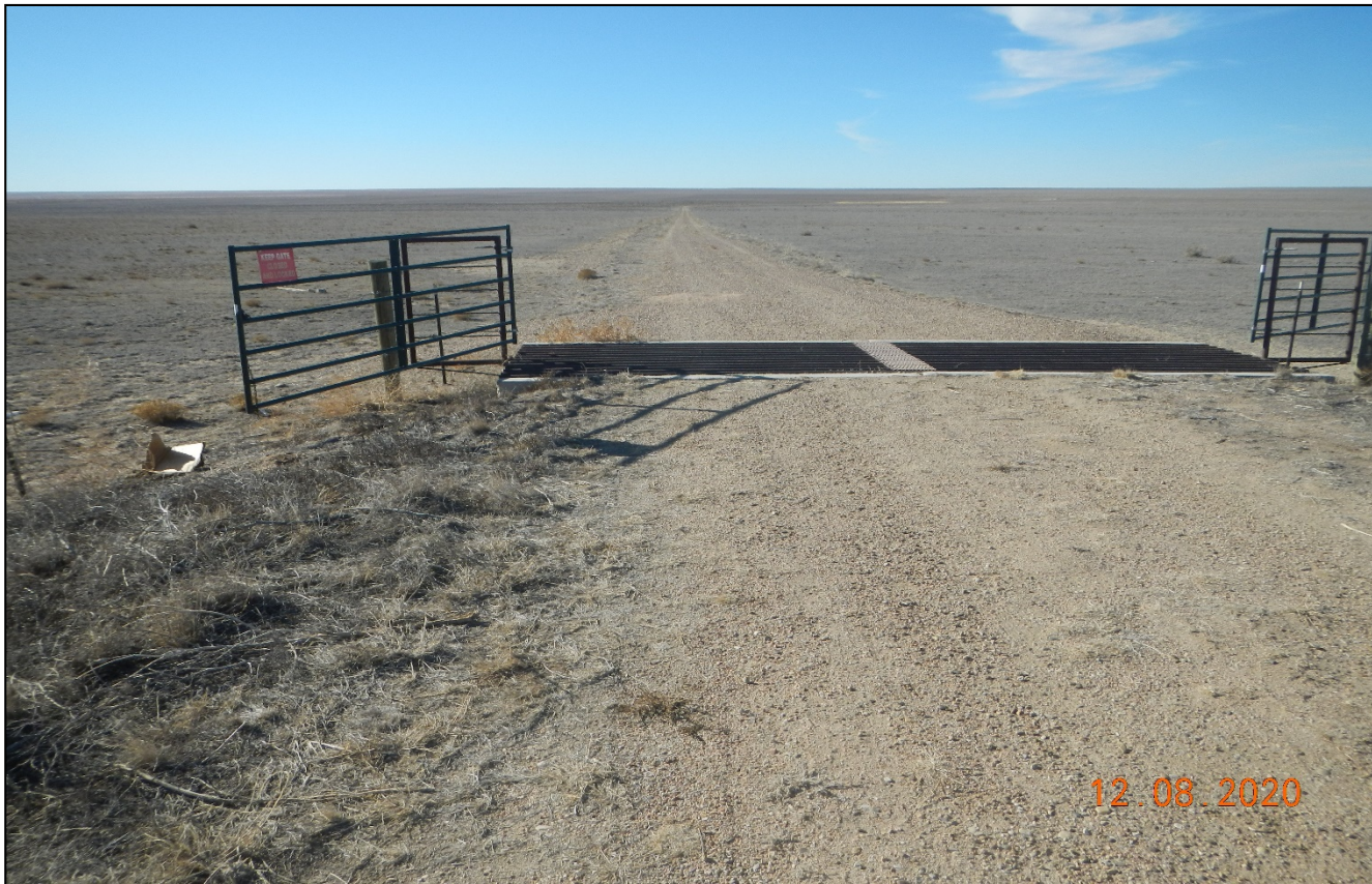
Photo 1. Facing west at the beginning of the access road.