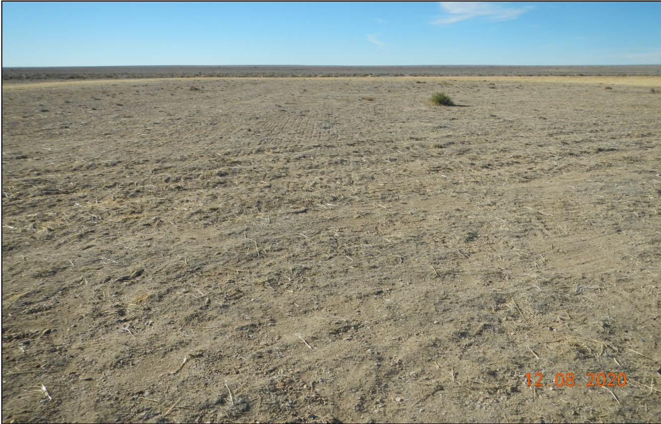
Photo 5. Facing west at center of the location. This area was not disturbed due to existing vegetation.