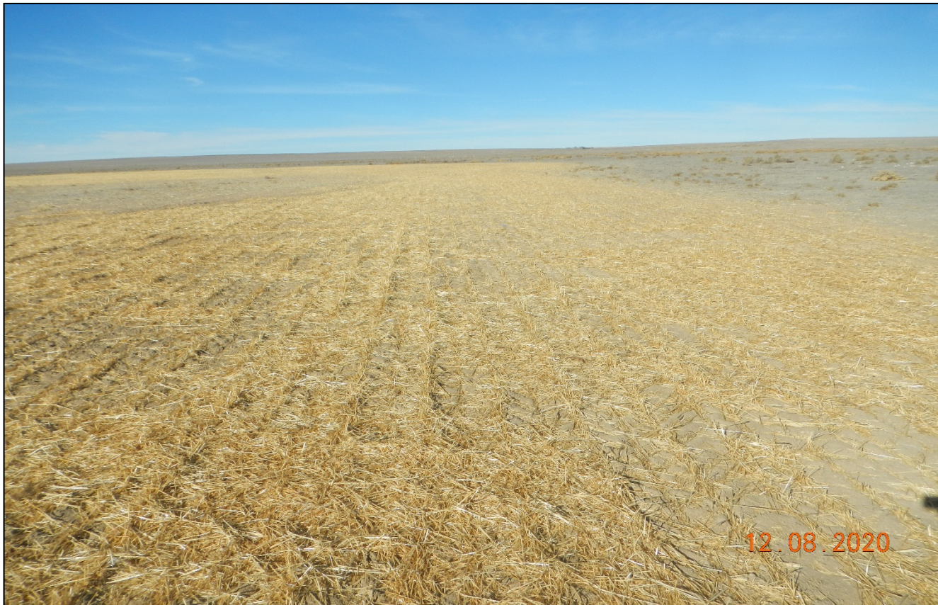
Photo 4. Facing north at east side of the location.