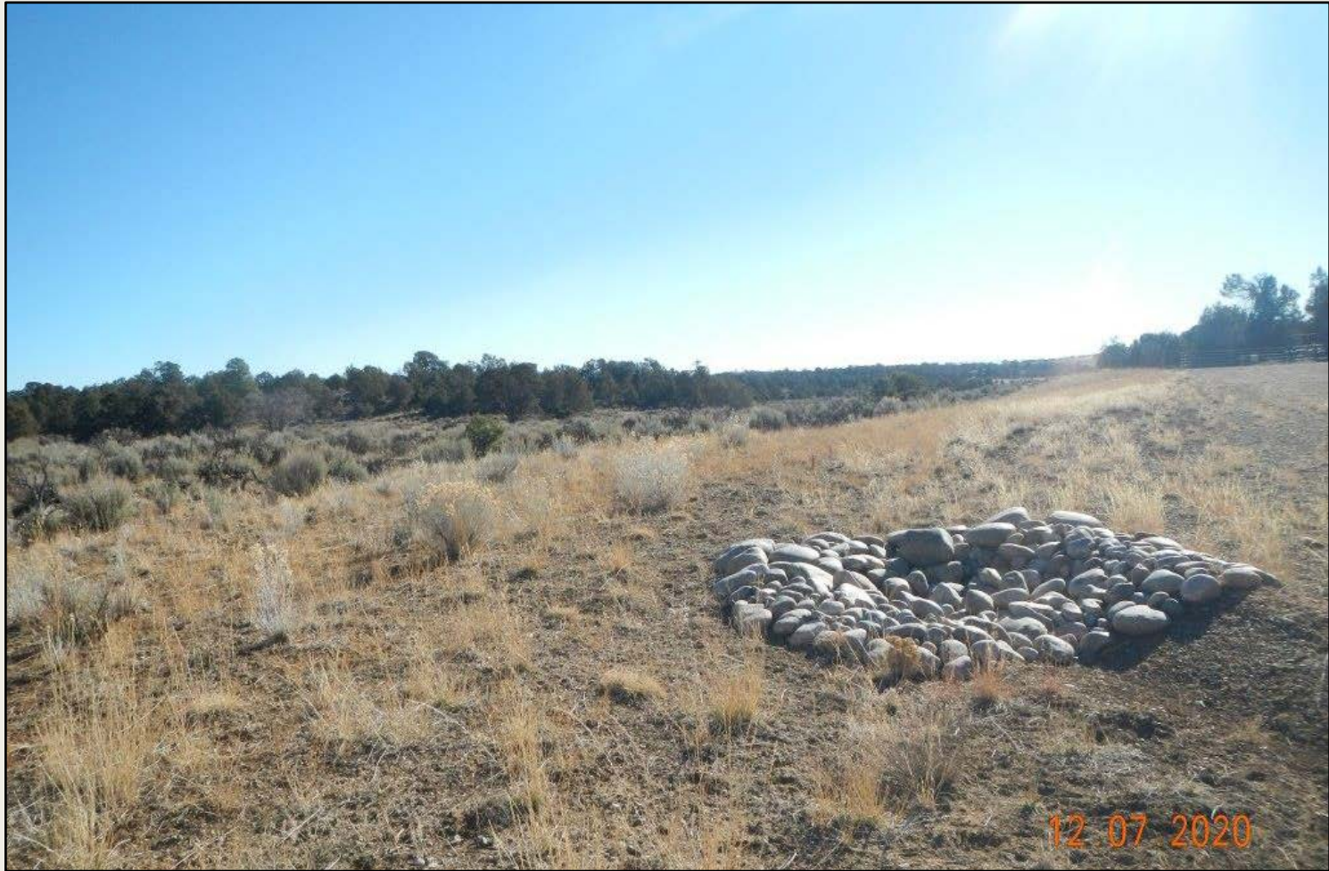
Photo 2. View of the eastern fill slope, facing southward. Revegetation is progressing with crested wheatgrass, western wheatgrass, intermediate wheatgrass, and sand dropseed.