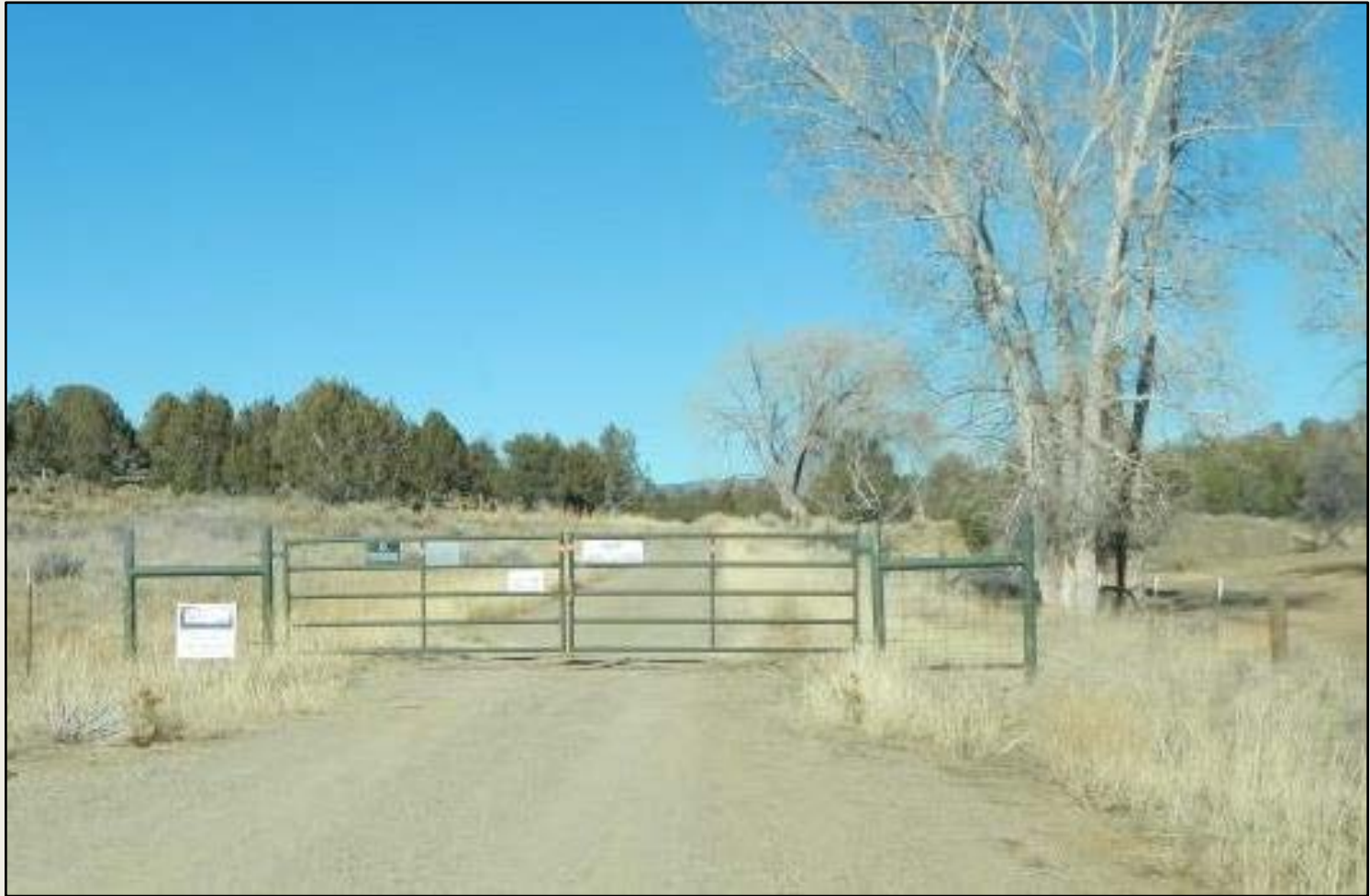
Photo 7. View of closed gate after leaving location.