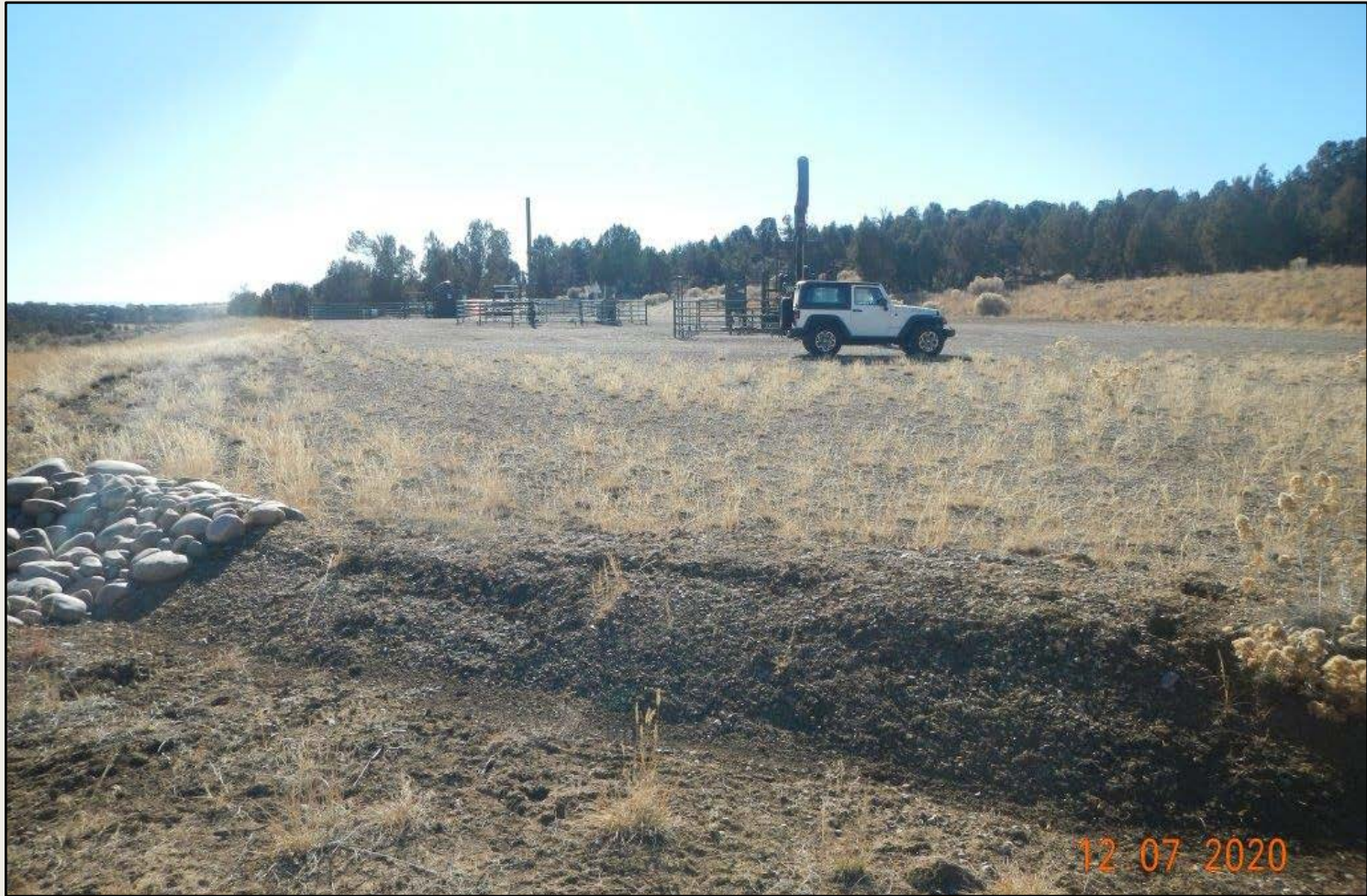
Photo 1. View of the project area from the northeastern corner facing center.