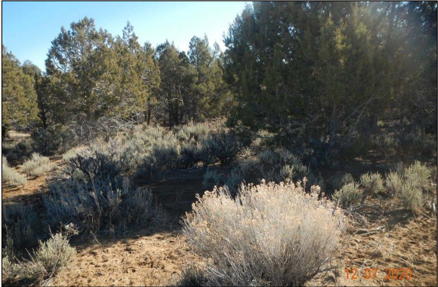
Photo 6. View of the reference area comprised of sagebrush shrubland and pinyon/juniper woodland with understory of squirreltail, blue grama, and penstemon spp.