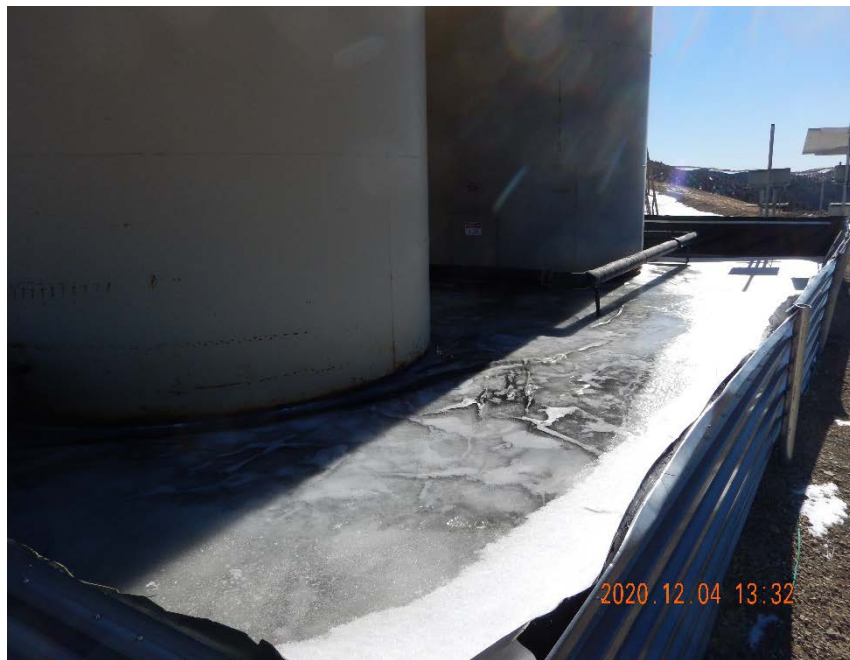
Photo #5 - Accumulation of ice inside of tank battery secondary containment area.