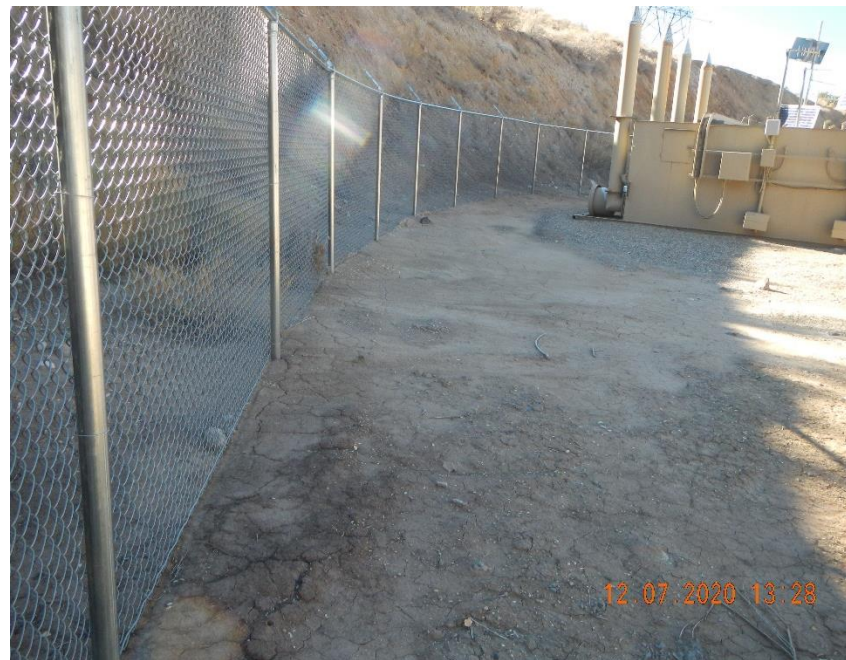
Sediment movement from cut slope.