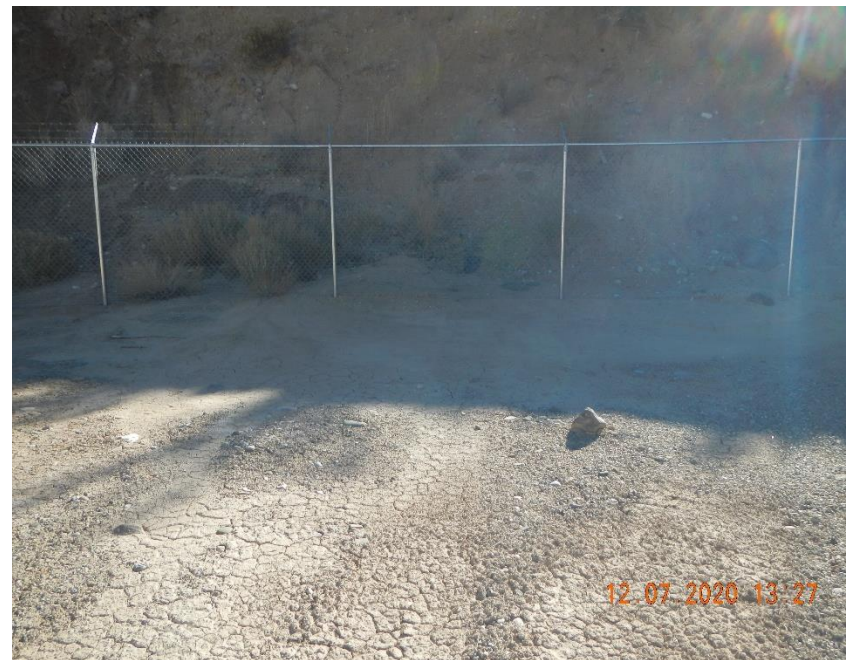
Sediment movement from cut slope.