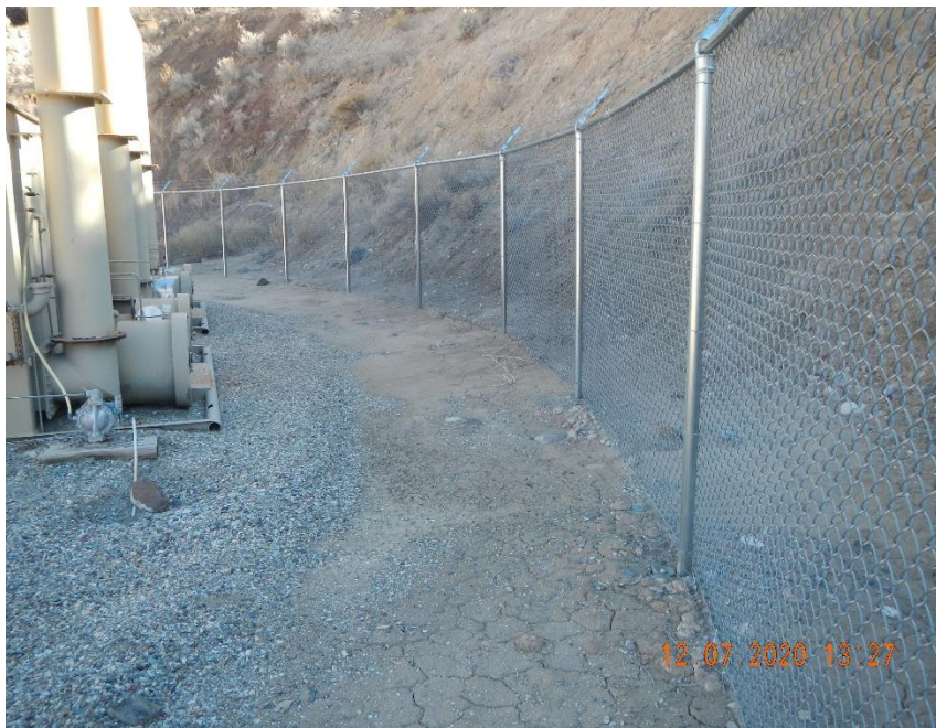
Sediment movement from cut slope.