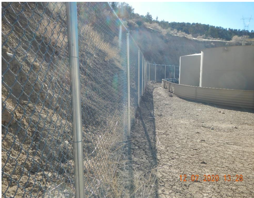
Sediment movement from cut slope.