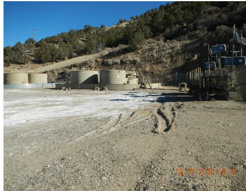
Ruts around location.